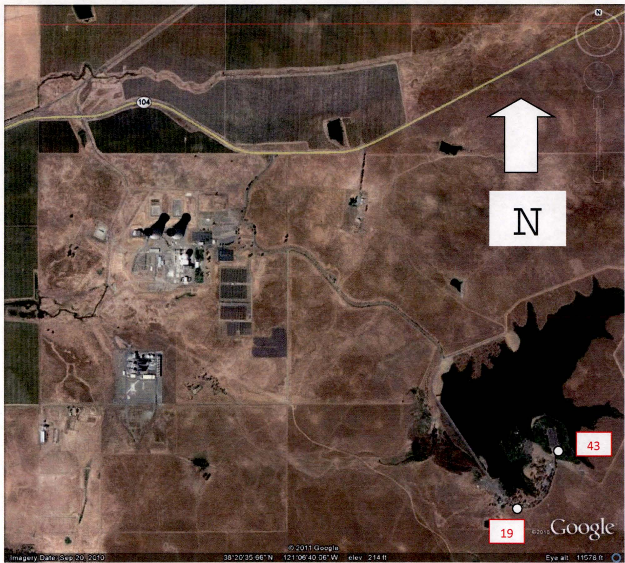
Figure B-2 Radiological Environmental Control Locations