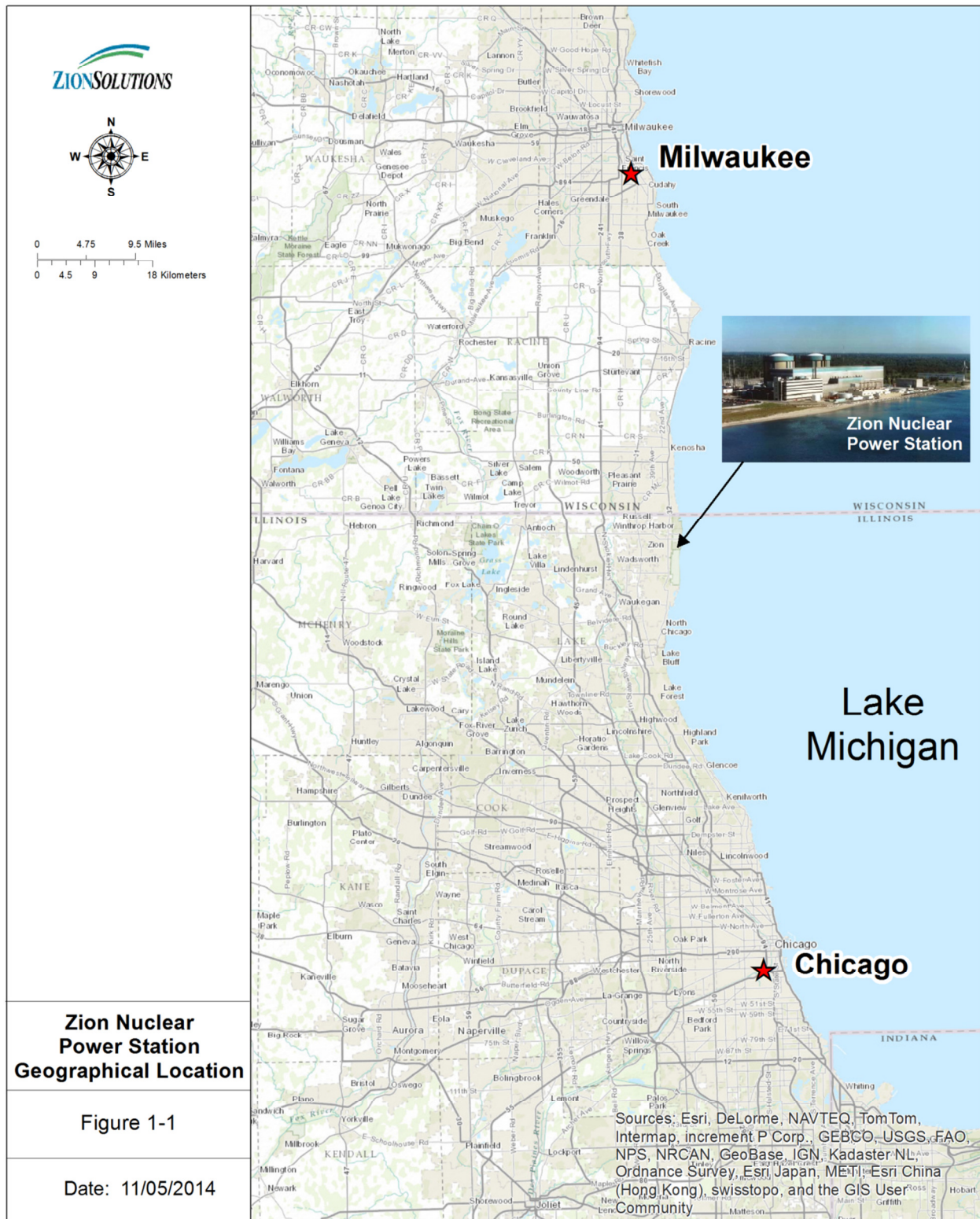
Figure 1-1 Zion Nuclear Power Station Geographical Location