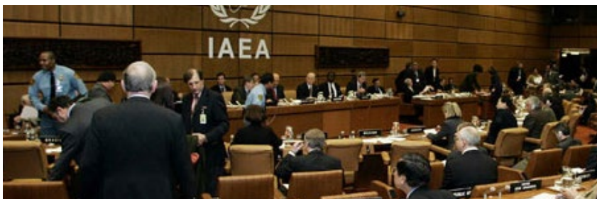
The NRC participates in the annual General Conference for the International Atomic Energy Agency in Vienna, Austria.

The NRC offers bilateral training, workshops, and peer reviews of regulatory documents to assist more than 60 countries as they develop or enhance their national nuclear regulatory infrastructures and programs. The NRC also supports and participates in regional working group meetings to exchange technical information among specialists. If asked, the NRC will respond directly to countries looking for help to improve their controls of radioactive material.