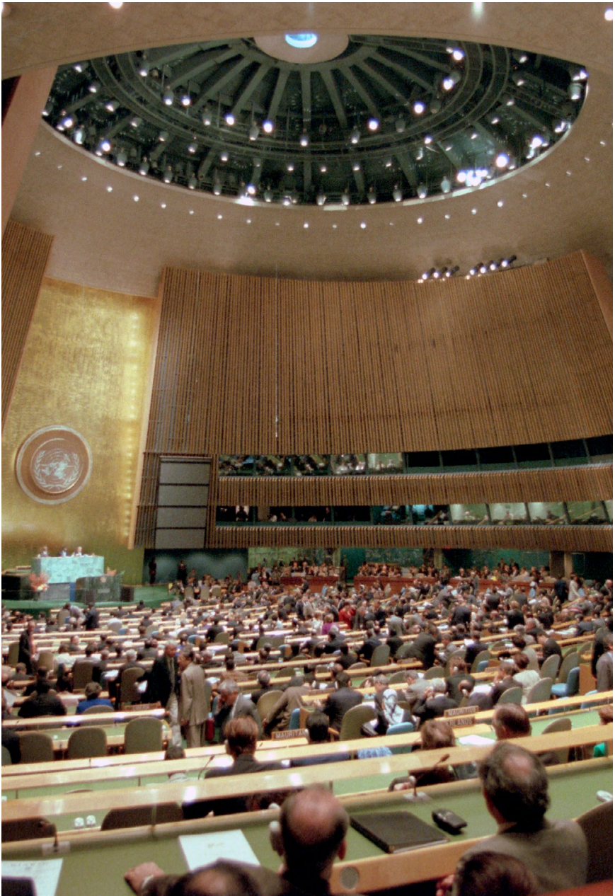
The United Nations General Assembly meets in New York to discuss, among other topics, world nuclear matters.