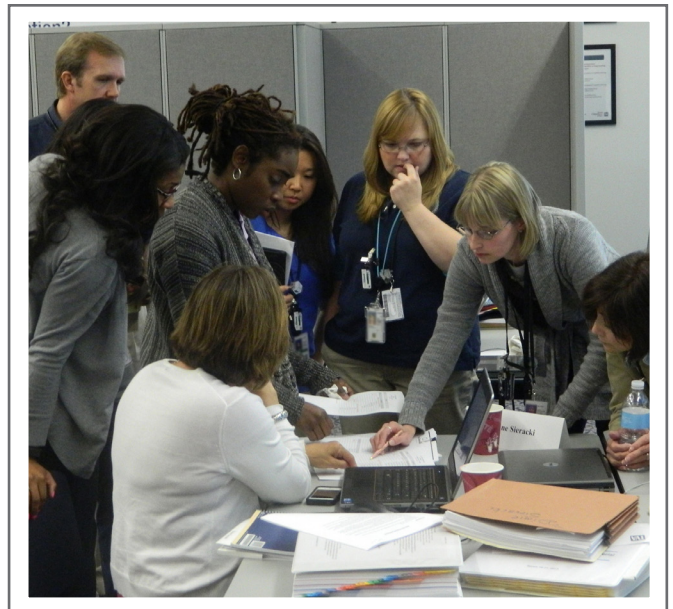
Safety Culture Assessment Team