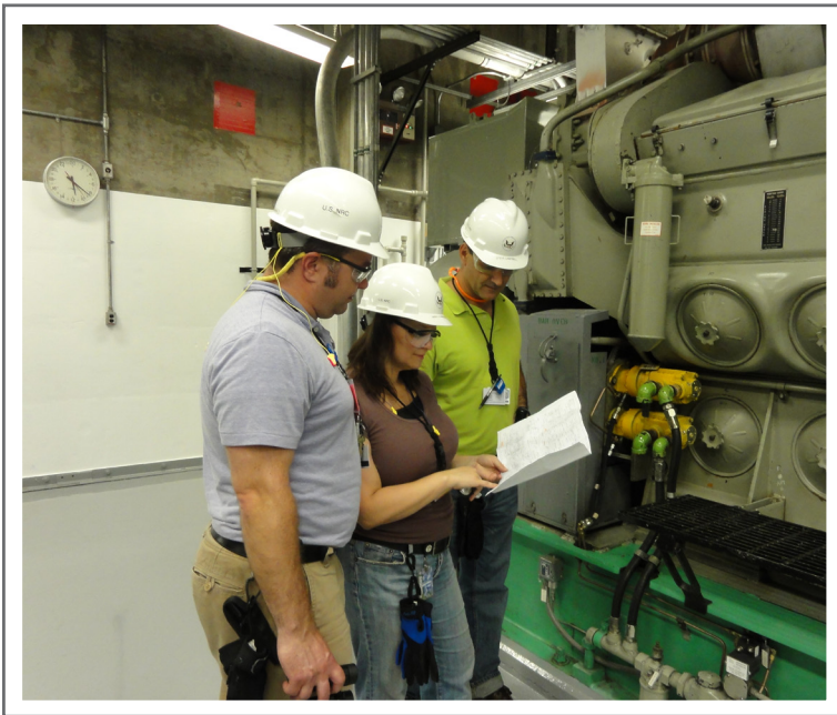
NRC Inspectors conduct seismic walkdowns at nuclear power plants