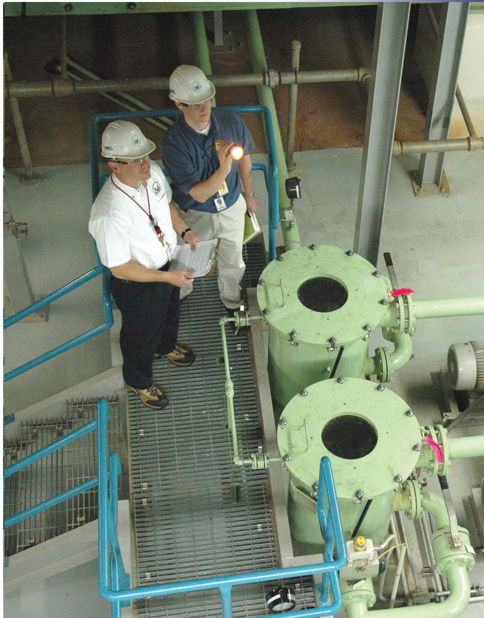
NRC Inspectors at Wolf Creek Generating Station