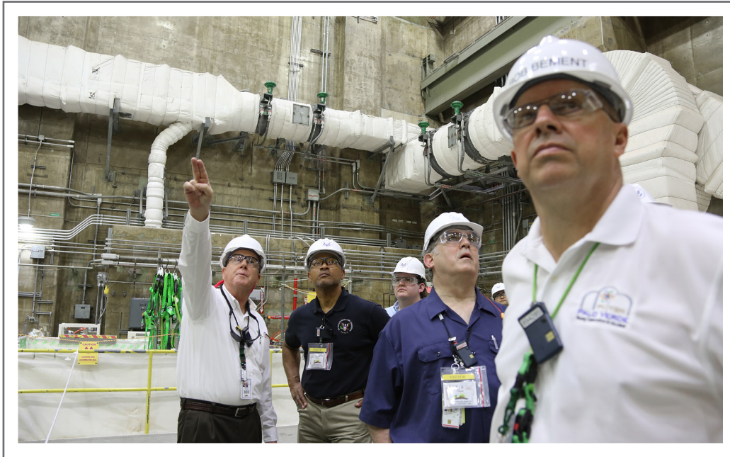
NRC Executive Director tour of Palo Verde Nuclear Generating Station

Security Strategy 5: Support U.S. national security interests and nuclear nonproliferation policy objectives consistent with the NRC's statutory mandate through cooperation with domestic and international partners.