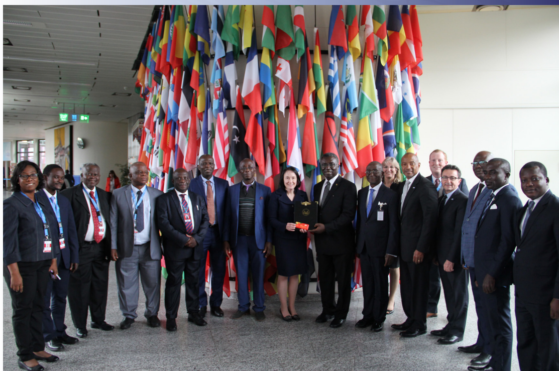
Chairman Svinicki at the 61st International Atomic Energy Agency General Conference in Vienna, Austria