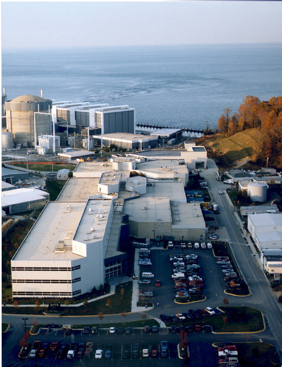
Calvert Cliffs Nuclear Power Plant