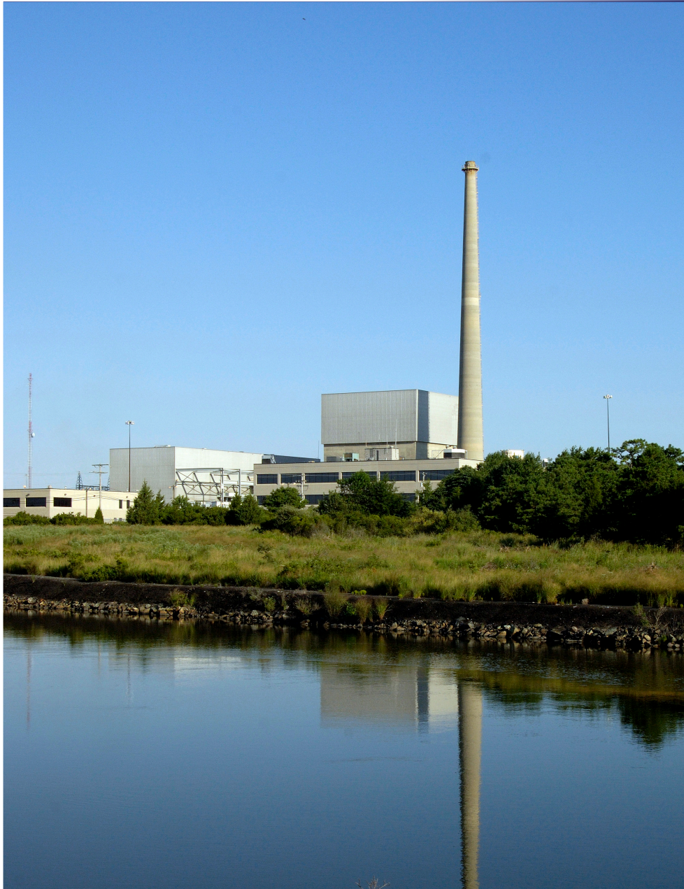
Oyster Creek Nuclear Power Station