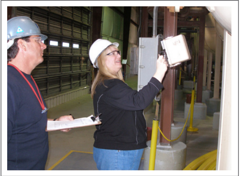
Gamma radiation survey

The licensees and certificate holders that are authorized to possess and use radioactive materials have primary responsibility for the safe use of radioactive material. The safety responsibility of licensees is defined through licensing and continuing regulatory oversight and enforcement throughout all stages in the lifetime of a facility. This approach is the means by which the NRC ensures the successful outcome of the safe use of radioactive materials.