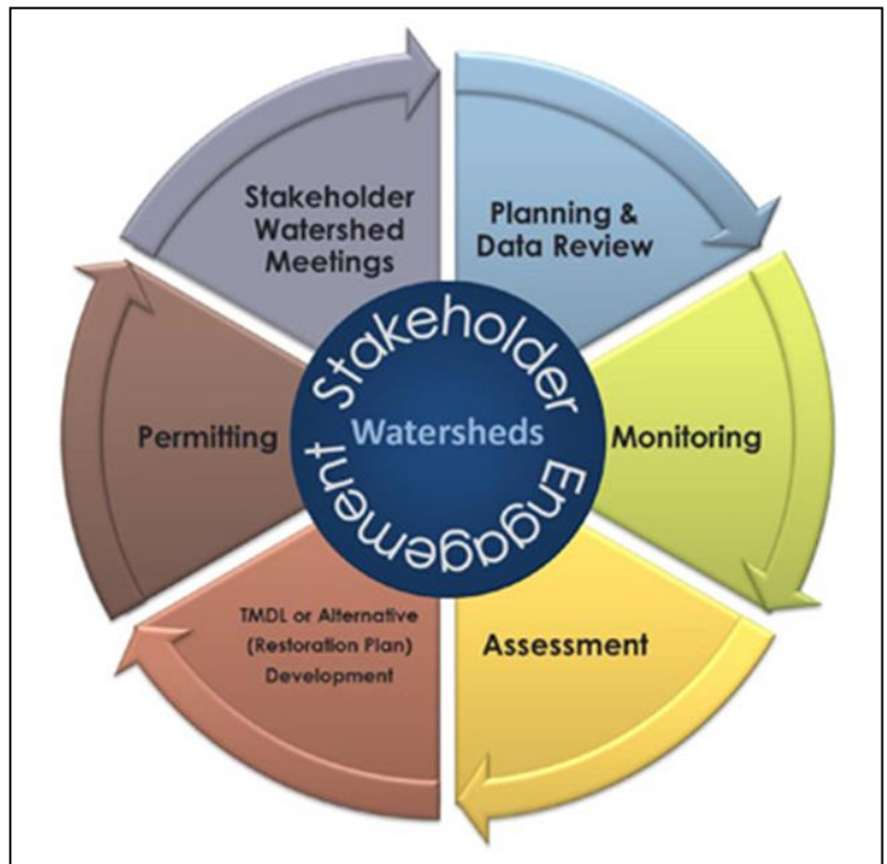
Figure 1: Watershed Cycle

Stream inventoried on the 303(d) List as violating one or more water quality criteria must be scheduled, on some priority basis, to have TMDLs developed to assist in the identification of control strategies.