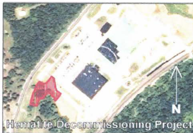
HDP Satellite Site View LSA 05-04 in Red Crosshatching

LSA 05-04 is designated Class 1 and is located in the Barns and Cistern Open Land Area and includes the former Cistern Burn Pit. This SU is partially located within the Technetium (Tc) Surrogate Evaluation Area (SEA); therefore, as a conservative measure, the Tc-99 SEA DCGLs were used only for Scan MDC calculations where the inferred Tc-99 DCGL for U-235 is 1.2 pCi/g. The surrogate DCGL for U-235 was used for the calculation of Scan MDC only. Laboratory analysis for Tc-99 will be performed on all final status survey samples and as such, the adjusted U-235 DCGL values will not be used to demonstrate compliance with the final status survey dose criteria. The two-dimensional areal extent of LSA 05-04 is 2,027 m 2 upon which the systematic sampling grid is based. The interior surface area (three-dimensional) of Survey Unit LSA 05-04 is 2,135 m 2 .