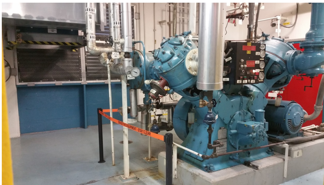
Figure 5-4: Example Air Compressor with Subcomponents