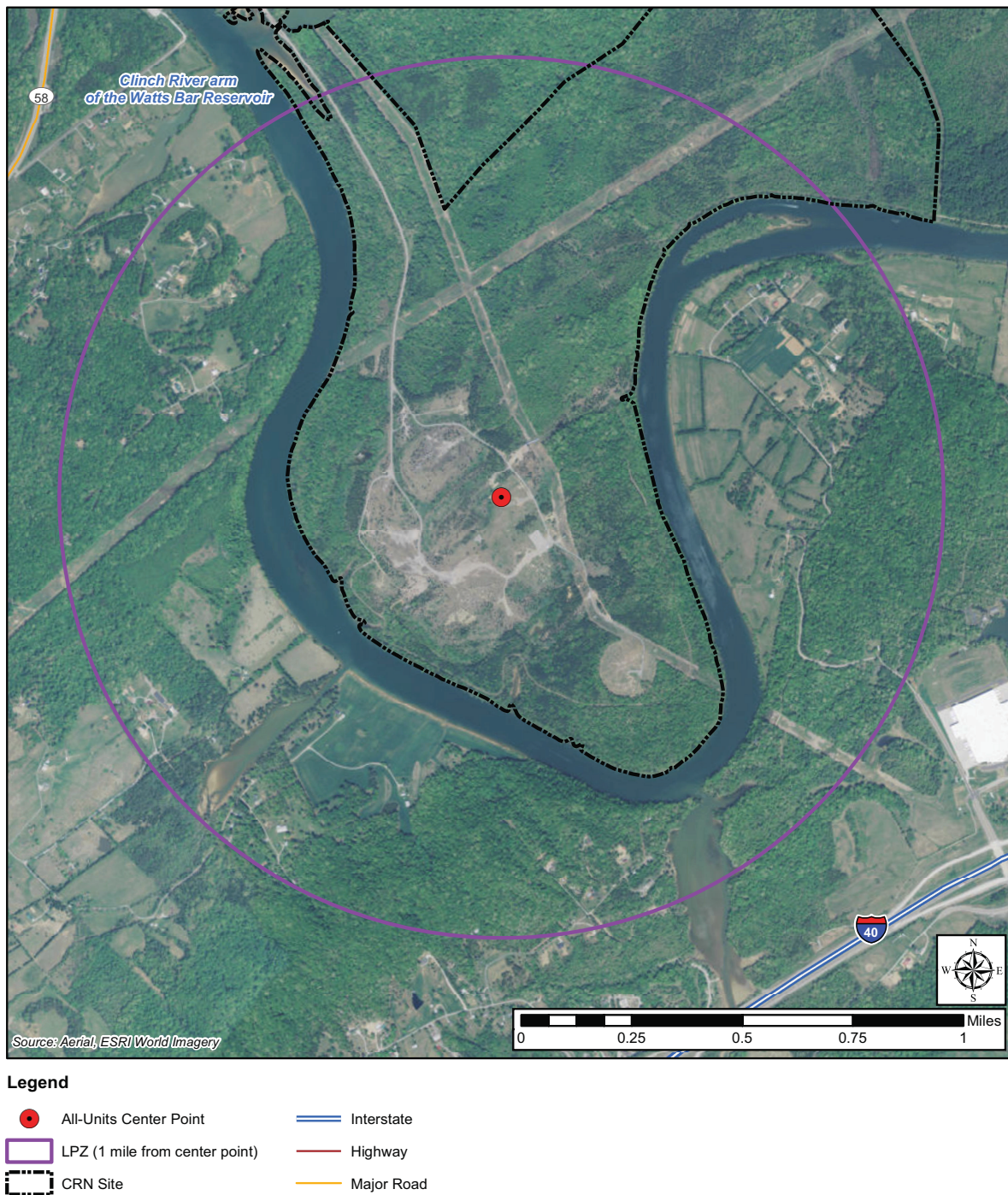
Figure 2.7.5-3. Site Center Point and Distance to the LPZ