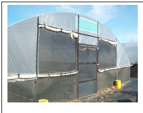
Figure 1: Greenhouse with positive soil sample.

Balamuthia is the third and latest discovered genera of free-living ameba which can cause Granulomatous Amebic Encephalitis (GAE) in humans and animals. Balamuthia mandrillaris was first isolated in 1986 from a mandrill baboon that had died of encephalitis in a zoo in the US. In 1991, the first human infection of Balamuthia was diagnosed and since then more than 200 cases worldwide have been identified. In the US, at least 70 cases have been diagnosed to date, with more cases occurring in warmer climates. The incubation period ranges usually from weeks to months but can be two years or longer. Prognosis is very poor if diagnosis