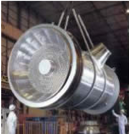
Monju SFR IHX

■ At higher temps, materials behave inelastically. Allowable stresses are explicit functions of time & temperature