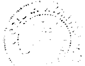
图 10 为 1978 年 12 月 10 日 14 时 00 分至 14 时 10 分, 在 1000 毫巴等压面上, 沿 110°E 经线, 从 10°N 至 20°N 的经向风场。图中显示, 在 10°N 附近, 有一个明显的正风异常, 其强度约为 10 m/s, 而在 15°N 附近, 有一个明显的负风异常, 其强度约为 -10 m/s。这些异常与图 9 中的异常有密切的关系。