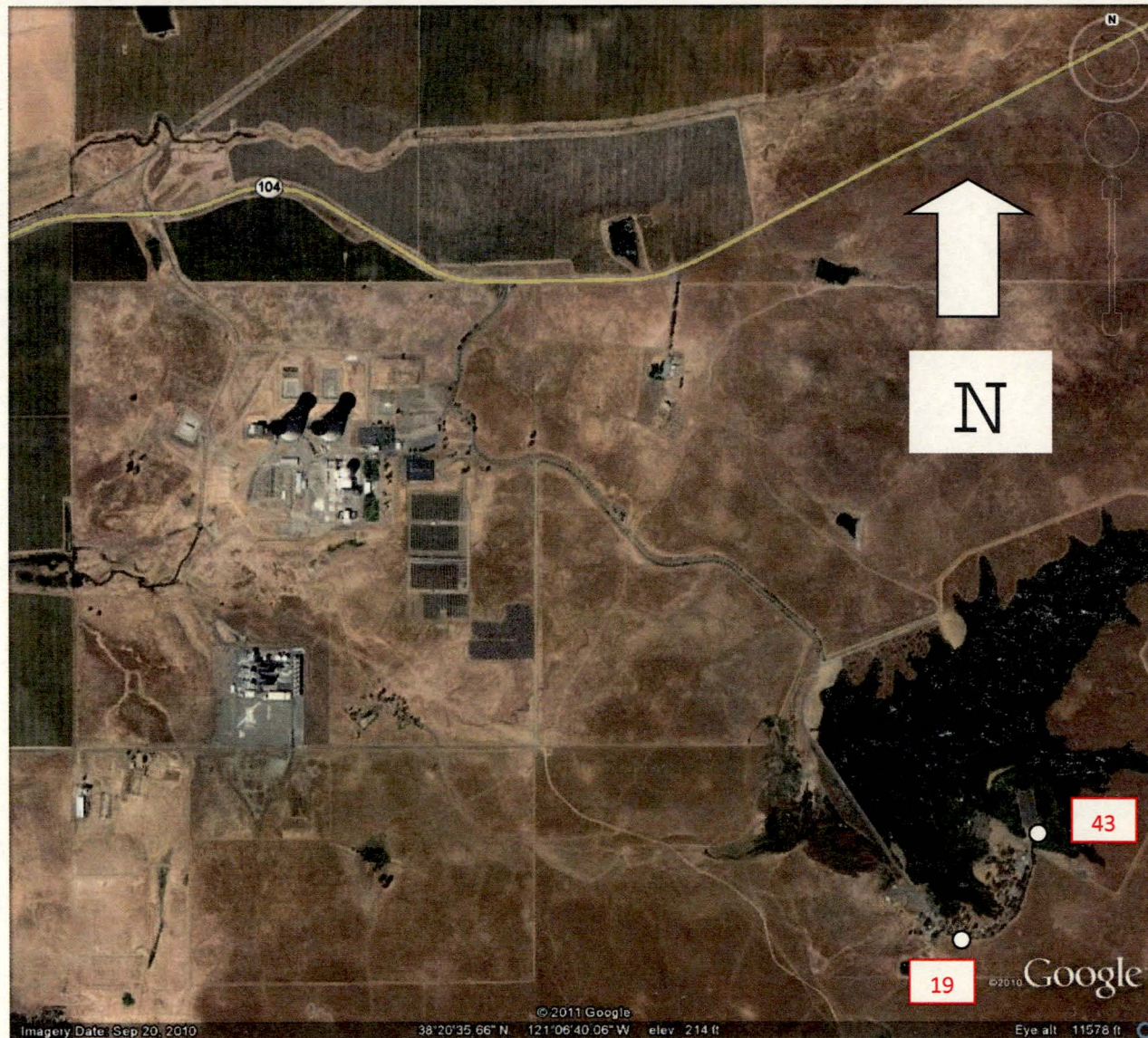
Figure B-2 Radiological Environmental Control Locations