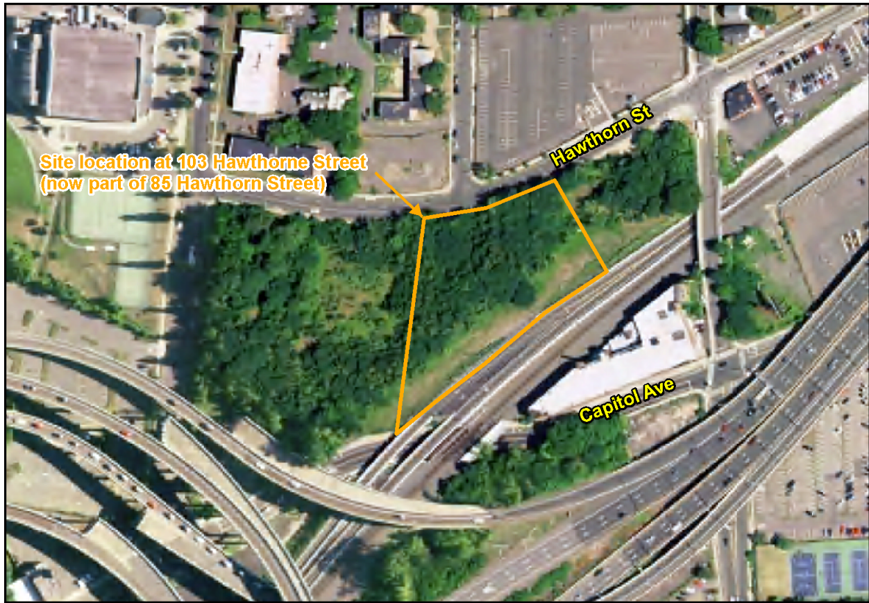
Figure 1. Aerial View of approximate location of 103 Hawthorne Street (USDA-APFO 2016).