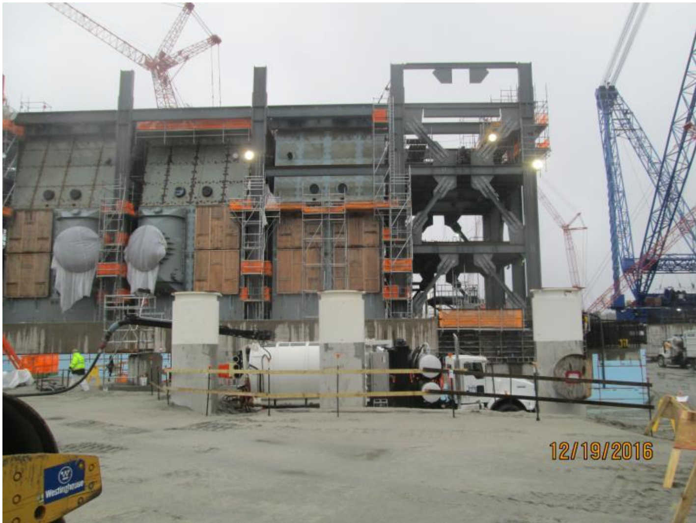
Unit 3 Turbine Island