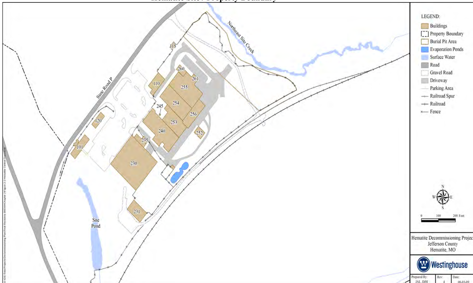
Figure 1 Hematite Site / Property Boundary