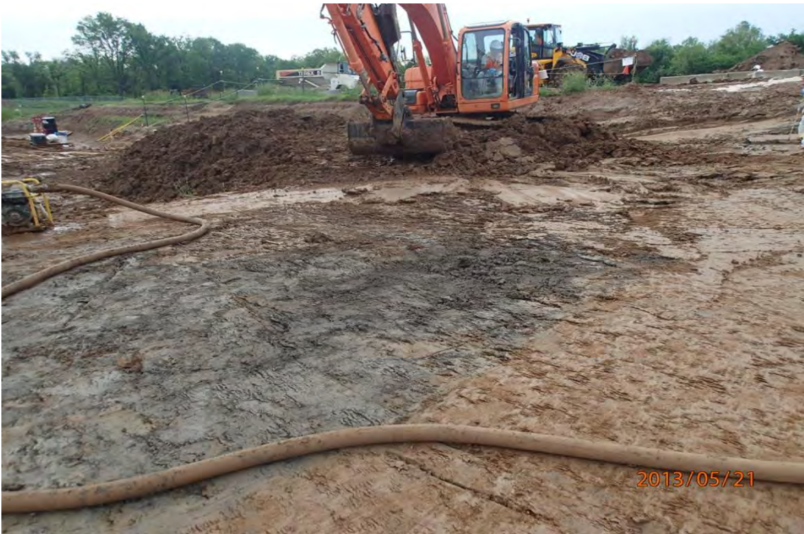
Figure 4 Example of Soil Discoloration where a Burial Pit was Located

identified by a change in soil color in spite of the fact that their size and shape was not as well defined as the documented pits. See Figures 4 and 5. Additionally, the equipment operators conducting the excavation could distinguish when they were digging in a burial pit based on the difference in the hardness of the soil. Workers could even detect the difference in the soil hardness when walking over a burial pit, which tended to be soft and spongy. Adding to the visual and soil hardness cues, the burial pit was also radiologically identifiable based on a GWS once reaching the contaminated layer.