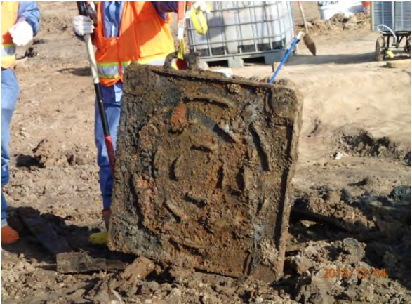
Figures 7 and 8 Examples of Radium Contaminated Filter Plates Being Unearthed While Excavating in the Burial Pit Area

the burial pits were as anticipated, 215 radium contaminated filter plates made of steel, cast iron, and plastic, about 3 feet by 3 feet in size, were unexpectedly found. See Figures 7 and 8. It was determined that these were brought to the Hematite site from an offsite entity. Figures 9 and 10 also show several examples of some of the waste from the burial pits.