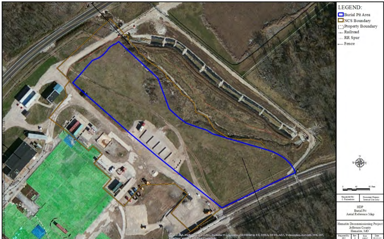
Figure 3 Burial Pit Area