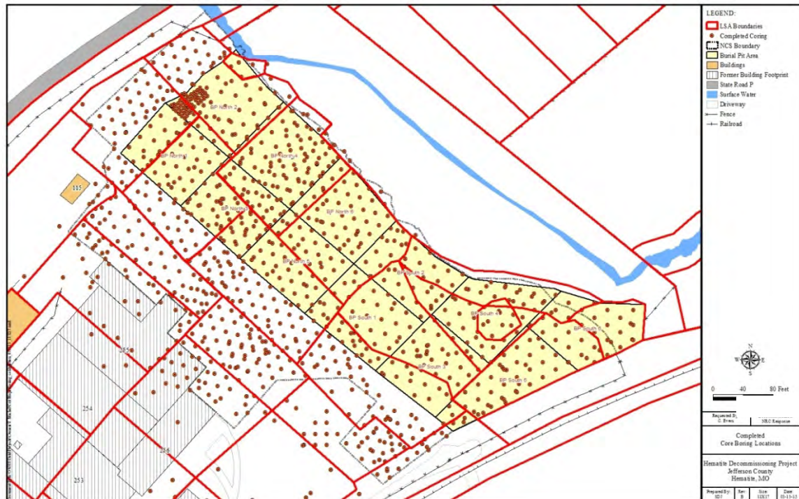
Figure 11 Core Bore Locations that were Performed for Nuclear Criticality Safety Control Purposes

Separate from the radiological remediation activities, excavation was also necessary to comply with State of Missouri regulatory requirements for VOCs. To meet the RGs for VOCs, a large portion of the burial pit area was remediated beyond what was required to remediate for radiological contamination. In some cases, this resulted in the entire core boring previously conducted for criticality concerns to be dug out as the excavation activities continued. In several locations, soil was excavated down to the phreatic zone. After all these activities, not one instance was identified where a second burial pit was located below an existing burial pit, or where radiological remediation activities had ceased.