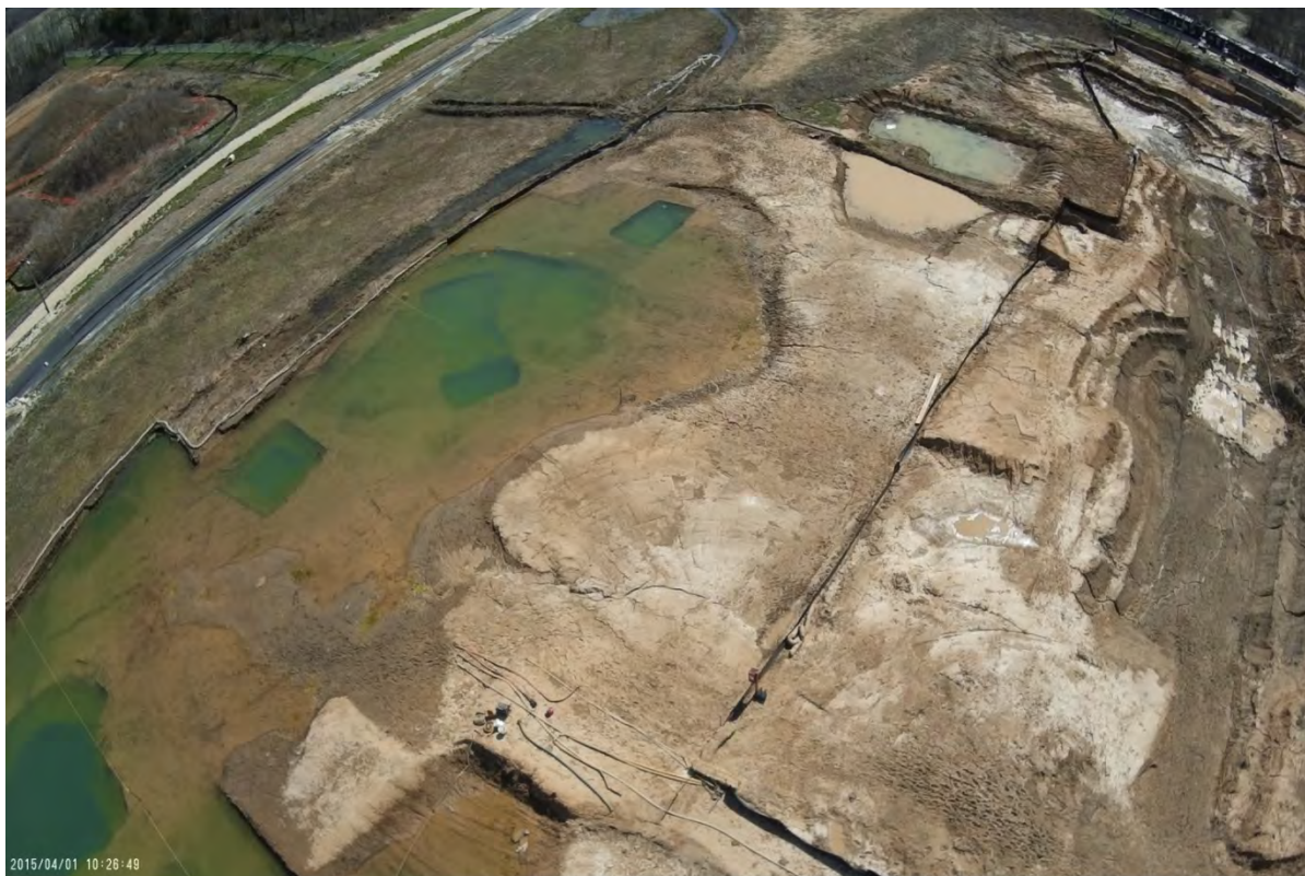
Figure 14 Aerial View of a Portion of the Burial Pit Area Post Remediation Looking West to East

Figure 14 provides an aerial view of most of the Burial Pit Area taken on April 1, 2015. The photograph was taken after all remediation activities, both radiological and chemical, were completed. While a portion of the area had filled with water following the completion of excavation activities, the change in water color with depth helps visually identify the change in depth and extent of some of the excavated areas. The large excavation identified in the lower-left corner of Figure 14 is where a large number of burial pits were located in close proximity, and is near where the radium plates were found. The Burial Pit Area will be backfilled with clean soil from offsite and the site topography restored prior to license termination.