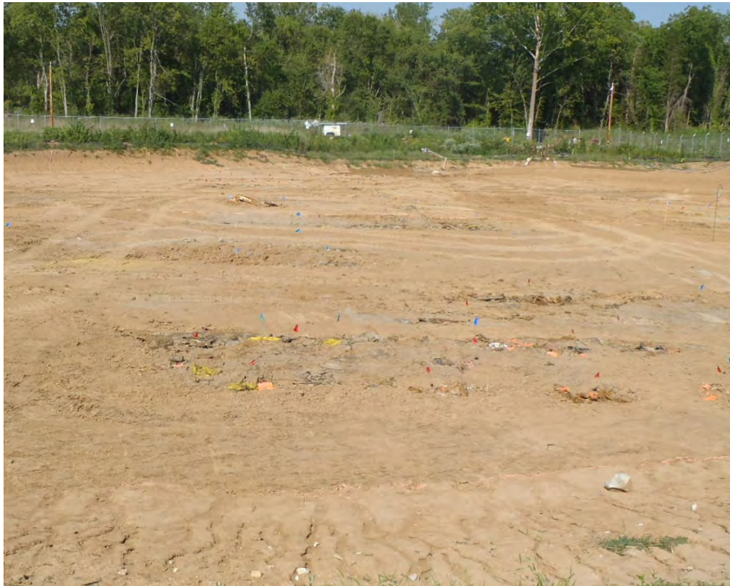
Figure 5 Example of Multiple Burial Pits Visually Identifiable by a Change in Soil Color as Well as by Uncovering Trash and Debris

Initially the removal of the overburden began in 1 foot lifts as specified in the HDP DP. The intent of the 1 foot lifts was to ensure potentially fissile quantities of material could be identified for appropriate handling, and to enable waste to be identified and removed so a maximum volume of soil could be saved for reuse. The process called for in situ scanning to identify and remove soil areas exceeding 0.1g U-235/L. Any lumps of material that potentially exceeded 40g U-235 total would be separated out and undergo a more thorough evaluation utilizing close proximity radiological surveys to determine if further handling requirements were necessary to maintain NCS compliance. At this point any material that was identified ex-situ to be greater than 15g U-235 required segregation from the waste stream, and special handling for NCS Control purposes. The NCS evaluation performed at the time identified that material in-situ less than 40g U-235 could go unidentified with a 12 inch lift, but any of the material identified ex-situ greater than 15g U-235 still required segregation. It had been determined that these were adequate ex-situ survey controls to provide a wide margin of Criticality Safety, and also demonstrate compliance with offsite waste disposal acceptance criteria.