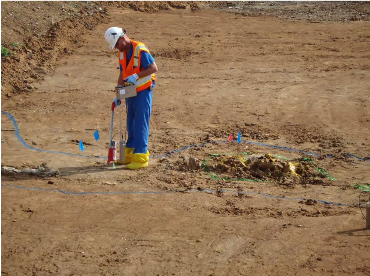
Figure 6 Example of Worker Conducting a Gamma Walkover Survey (GWS) in the Burial Pit Area with a NaI 2 x 2 Detector

Overall the process of locating, assessing and removing debris from the burial pits was very labor intensive. For example, on several occasions hundreds of small plastic vials were found. In each case, every vial had to be separately surveyed by two independent technicians using different instrumentation. While the majority of materials located within