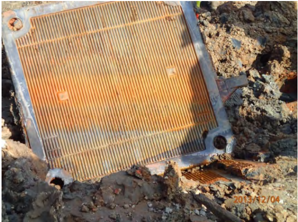
Figures 9 and 10 Examples of Debris that was Exhumed During Remediation Excavation of the Burial Pit Area