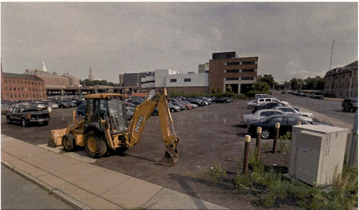
Figure 1. 340-342 Capitol Avenue (Google Earth, 2011)

According to Google Earth (2011), it appears to currently be a parking lot (see Figure 1).