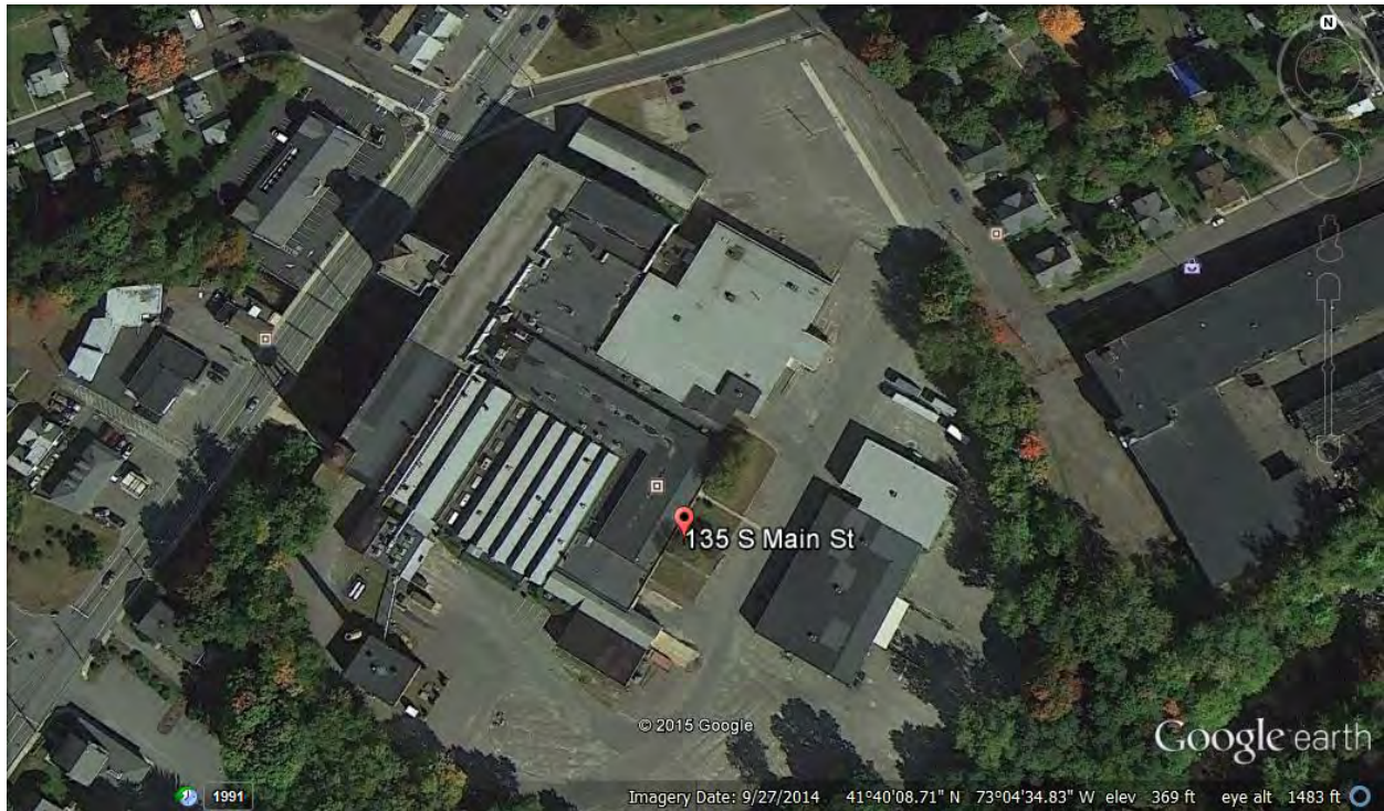
Figure 2. General location of the former Seth Thomas Clock Company