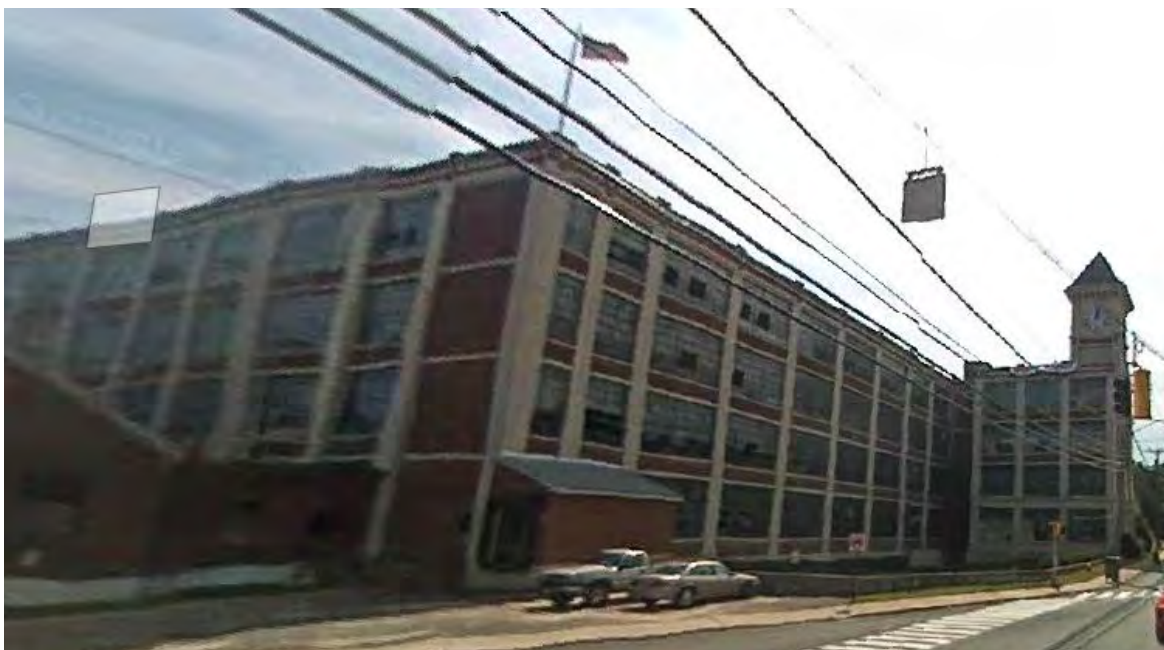
Figure 1. Former Seth Thomas Clock Company Building.

As of November 2015, the building has 19 tenants and is advertising to lease additional space.