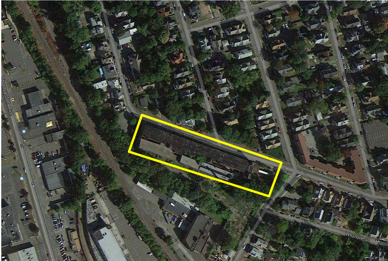
Figure 1. Location of Lux Clock Company (Google Earth, 2015)