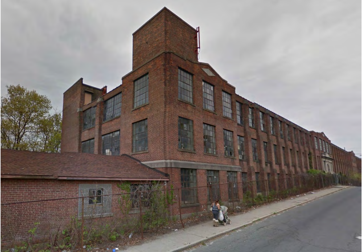
Figure 2. Lux Clock Company (95 Johnson Street)