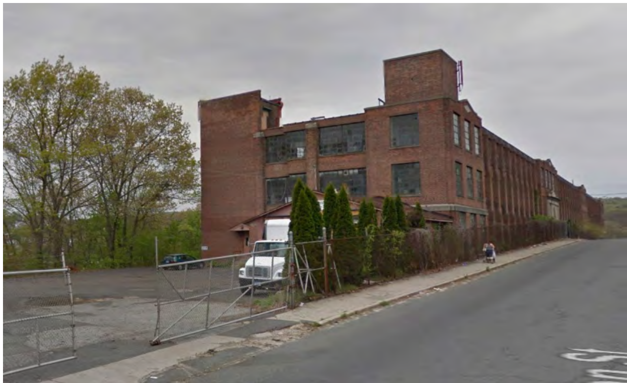
Figure 4. Shipping entrance to former Lux Clock Company