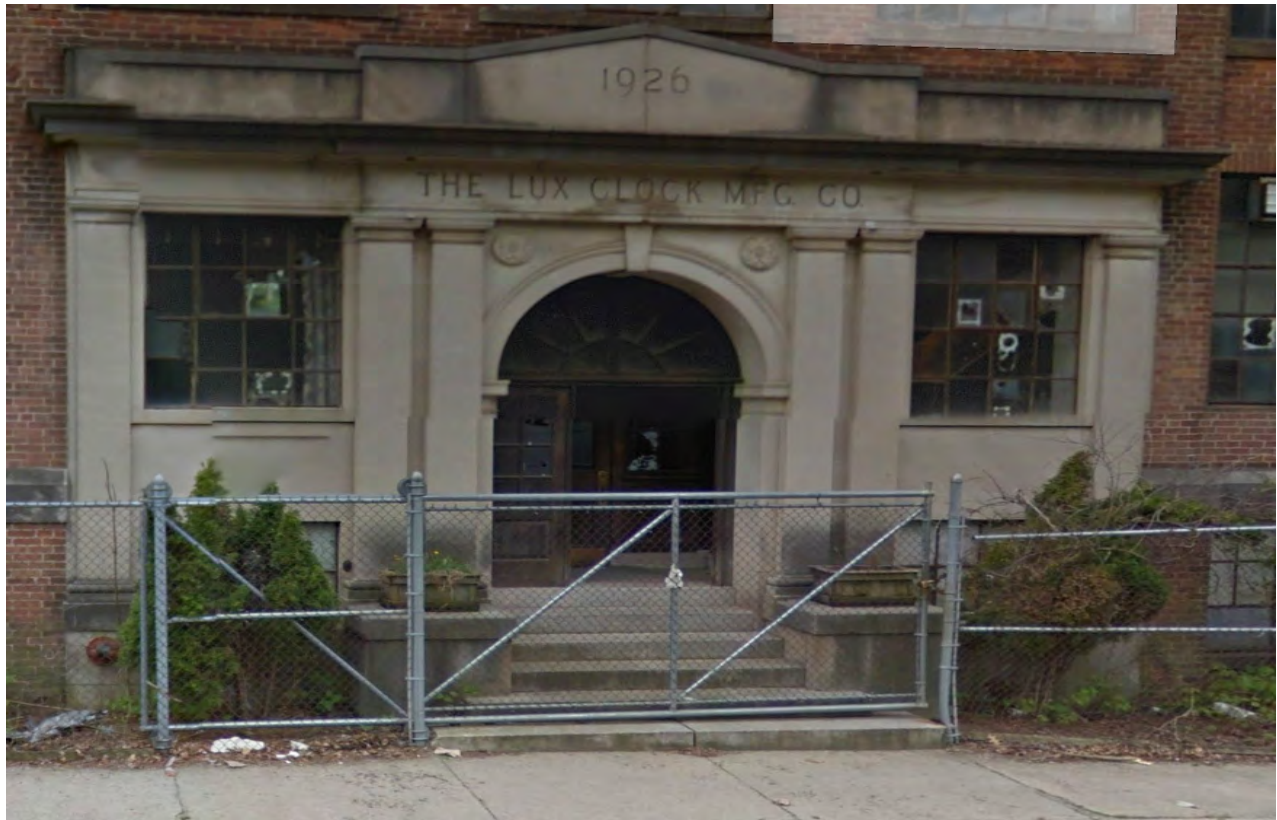
Figure 3. Entrance to old Lux Clock Company (Google Earth, 2015)