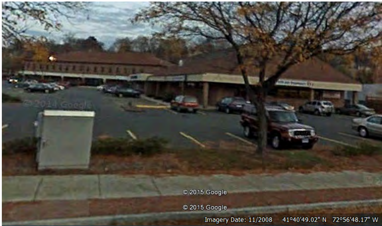
Figure 5. 430 N. Main St. (Strip mall)