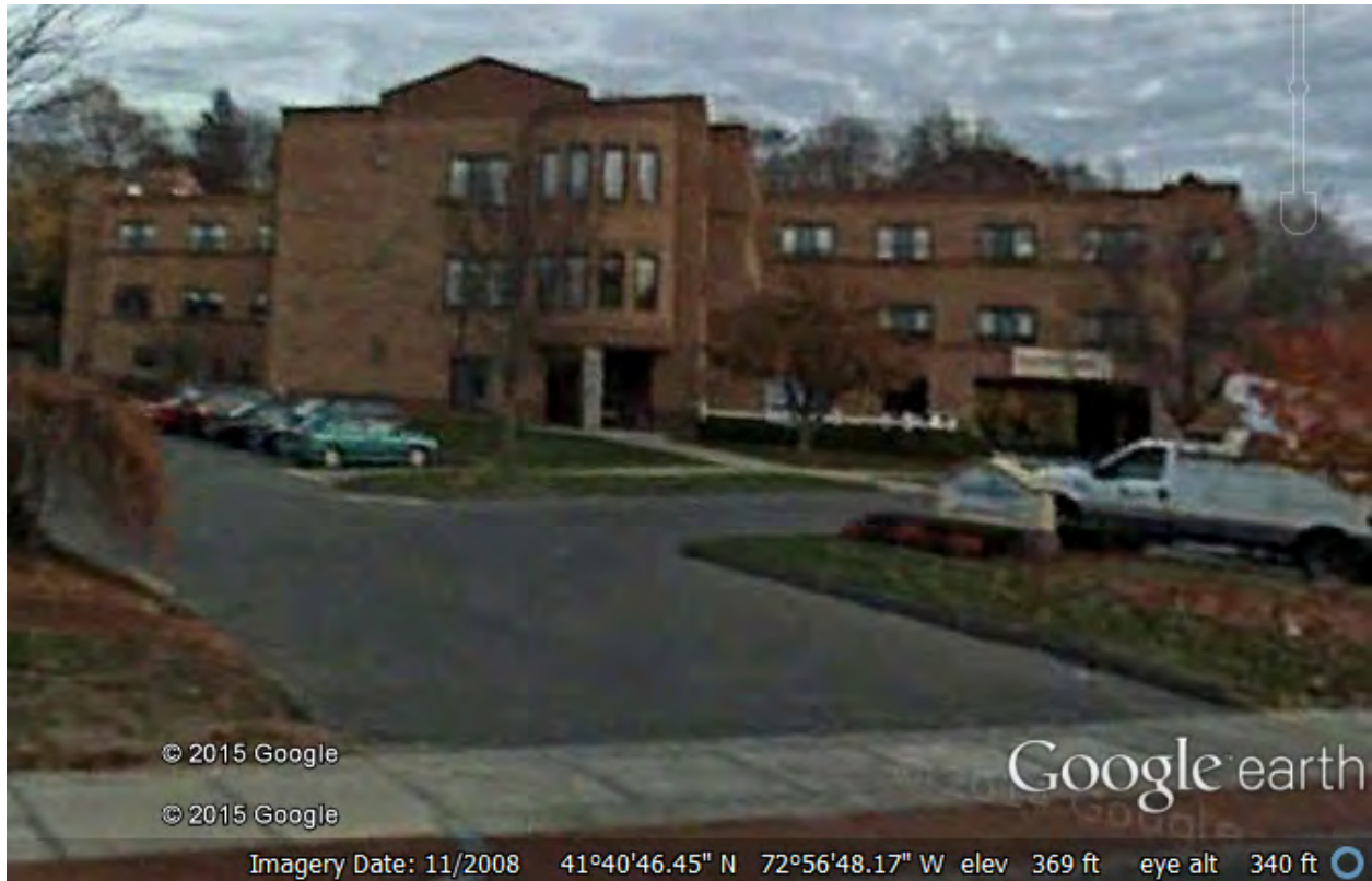
Figure 3. 400 N. Main St. (Ingraham Manor)