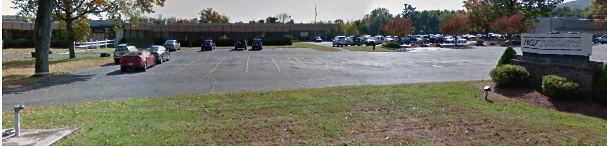
Figure 7. 210 Redstone Hill Road (Rowley Spring and Stamping) (Imagery Date October 2012)