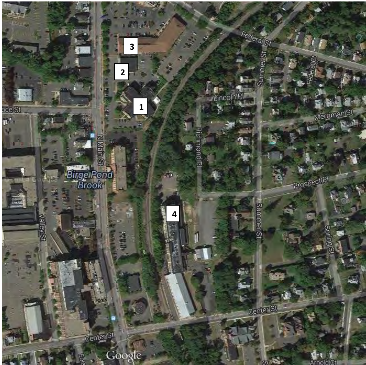
Figure 1. Locations of Ingraham Clock Company facilities

(1- 400 N. Main St. (now Ingraham Manor), 2- 420 N. Main St. (now medical offices), 3- 430 N. Main St. (now a strip mall), 4- 284 N. Main St. (now DeLorenzo Towers)