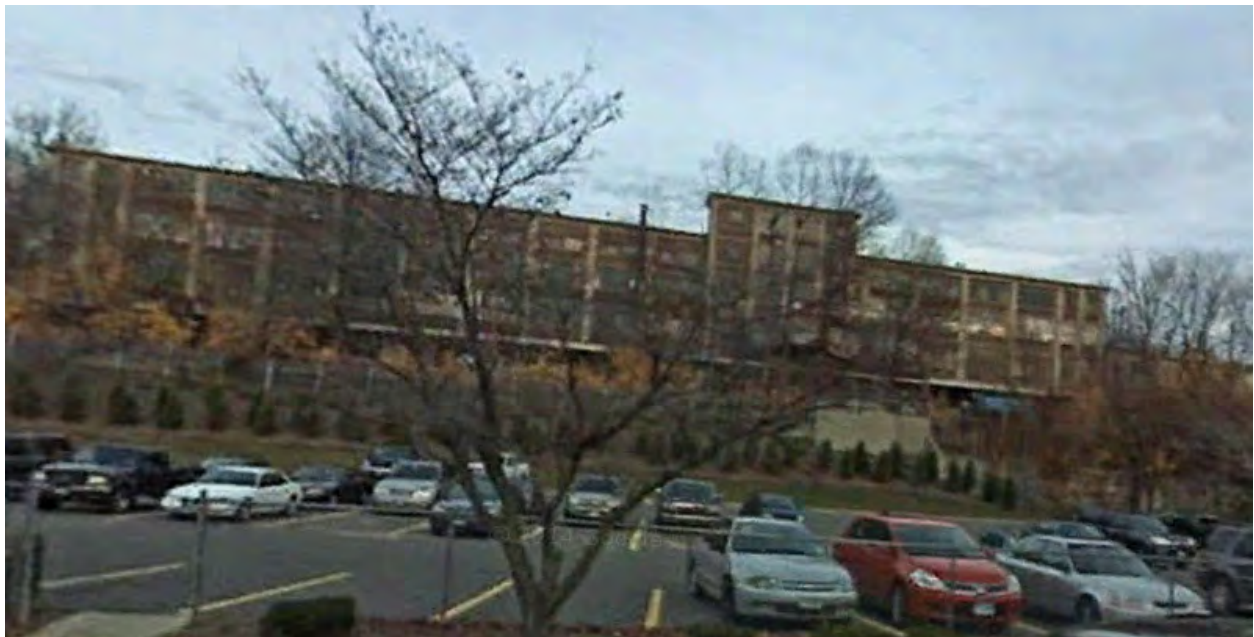
Figure 6. 284 N. Main St. (DeLorenzo Towers) (Imagery Date 11/2008) (Google, 2015)

The former location of Ingraham Clock Company (from 1958 to 1967) at 210 Redstone Hill Road is currently occupied by Rowley Spring and Stamping (Figure 7).