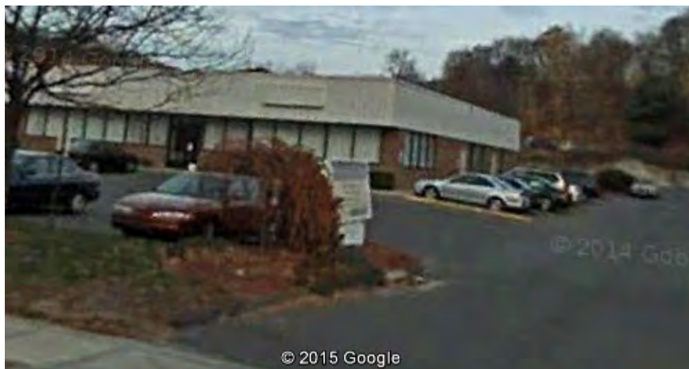
Figure 4. 420 N. Main St. (medical offices) (Imagery Date 11/2008) (Google, 2015)