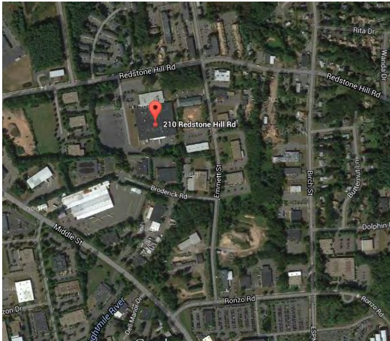
Figure 2. 210 Redstone Hill Rd. (Google Earth, 2015)