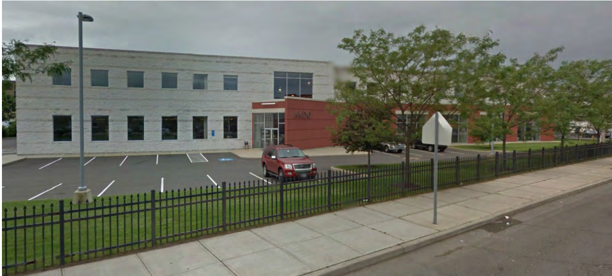
Figure 3. West End Industrial Park, Entrance to AKDO