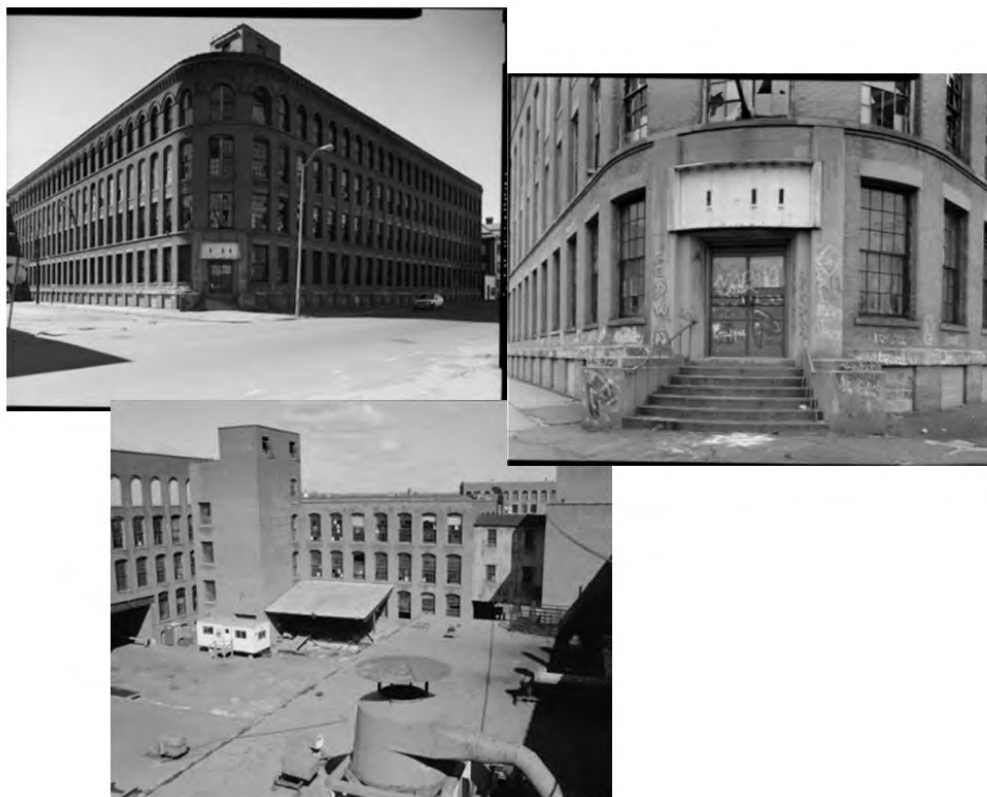
Figure 1. Photos of the abandoned Bryant Electric Company from 1995.

CT DEP clean-up of the site under RCRA began in 1988 (EPA, 2008). The article mentions that decontamination and demolition of all facilities was completed in 1996. CBS Corporation then installed a soil vapor extraction system and groundwater treatment system to clean up VOCs from the soil site. The article never mentioned testing for or cleaning up radium.