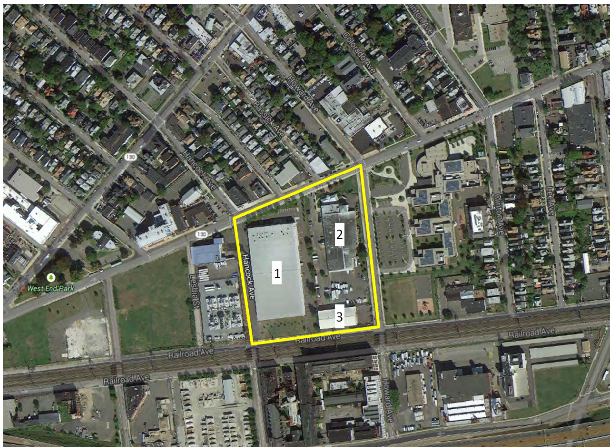
Figure 2. Former footprint of Bryant Electric Company, Bridgeport CT. 1 – West End Industrial Park; 2 – Chaves Bakery; 3 – possibly ASAP Bedliners

Bridgeport is the most populous city in CT. It is located in Fairfield County on the Pequonnock River and Long Island Sound. According to the 2010 U.S. Census, the population of Bridgeport was 144,229; the 2014 population estimate for the city was 147,612 (United States Census Bureau, 2015).