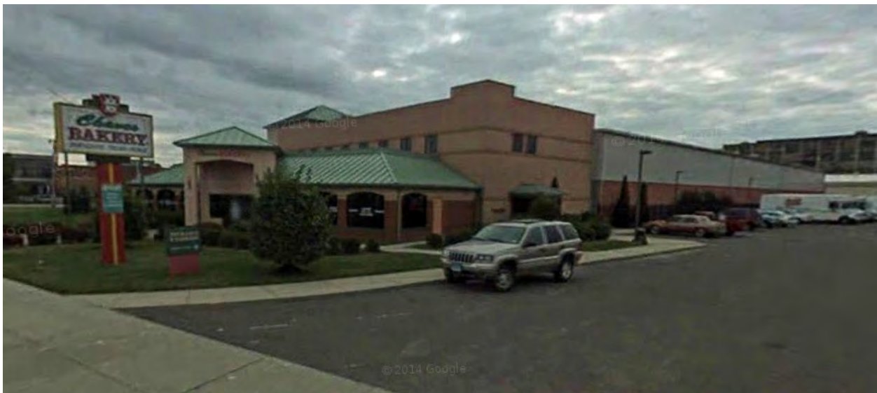
Figure 4. Chaves Bakery (Google Earth, 2015)