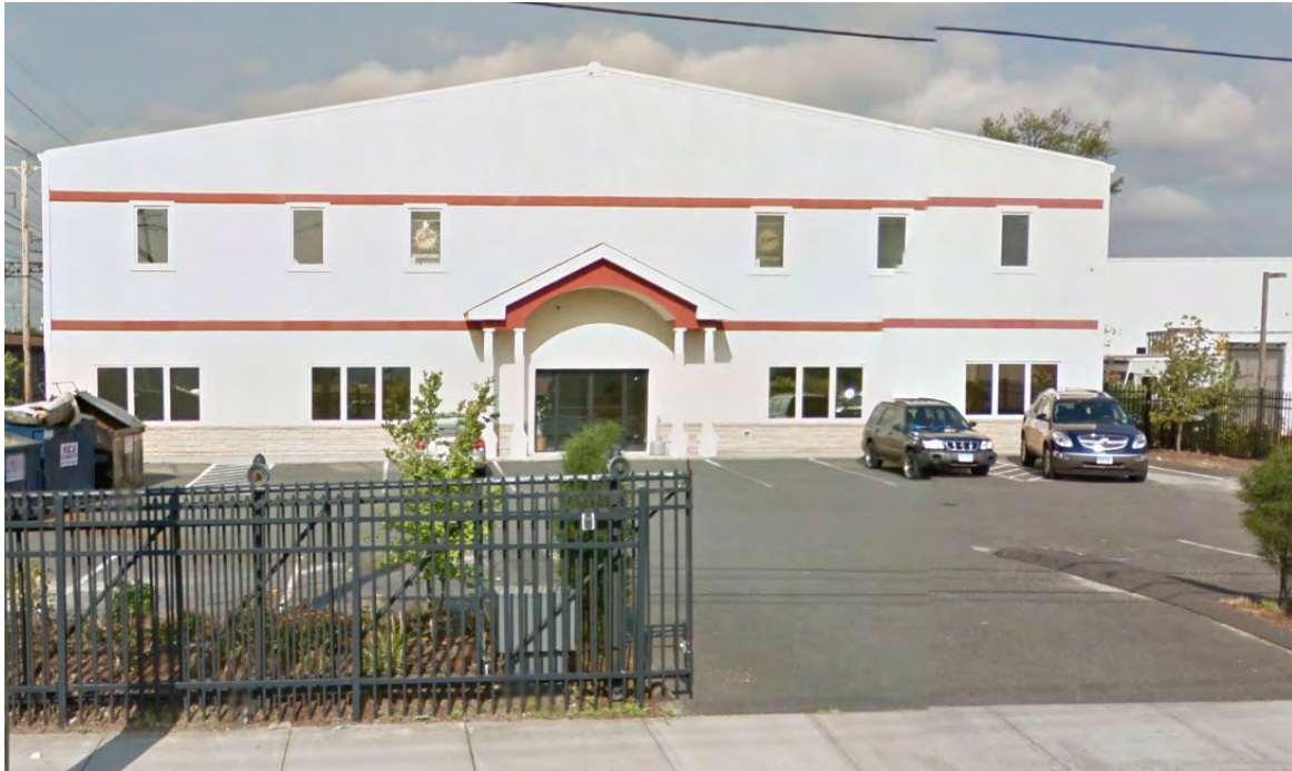
Figure 5. Unknown Building (potentially ASAP Bedliners)