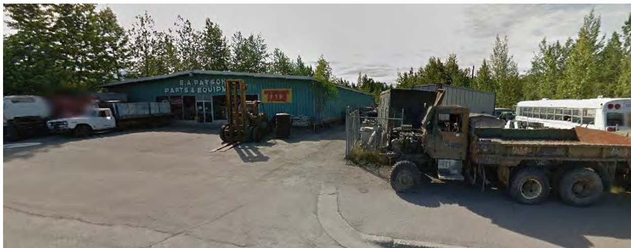
Figure 1. E.A. Patson Parts & Equipment (5700 Boundary Avenue) in July 2011

It is suspected that radium may have been present at the site in WWII-era vehicles and parts as luminous radium dials, gauges, and instruments.