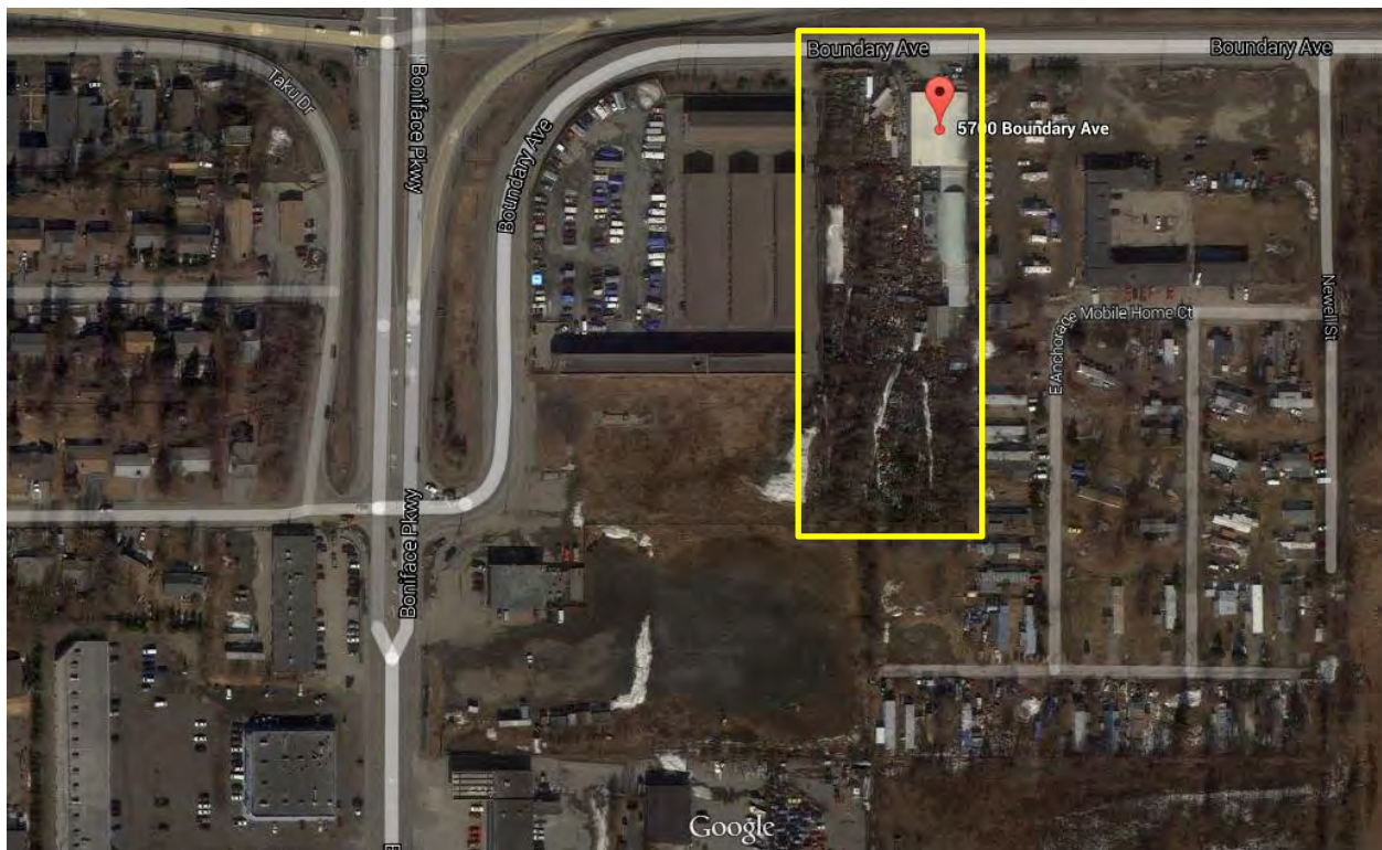
Figure 2. Location of E.A. Patson Parts & Equipment (5700 Boundary Avenue) and surrounding areas

Anchorage is Alaska's most populous city and contains more than 40 percent of the state's total population. According to the 2010 U.S. Census, the population of Anchorage was 291,826; the 2014 population estimate for the city was 301,010 (United States Census Bureau, 2015).