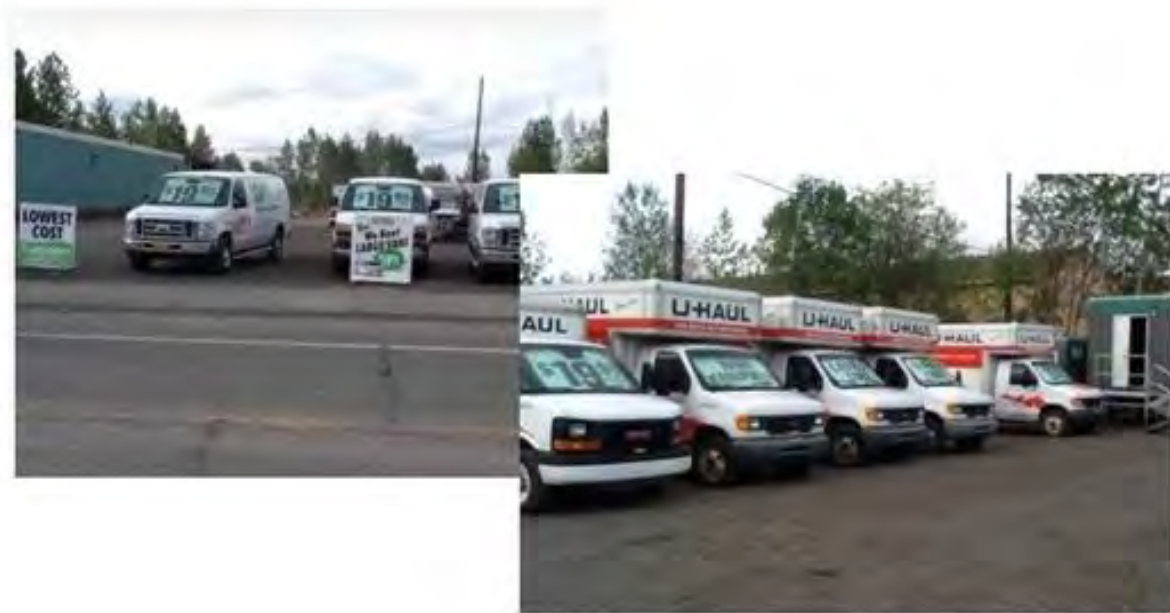
Figure 3. U-Haul Moving & Storage of North Anchorage (5700 Boundary Avenue) (Google Earth, 2015)

As of November 2015, U-Haul Moving & Storage of North Anchorage is located at the former Military Truck Salvage Yard (Figure 3).