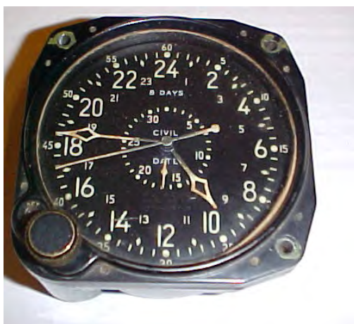
Figure 1. Waltham WWII CDIA 8 Day USN Aircraft Clock available for sale at War Dog Militaria (War Dog Militaria, 2015) (Image from May 2015)

This supplier carries genuine military surplus and collectibles dating back to pre-WWI. Some of the items for sale include WWII Aircraft dials, gauges, clocks and more (War Dog Militaria, 2015) (Figure 1). Due to historic documentation of luminous radium usage in vintage gauges, dials, and military instrumentation, it is suspected that radium was present in some of the items available for sale.