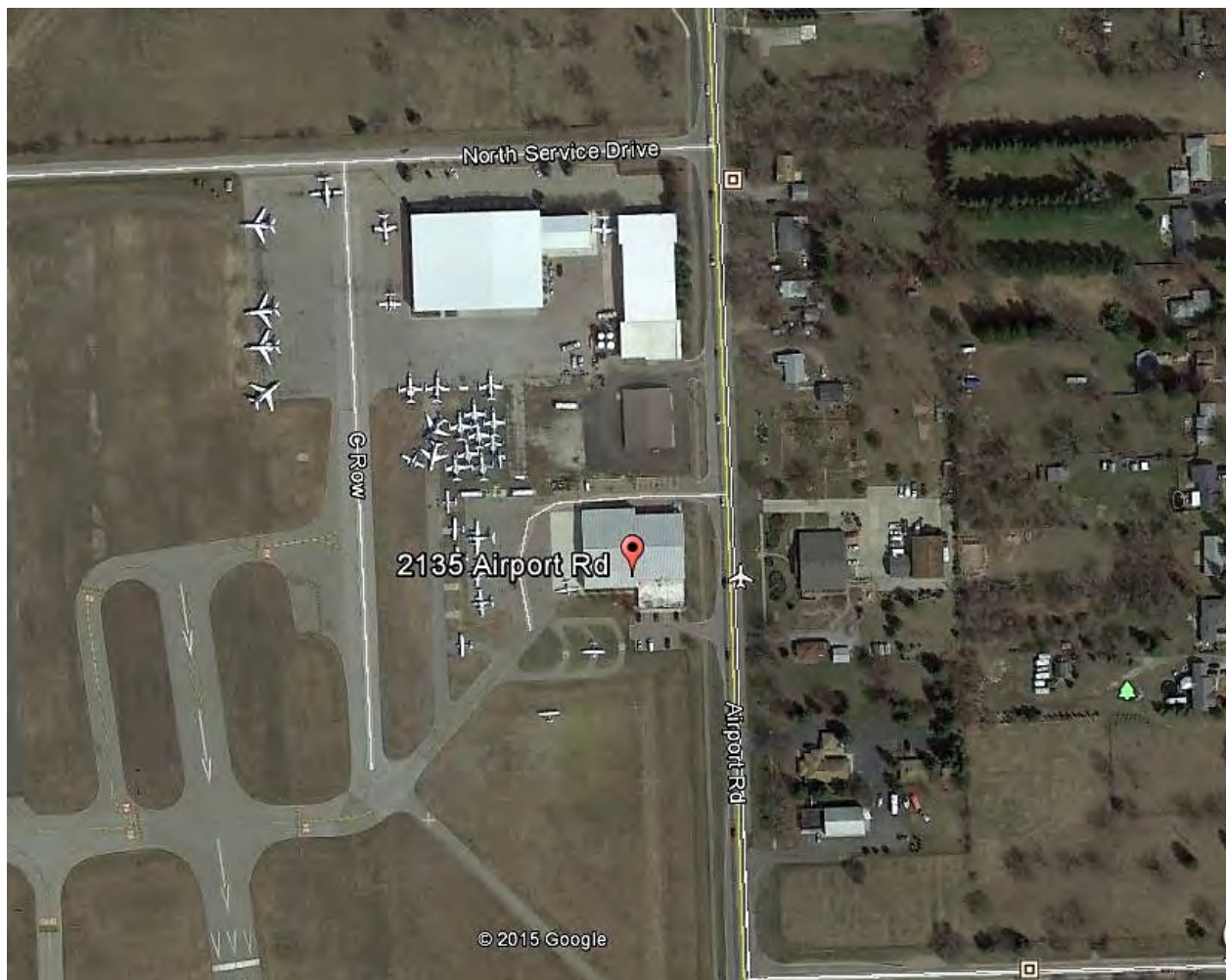
Figure 3. Approximate Location of Metro Aircraft Instruments (2135 Airport Road, Waterford, MI) (Google, Earth 2015)