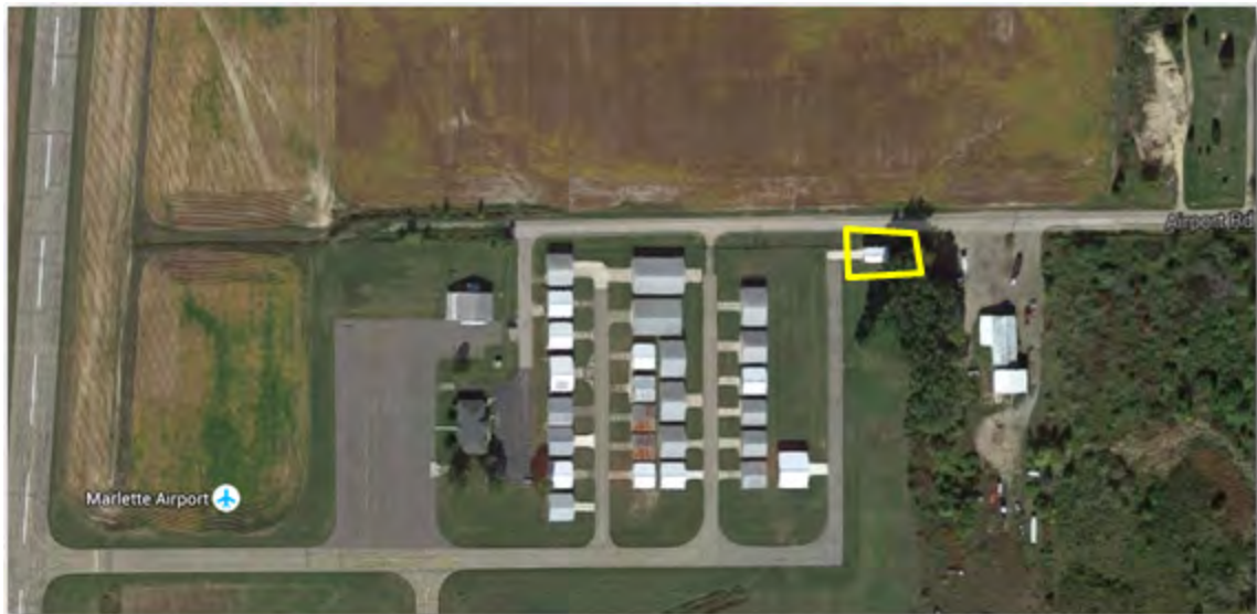
Figure 1. Location of Burton Aviation (6727 Airport Road, Marlette, MI)