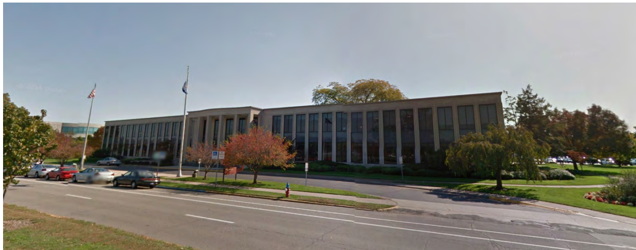
Figure 3. 1700 Mishawaka Avenue (Indiana University Administration Building) (IU, 2015)

The soil site is currently occupied by Indiana University at South Bend as the Office of Administrative and Fiscal Affairs.