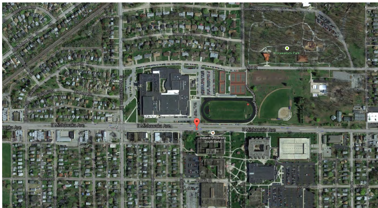
Figure 2. Location of 1720-1730 Mishawaka Avenue (Google Earth, 2011)

South Bend is the county seat of St. Joseph County and is located on the St. Joseph River near its southernmost bend. According to the 2010 U.S. Census, the population of South Bend was 101,168; the population estimate for 2014 was 101,190 (United States Census Bureau, 2015).