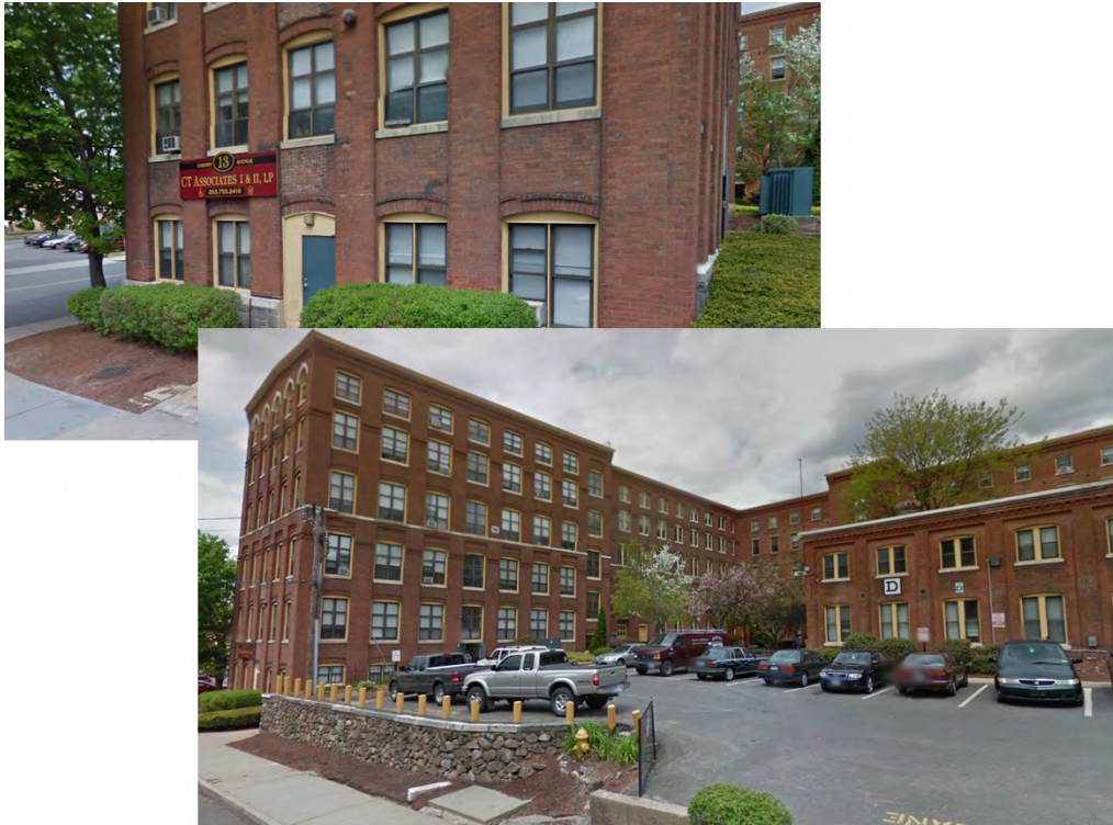
Figure 3. 13 Cherry Avenue (Buildings A, B, C, D, F, and M; Enterprise Apartments) (Google Earth, 2015)

After Waterbury Clock Company closed, operations at this building included the manufacture and distribution of leather belts, handbags, and neckties by the Belco Company. The 39 Cherry Avenue building has been vacant since 2004 (Haley & Aldrich, 2013). NOW currently owns this building and has plans to redevelop it in the future.