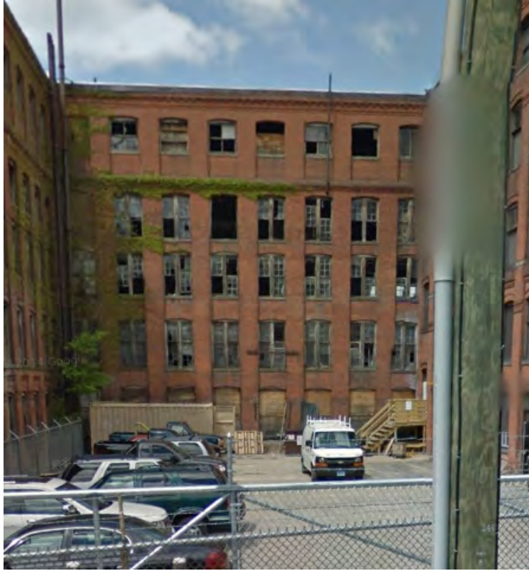
Figure 4. 39 Cherry Avenue (Building G; formerly Belco, now vacant and owned by NOW)

177 Cherry Street was used as a clothing manufacturer and manufacturer of metal products from the 1960s through the 1970s. There is limited information on site use since the 1980s. The building is currently vacant (Haley & Aldrich, 2013).