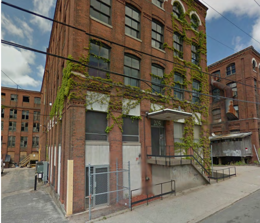
Figure 6. 205 Cherry Street (Building O, Ville Swiss Automatics)

From 1953 through 1958, the building was occupied by a manufacturer of underwear, surgical instruments, and metal products. From 1960s through 2002, the building's use fluctuated from being vacant to a clothing and leather products manufacturer. The 215 Cherry Street building has been vacant since around 2004 (Haley & Aldrich, 2013).