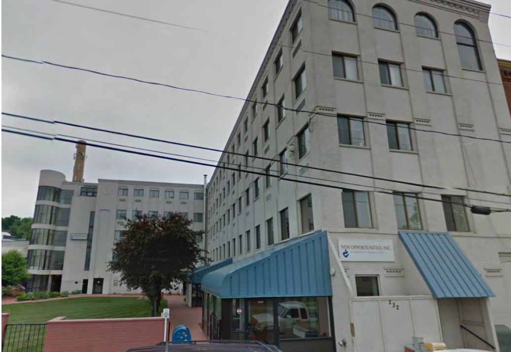
Figure 8. 232 N. Elm Street (Buildings I and J, NOW)