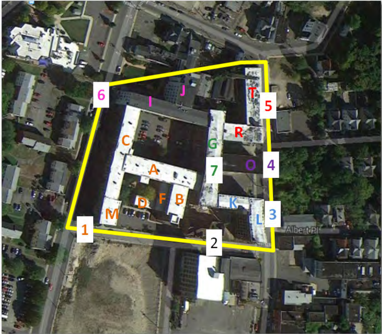
Figure 1. Location of Waterbury Clock Company Facilities and surrounding Affected Facilities (1 – 13 Cherry Ave, buildings A, B, C, D, F, and M, Enterprise Apartments; 2 – 0 Cherry Ave, building #7, vacant; 3 – 177 Cherry St, buildings K and L, vacant; 4 – 205 Cherry St, building O, Ville Swiss Automatics; 5 – 215 Cherry St, buildings R and T, vacant; 6 – 232 N Elm St, buildings I and J, NOW; 7 – 39 Cherry Ave, building G, formerly Belco, now vacant and owned by NOW) (Google Earth, 2015)