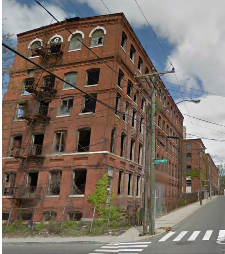
Figure 5. 177 Cherry Street (Buildings K and L, vacant)

205 Cherry Street was used as an office and storage space after Waterbury Clock Company closed (Haley & Aldrich, 2013). It is currently occupied by Ville Swiss Automatics, a CNC, Swiss and Escomatic Screw machine company.