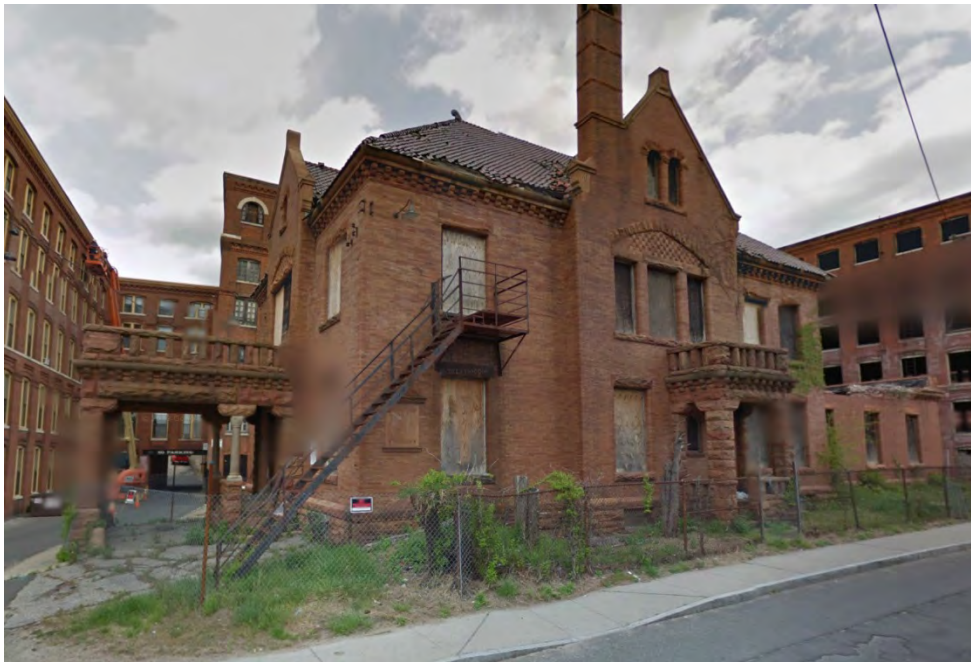
Figure 2. 0 Cherry Avenue (Building #7, vacant)

After the Waterbury Clock Company closed, this building was used as a social club from 1950 to 1956 and then as a bakery from 1959 to 1977. The building has been vacant since 1977 (Haley & Aldrich, 2013).