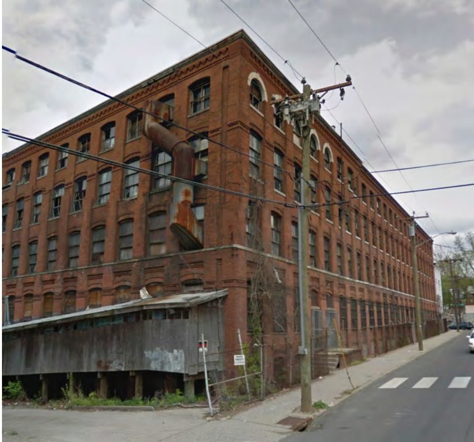
Figure 7. 215 Cherry Street (Buildings R and T, vacant) (Google Earth, 2015)

New Opportunities of Waterbury, Inc., (NOW) owns this former clock factory building. All original windows have been replaced, the outside has been resurfaced, and the interior has been refinished for office use (Haley & Aldrich, 2013). NOW also plans to turn other vacant parts of the clock factory into a hydroponic farm, while another agency hopes to move a plumbing company onto the century-old industrial campus.