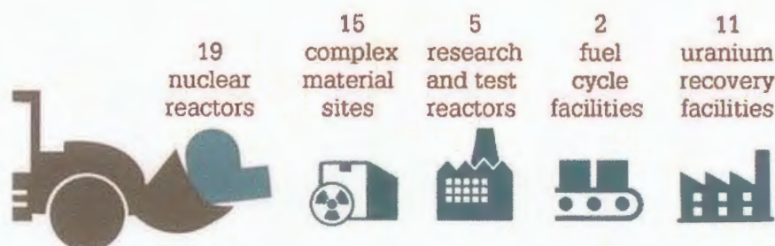
Figure 2: Facilities Undergoing Decommissioning Under NRC Jurisdiction