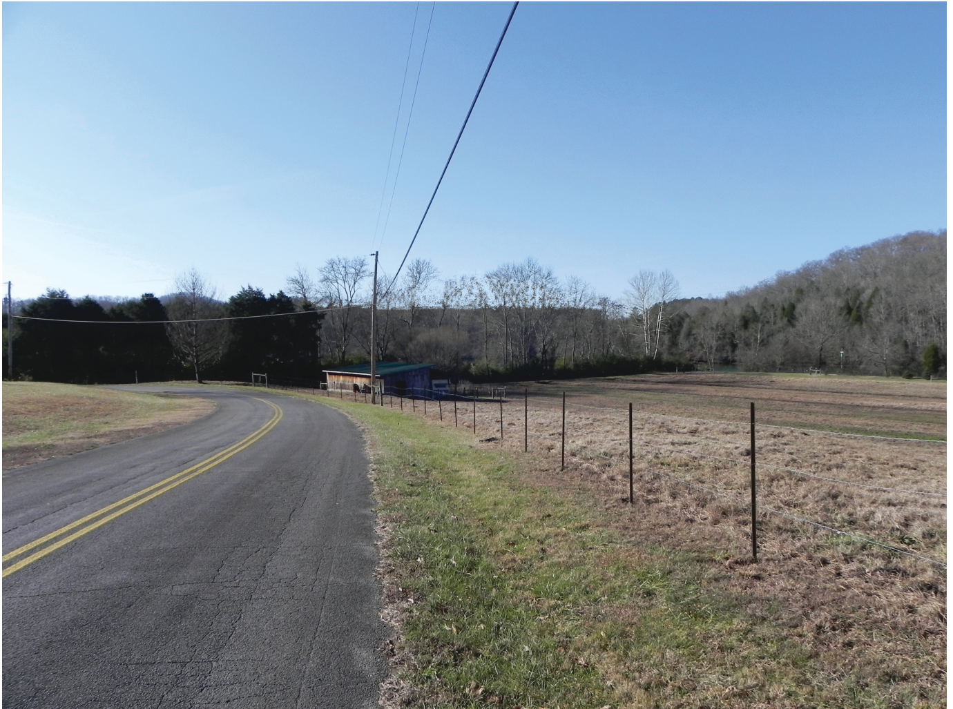
Figure 5.8-2. Baseline View from KOP 5