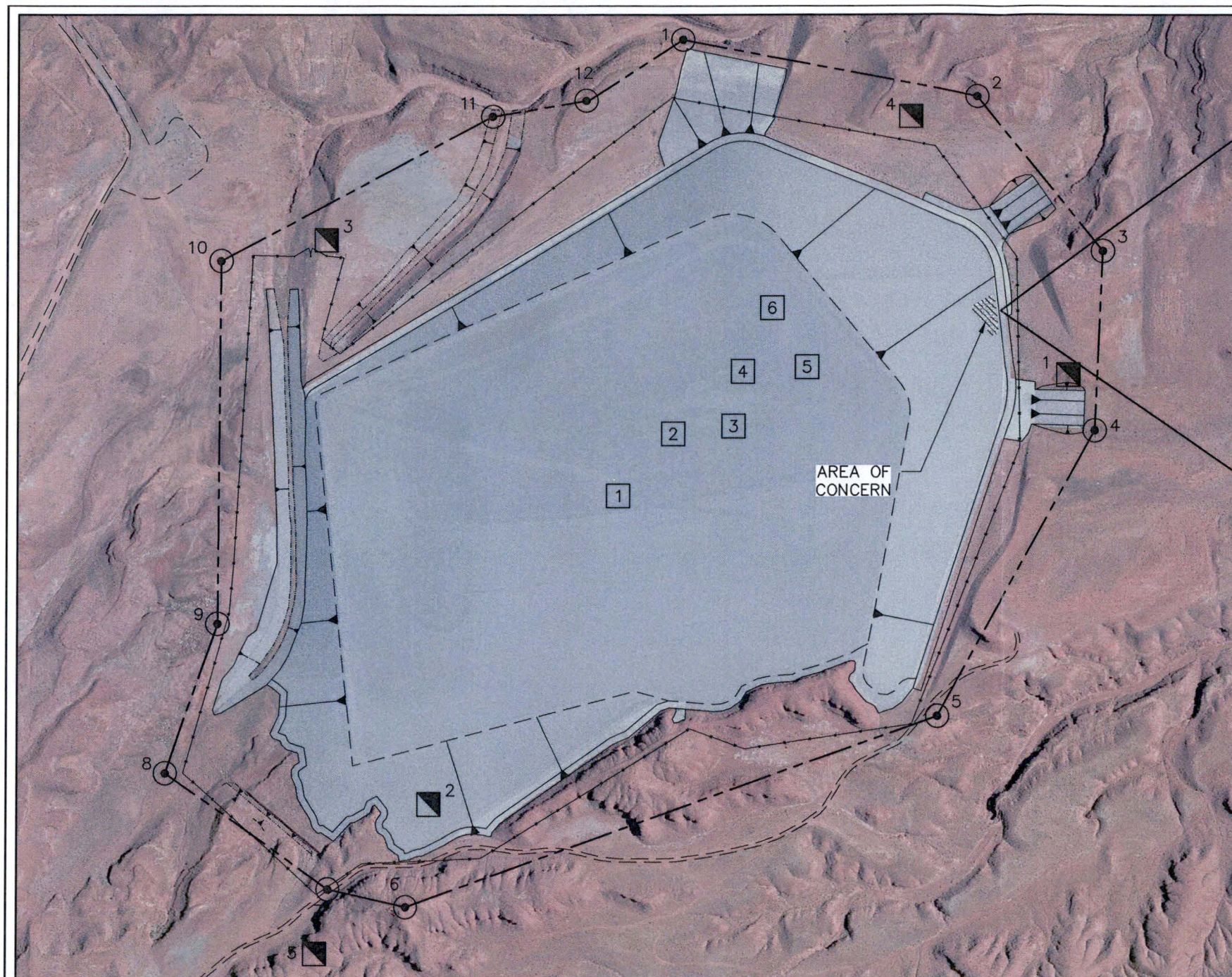
AREA OF CONCERN: MEXICAN HAT, UT, DISPOSAL SITE