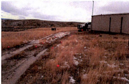
Looking northwest along road. Flags show uR meter locations.