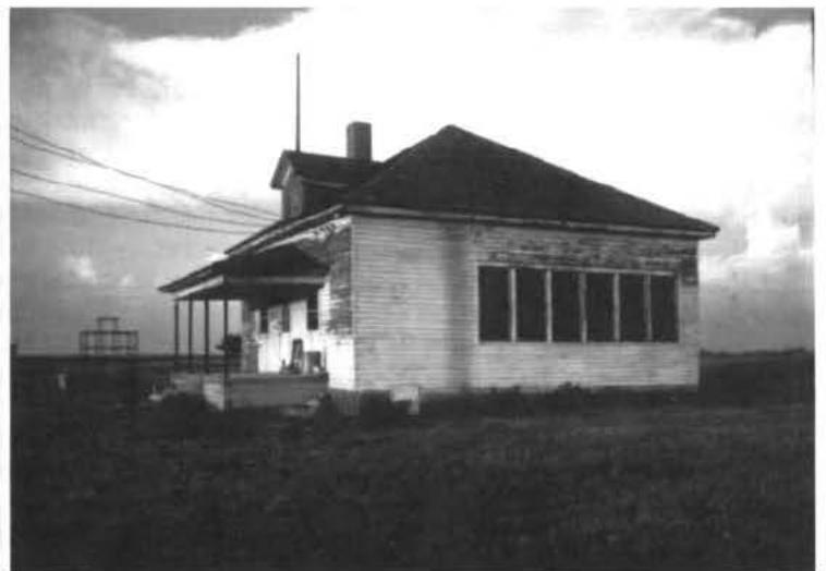
Numerous African Americans left the South to migrate to the Midwest. The A.M.E. Church (on left) and District No. 1 School remain in Nicodemus Historic District in Nicodemus, Kansas, which was declared a National Historic Landmark by the Secretary of the Interior in 1976.