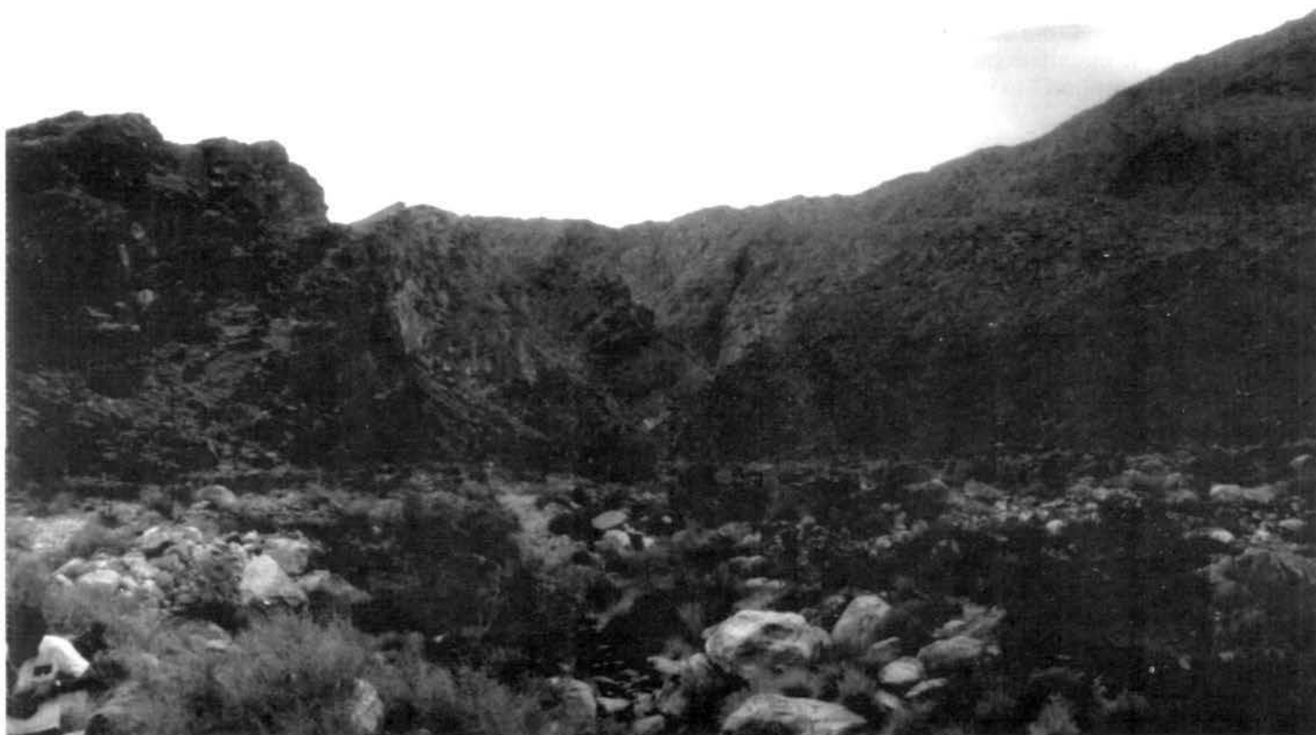
Tahquitz Canyon, in southern California, is included in the National Register because of its association with the traditions of the Cahuilla Indians. The ancestors of the Cahuilla came into this world from a lower one at the beginning of time, and an evil spirit, named Tahquitz, is believed to live in the upper reaches of the canyon.

The fact that a property may have gone unused for a lengthy period of time, with use beginning again only recently, does not make the property ineligible for the Register. For example, assume that the Indian tribe referred to above used the mountain peak in prehistory for communication with the supernatural, but was forced to abandon such use when it was confined to a distant reservation, or when its members were converted to Christianity. Assume further that a revitalization of traditional religion has be-