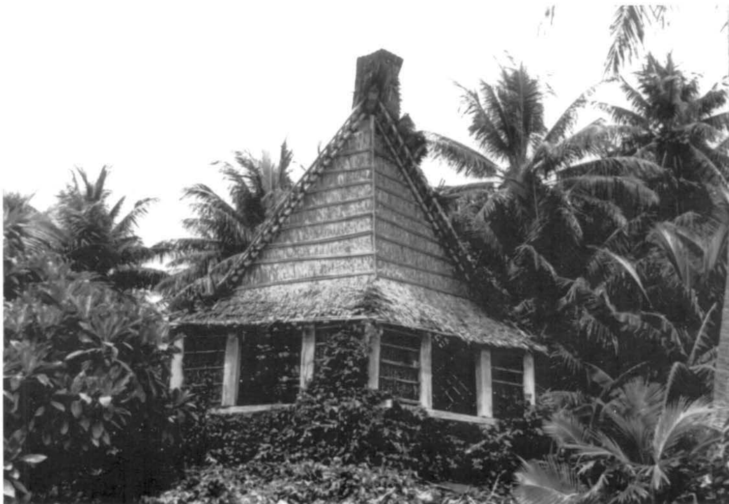
Individual structures can have traditional cultural significance, like this Yapese men's house, used by Yapese today in the conduct of deliberations on matters of cultural importance.

To assist in determining whether a given activity outside the boundaries of a traditional cultural property may constitute an adverse effect, it is vital that the nomination form or eligibility documentation discuss those qualities of a property's visual, auditory, and atmospheric setting that contribute to its significance, including those qualities whose expression extends beyond the boundaries of the property as such into the surrounding environment.