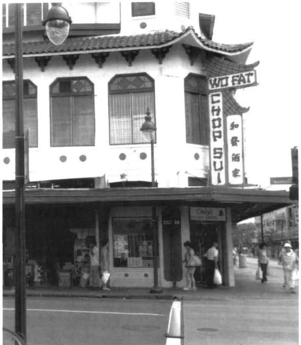
Honolulu's Chinatown reflects the cultural values and traditions of its inhabitants not only in its architectural details but also in its organization of space and the activities that go on there.

Any comprehensive effort to identify historic properties in an area, be the area a community, a rural area, or the area that may be affected by a construction or land-use project, should include a reasonable effort to identify traditional cultural properties. What constitutes a "reasonable" effort depends in part on the likelihood that such properties may be present. The likelihood that such properties may be present can be reliably assessed only on the basis of background knowledge of the area's history, ethnography, and contemporary society developed through preservation planning. As a general although not in-