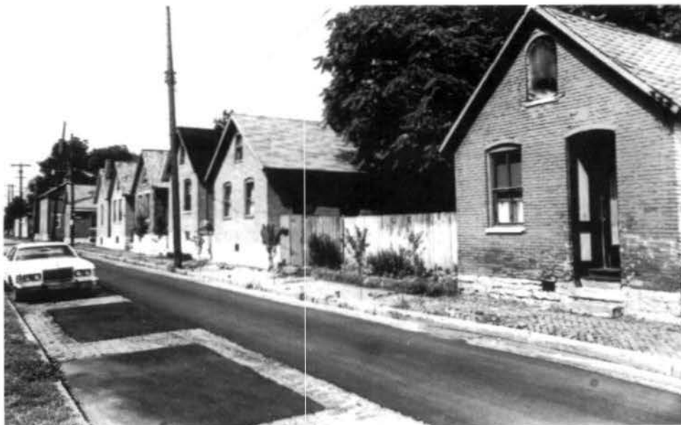
The German Village Historic District in Columbus, Ohio, reflects the ethnic heritage of 19th century German immigrants. The neighborhood includes many simple vernacular brick cottages with gable roofs. (Christopher Cline)

preserving and conserving the intangible elements of our cultural heritage such as arts, skills, folklife, and folkways. . .