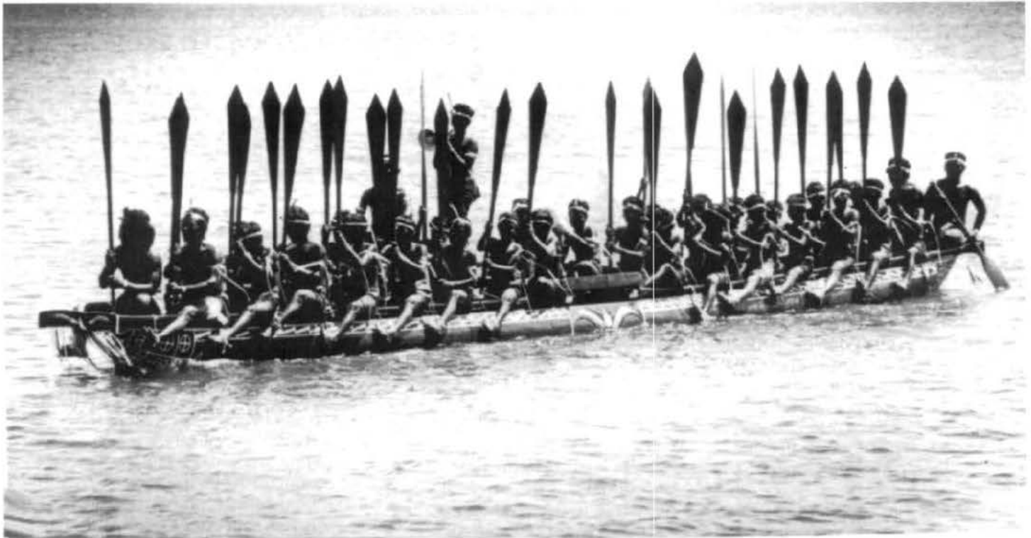
Some traditional cultural properties may be moveable, like this traditional war canoe still in use in the Republic of Palau.

destroy its significance, provided it remains "located in a historically appropriate setting." 16 For example, a traditionally important canoe or other watercraft would continue to be eligible as long as it remained in the water or in an appropriate dry land context (e.g., a boathouse). A property may also retain its significance if it has been moved historically. 17 For example, totem poles moved from one Northwest Coast village to another in early times by those who made or used them would not have lost their significance by virtue of the move. In some cases, actual or putative relocation even contributes to the significance of a property. The topmost peak of Mt. Tonaachaw in Truk, for example, is traditionally thought to have been brought from another island; the stories surrounding this magical relocation are parts of the mountains cultural significance.