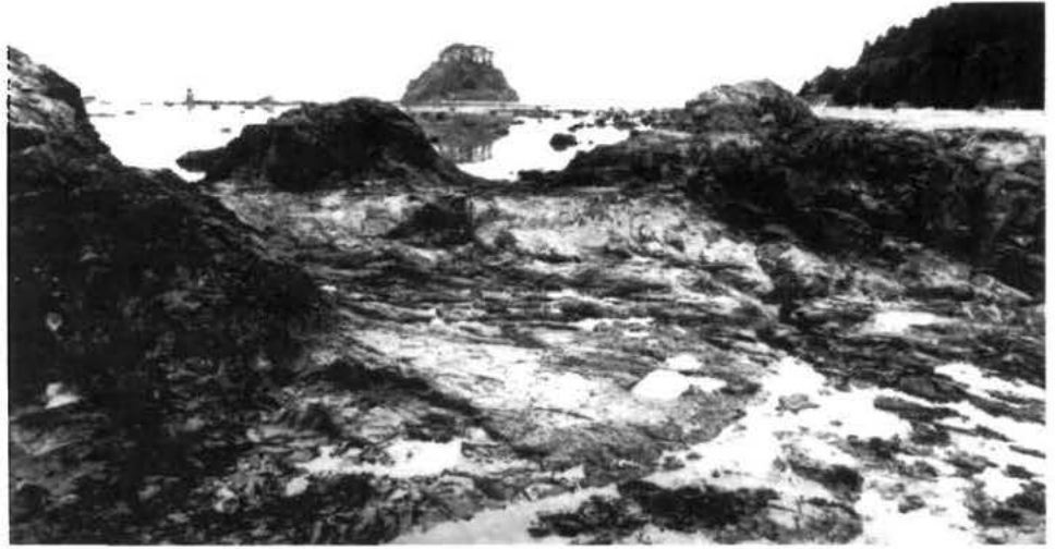
Cannonball Island, off Cape Alava on the coast of Washington State, is a traditional cultural property of importance to the Makah Indian people. It was used in the past, and is still used today, as a navigation marker for Makah fisherman, who established locations at sea by triangulation from this and other landmarks. It also was a lookout point for seal and whale hunters and for war parties, a burial site, and a kennel for dogs raised for their fur.

Some kinds of traditional cultural significance also may be retained regardless of how the surroundings of a