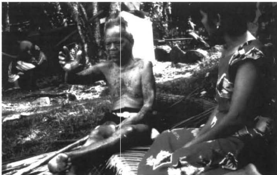
Much of the significance of traditional cultural properties can be learned only from testimony of the traditional people who value them, like this old man being interviewed in Truk.

Sometimes an apparent conflict exists between documentary data on traditional cultural properties and the testimony of contemporary consultants. The most common kind of conflict occurs when ethnographic and ethnohistorical documents do not identify a given place as playing an important role in the tradition and culture of a group, while contemporary members of the group say the property does have such a role. More rarely, documentary sources may indicate that a property does have cultural significance while contemporary sources say it does not. In some cases, too, contemporary sources may disagree about the significance of a property.