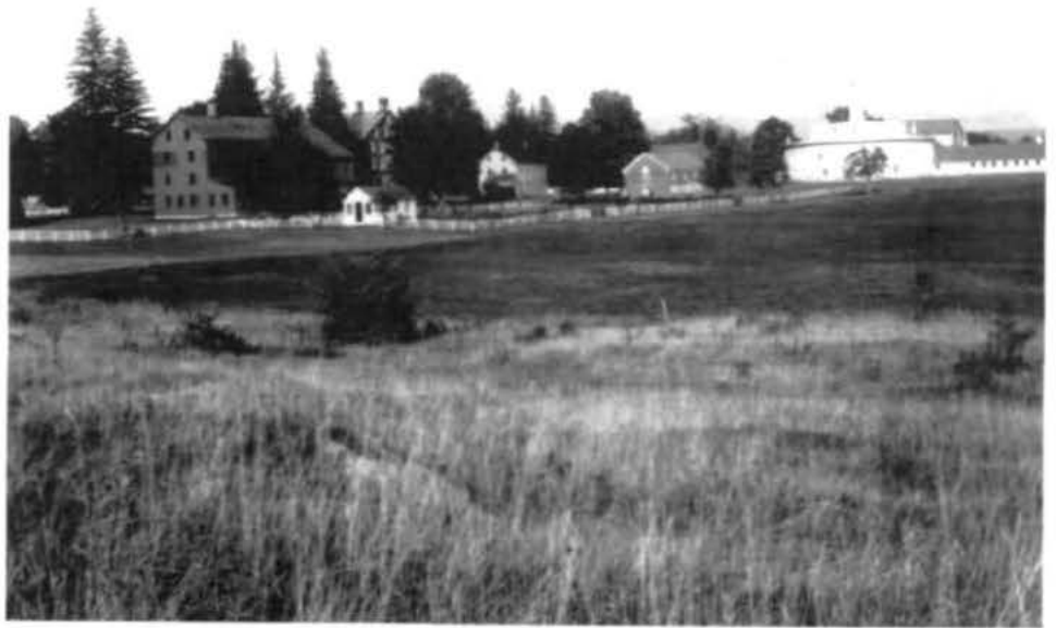
The fact that a property has religious connotations does not automatically disqualify it for inclusion in the National Register. This Shaker community in Massachusetts, for example, while religious in orientation, is included in the Register because it expresses the cultural values of the Shakers as a society.