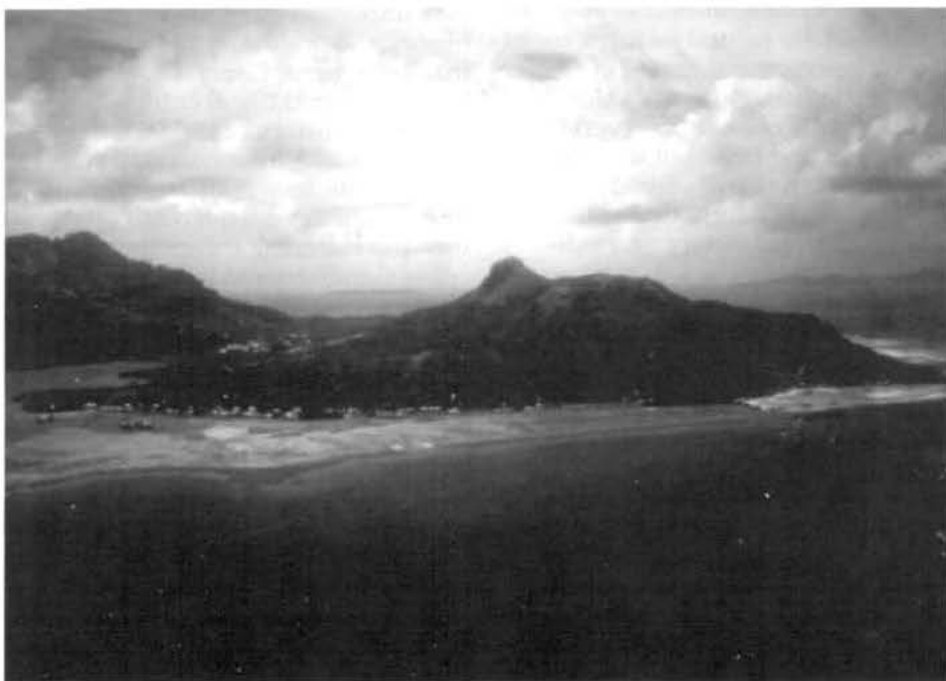
In Trukese tradition, the Tonaachaw Historic District was the location to which Sowukachaw, founder of the Trukese society, came and established his meetinghouse at the beginning of Trukese history. The mountain, in what is now the Federated States of Micronesia, is a powerful landmark in the traditions of the area. (Lawrence E. Aten)

A property made up of or containing art work valued by a group for traditional cultural reasons, for example a petroglyph or pictograph site venerated by an Indian group, or a building whose decorative elements reflect a local ethnic groups distinctive modes of expression, may be viewed as having high artistic value from the standpoint of the group.