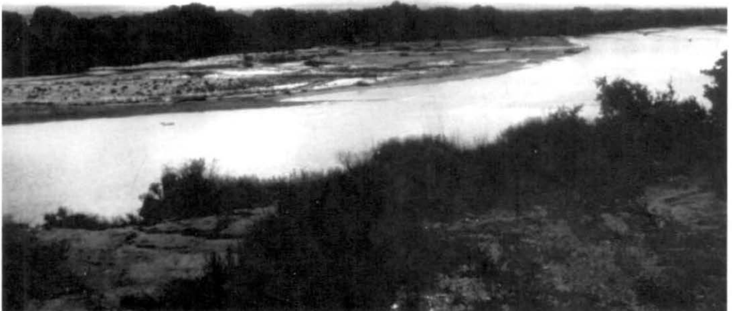
These sandbars in the Rio Grande River are eligible for inclusion in the National Register because they have been used for generations by the people of Sandia Pueblo for rituals involving immersion in the river's waters. (Thomas F. King)