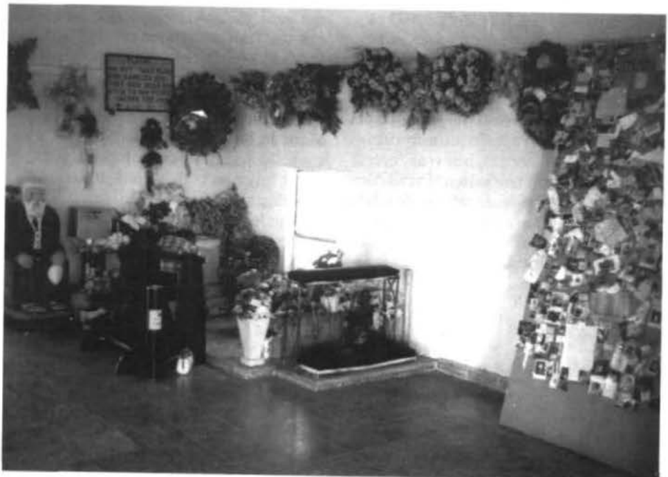
Several hundred persons visit this shrine to Don Pedrito Jaramillo, curandero (faith healer), yearly to seek his healing spirit.