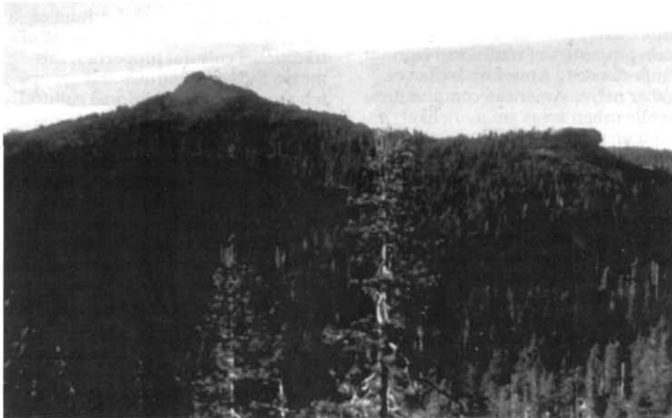
The Helkau Historic District, in the Six Rivers National Forest of California, is eligible for inclusion in the National Register because of its association with significant cultural practices of the Tolowa, Yorok, Karuk, and Hoopa Indian tribes of the area, who have used the district for generations to make medicine and communicate with spirits. (Theodoratus Cultural Research)

Fieldwork to identify properties of traditional cultural significance involves consultation with knowledge-