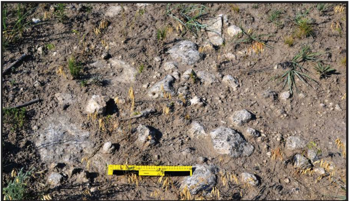
Figure 4.8 Tribal Site No. 5, looking southeast. Top: View of rock outcropping in an erosion feature. Bottom: Close-up of the sandstone cobble feature.