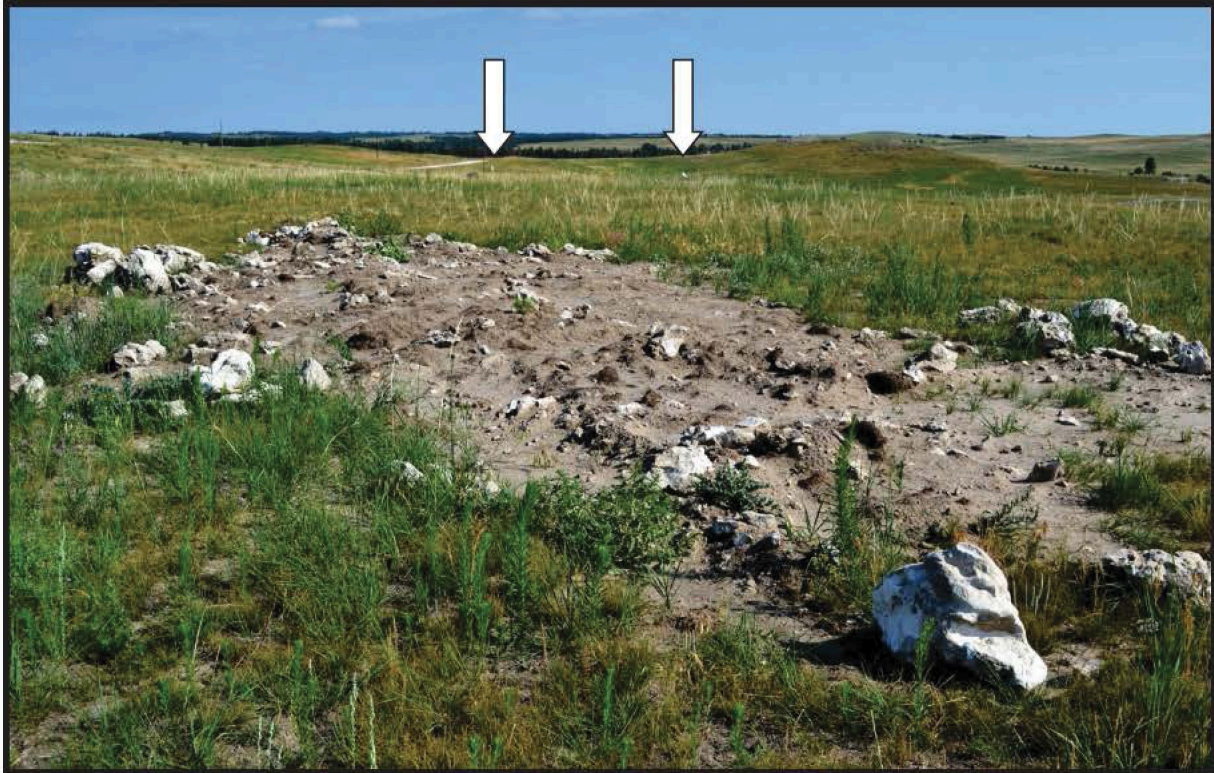
Figure 4.7 A recently filled-in mud pit awaiting final reclamation and revegetation is found about 40 m south of the two locales designated as Tribal Sites Nos. 4 and 5 (photograph looking north). The white pin flags denoting Tribal Site No. 4 (left arrow) and Tribal Site No. 5 (right arrow) are faintly seen in the distance.