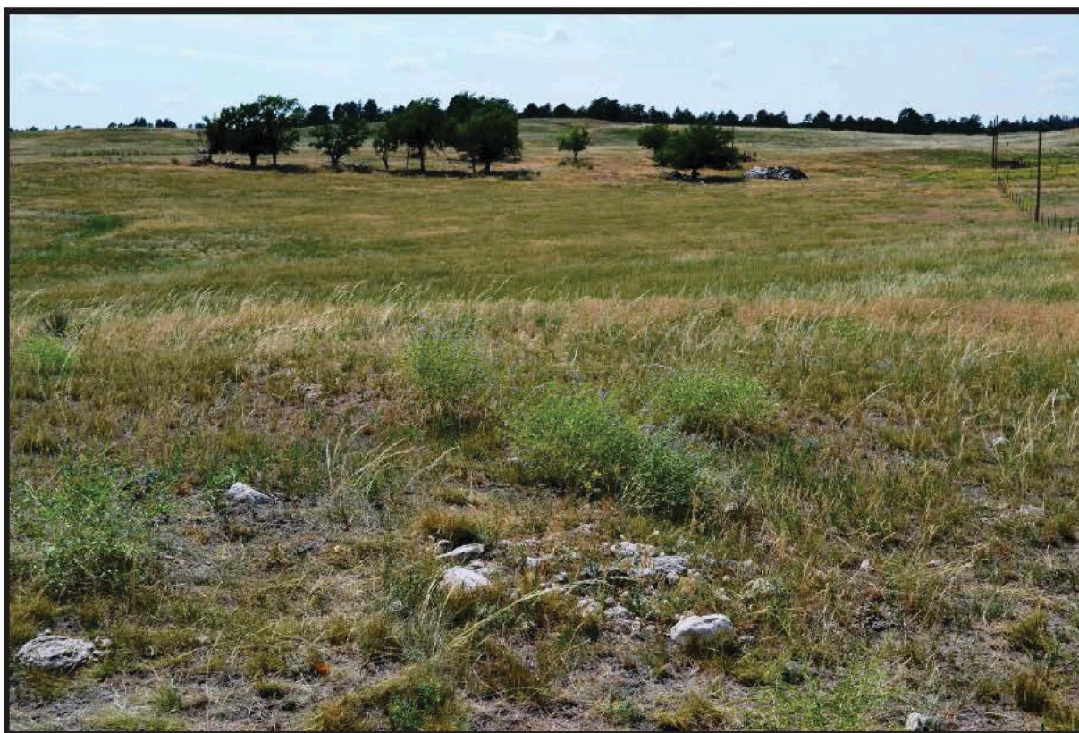
Figure 4.2 Tribal Site No. 2, looking west with the cluster of Arikaree sandstone cobbles in the foreground, and the trees and ruins marking the historic Euro-American homestead ( ) in the upper center of the photograph. The distance between the cobble feature and the homestead proper is about 220 m. The fence line seen at the upper right corner of the view marks the northern boundary of this homestead.