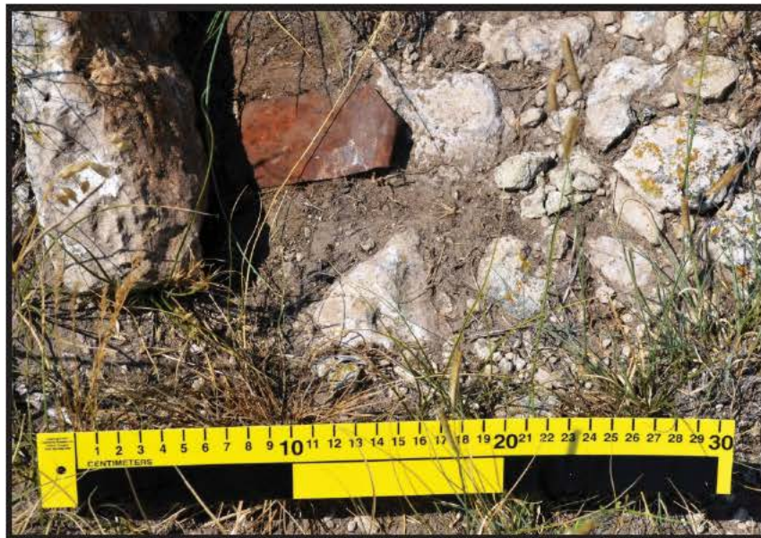
Figure 4.3 Close-up views of the cobble feature comprising Tribal Site No. 2, both photographs looking north.

Top: The compact nature of the feature is evident in this view. A metal stake is visible protruding to the right from the large cobble just above the left end of the scale.