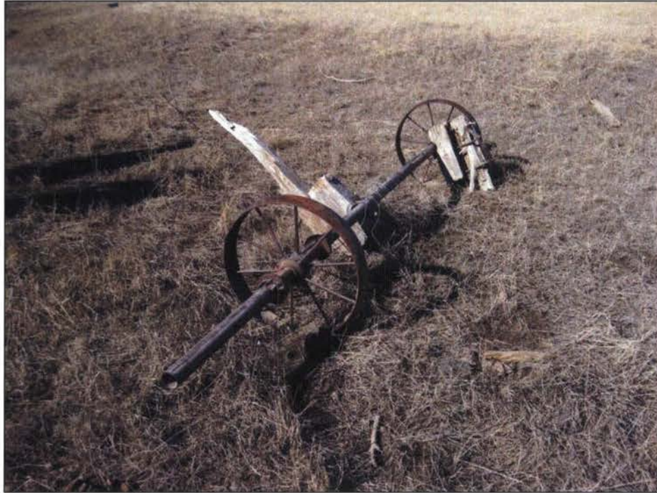
Figure 166. 2368-I023 Farm implement, facing northeast.