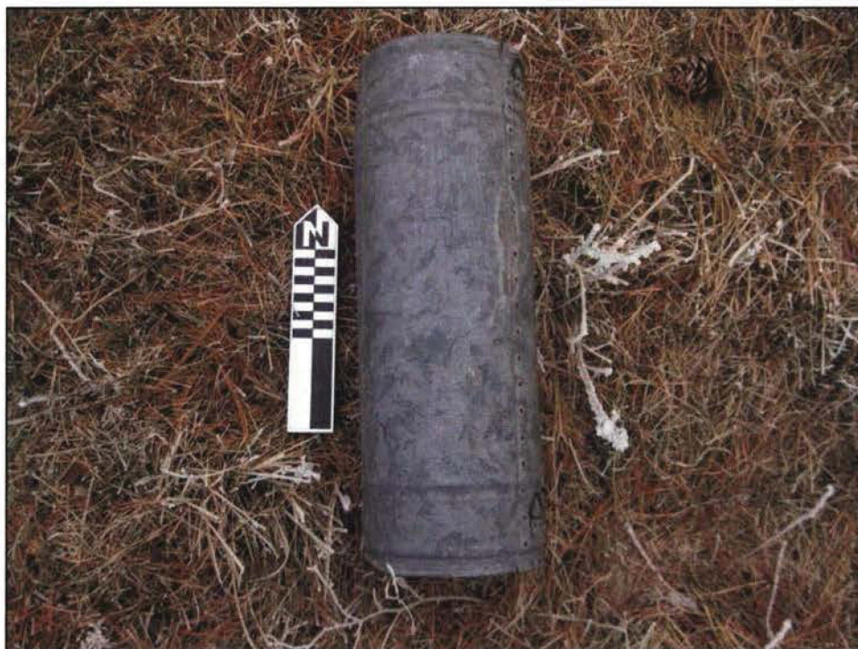
Figure 160. 2368-I007, metal canister.