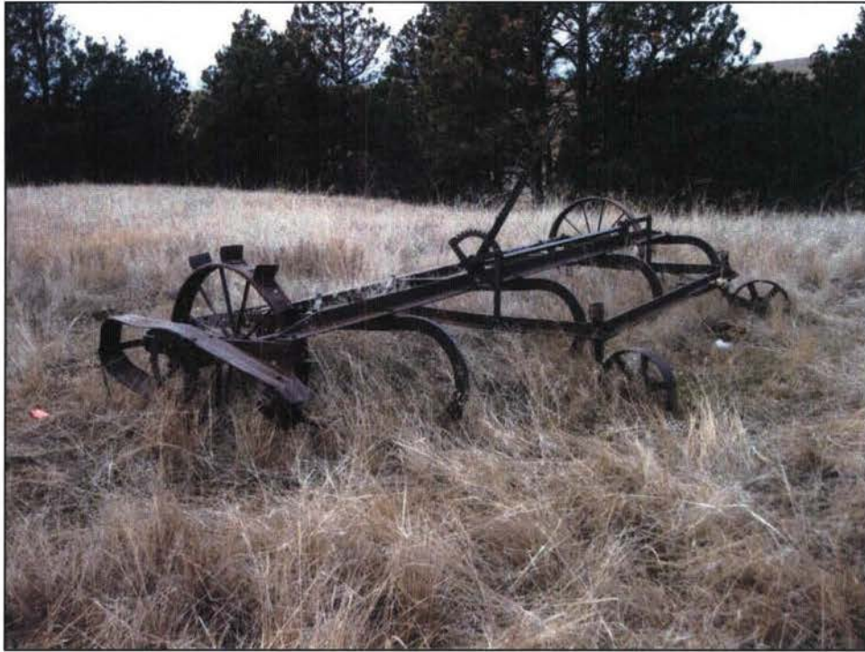
Figure 162. 2368-I013, IHC rod weeder, facing south.