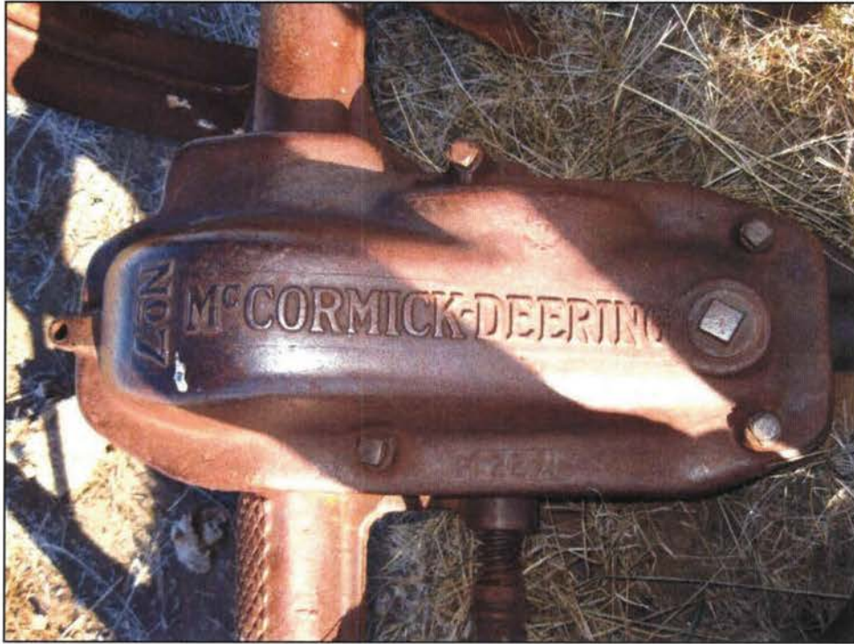
Figure 165. 2368-I019, "McCormick-Deering No. 7" manufacturer's mark.