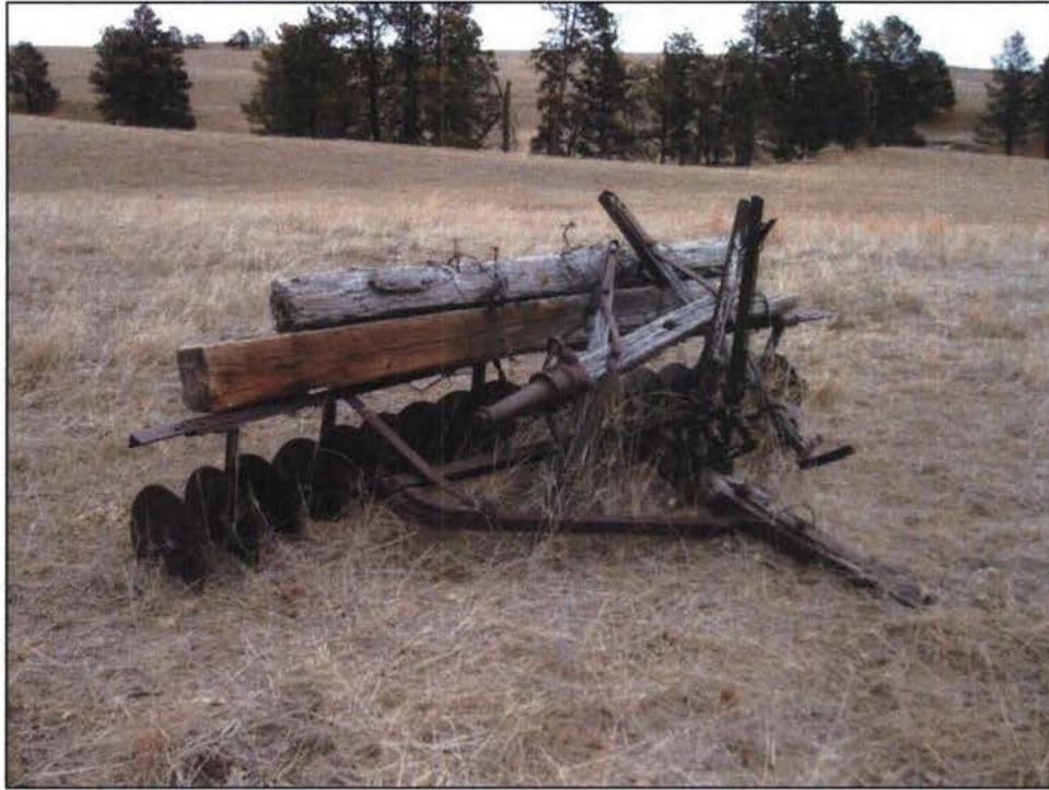
Figure 161. 2368-I011, International Harvester disc harrow, facing east.