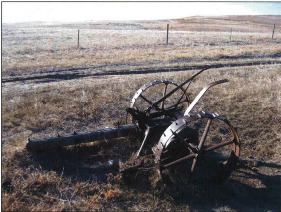
Figure 164. 2368-I019, mower, facing west.