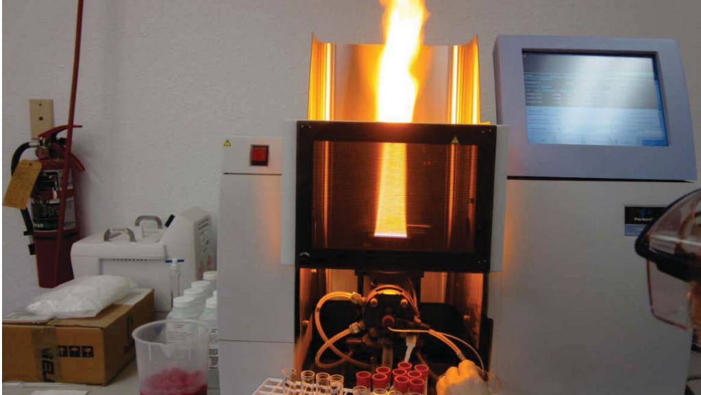
Figure 28. Atomic adsorption equipment. (Photo: DB, October 24, 2012)