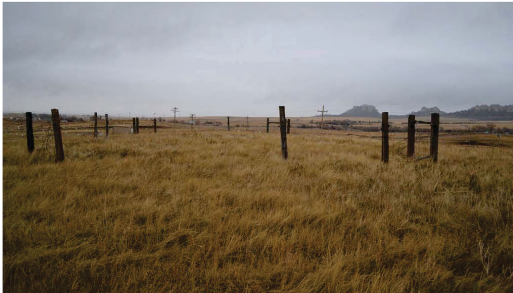
Figure 29. CBR current license area, fenced archaeological site 25DW192. View to the north-northeast with the Crow Butte visible in the distance (leftmost butte). Archaeological site 25DW191, also fenced for protection, is located just downslope and out of sight at the right center of the image. (Photo: PRN, October 24, 2012)

The team visited archaeological sites 25DW191 and 192, both situated in the southern portion of the project area. These sites, along with two others, were fenced during early phases of the mining development to designate them as protected areas ( Figure 29 ).