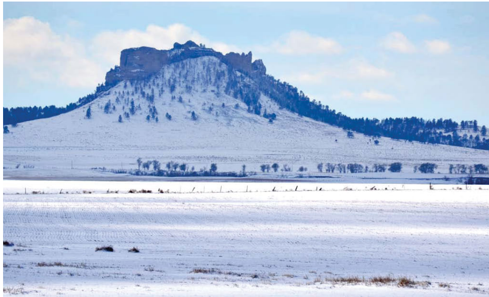
Figure 31. Crow Butte, Crawford, Nebraska, from the looking southwest, following a snowstorm on the preceding day. The CBR CPF lies on the opposite site of the butte. The prominent geological feature is readily visible from the CPF and from the proposed the NTEA and TCEA project areas. It cannot be seen from the MEA because of the Pine Ridge elevation. (Photo: PRN, October 24, 2012)

the Brulé to send a party after the Crow to recover his horses, leading to the “Battle of Crow Butte.” Dr. Nickens had previously obtained a copy of the Crow Butte monograph.