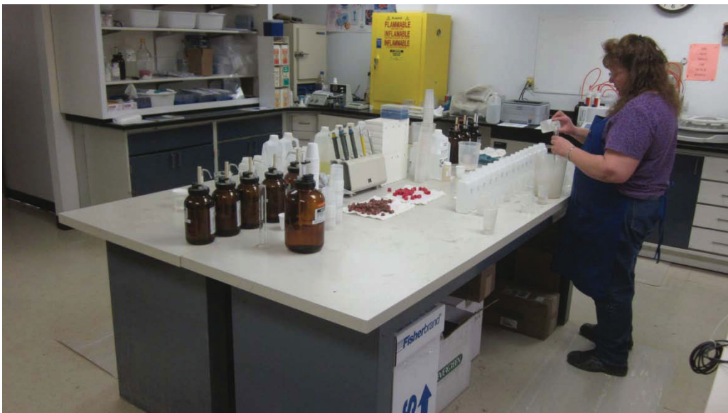
Figure 27. Water quality laboratory. (Photo: DB, October 24, 2012)

Adjacent to the processing area is a water quality laboratory where samples are analyzed ( Figure 27 ). The laboratory currently uses atomic adsorption for metals analysis ( Figure 28 ), but it recently purchased an induced coupled plasma machine that will replace atomic adsorption.