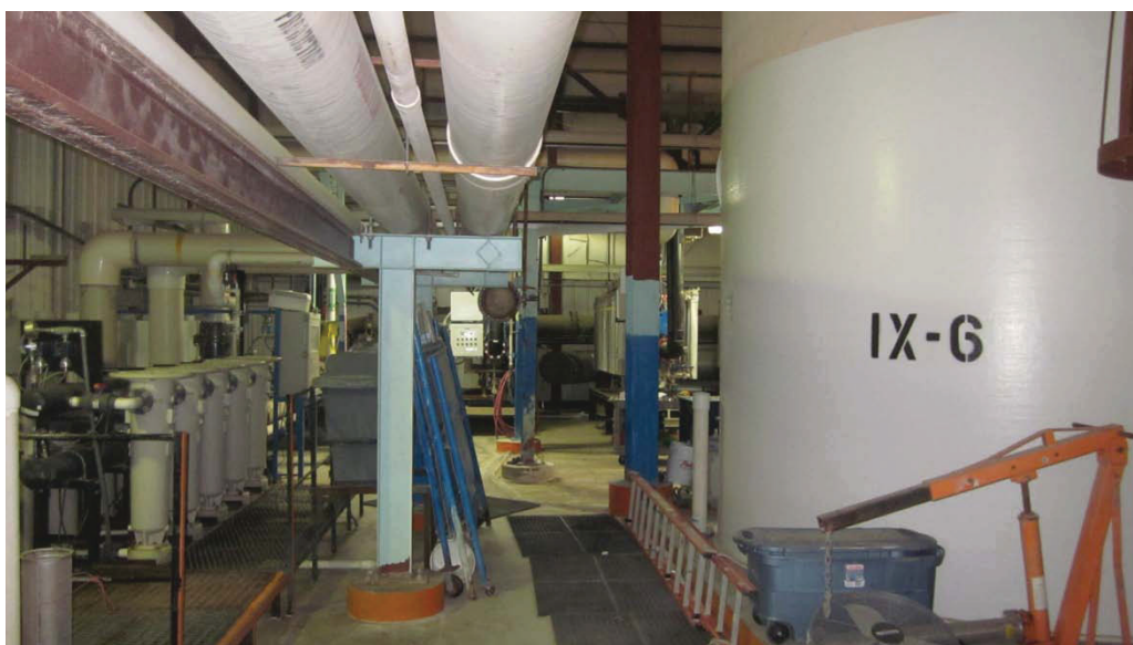
Figure 25. IX column located in the main processing building on the CPF. (Photo: DB, October 24, 2012)

All of the uranium-saturated ground water is pumped back to the main process facility, where the leach solution enters the pressurized downflow IX column and passes through the resin beds ( Figure 25 ). After the processed uranium is dried, it is placed in 55-gallon drums to await shipment ( Figure 26 ).