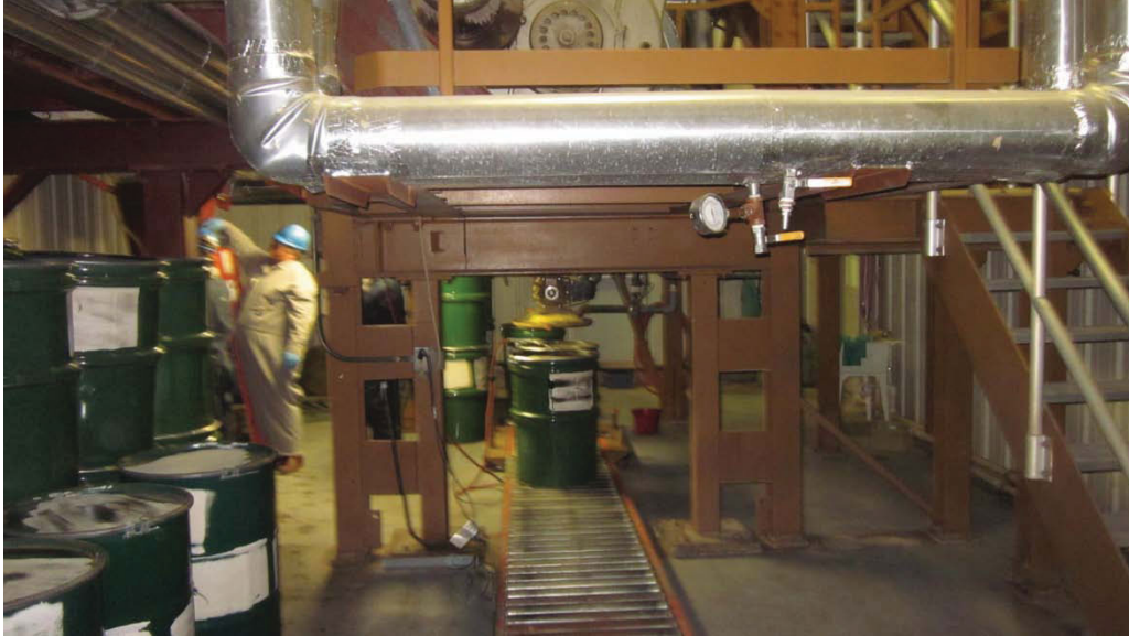
Figure 26. Drums of processed uranium. (Photo: DB, October 24, 2012)

Adjacent to the processing area is a water quality laboratory where samples are analyzed ( Figure 27 ). The laboratory currently uses atomic adsorption for metals analysis ( Figure 28 ), but it recently purchased an induced coupled plasma machine that will replace atomic adsorption.