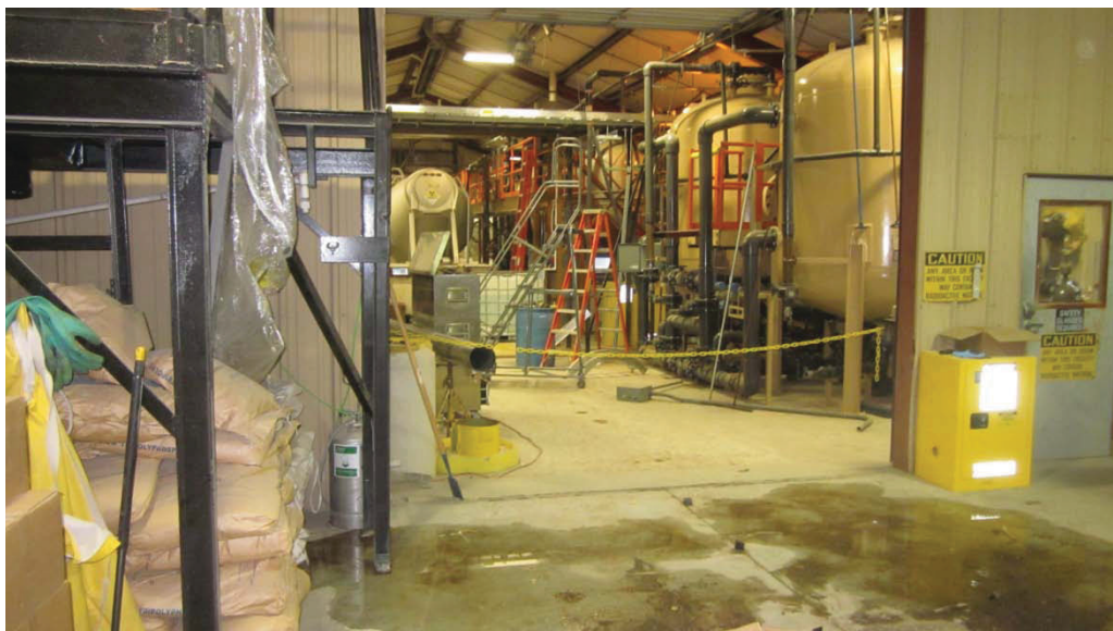
Figure 24. RO unit located in an auxiliary building on the CPF. (Photo: DB, October 24, 2012)

All of the uranium-saturated ground water is pumped back to the main process facility, where the leach solution enters the pressurized downflow IX column and passes through the resin beds ( Figure 25 ). After the processed uranium is dried, it is placed in 55-gallon drums to await shipment ( Figure 26 ).