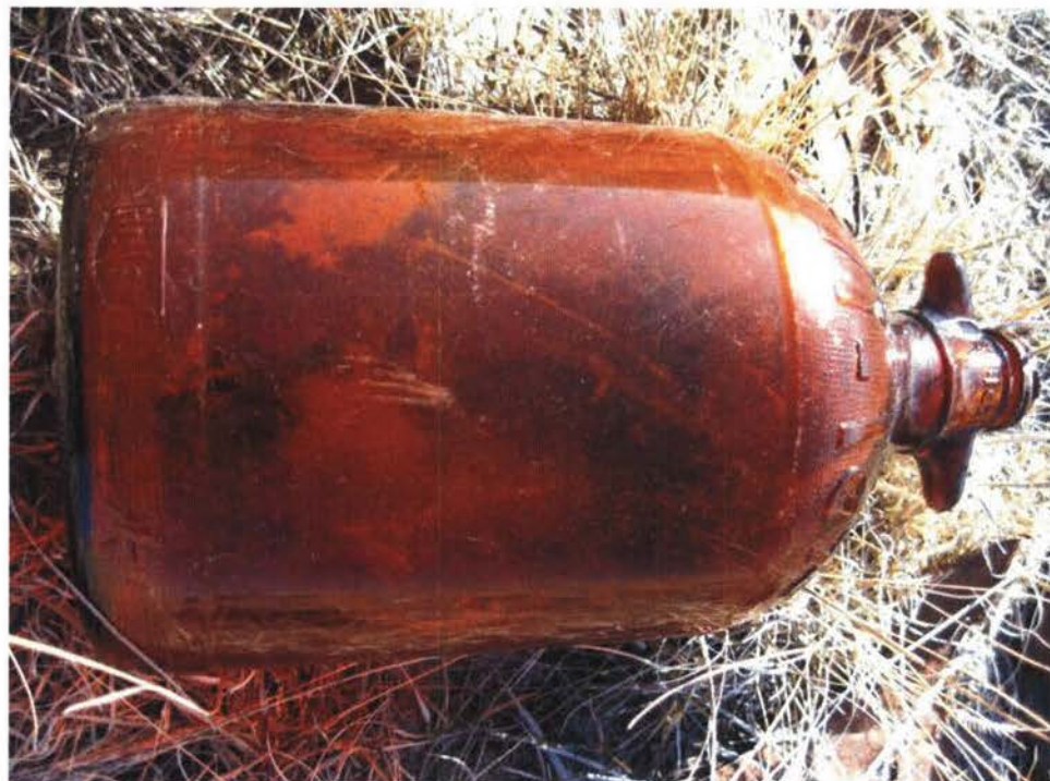
Figure 108. 25DW369, embossed Hi-Lex bleach bottle.