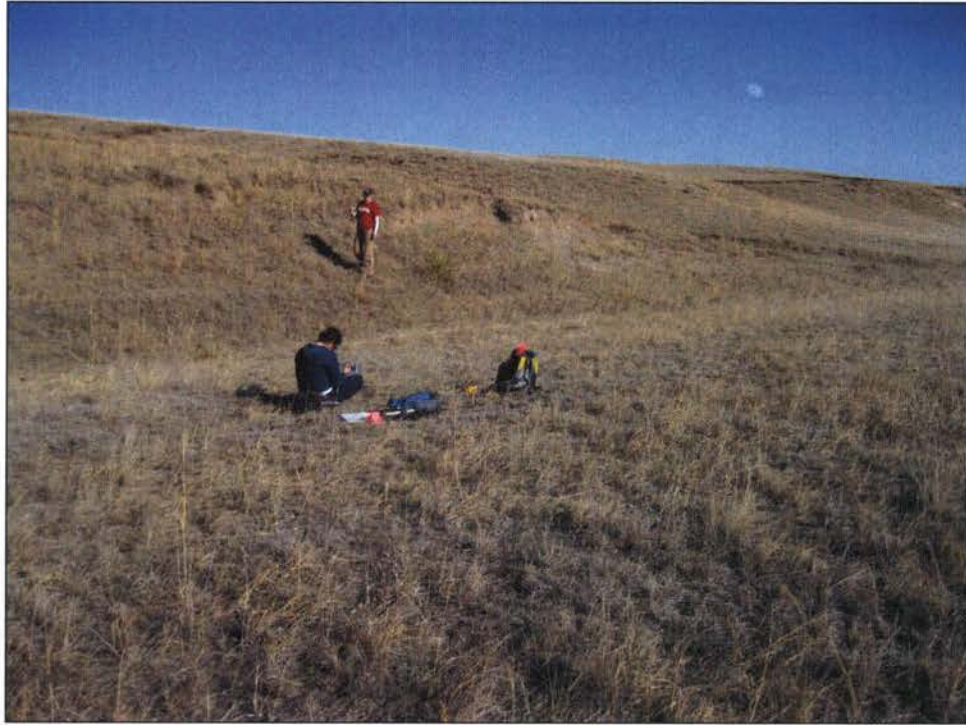
Figure 105. 25DW369, drainage overview, facing east. Photograph taken by Ashley Howder on 2/16/11.