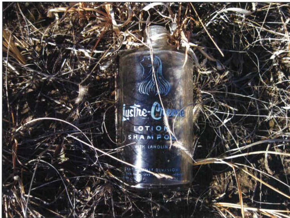
Figure 107. 25DW369, Lustre-Crème shampoo bottle.