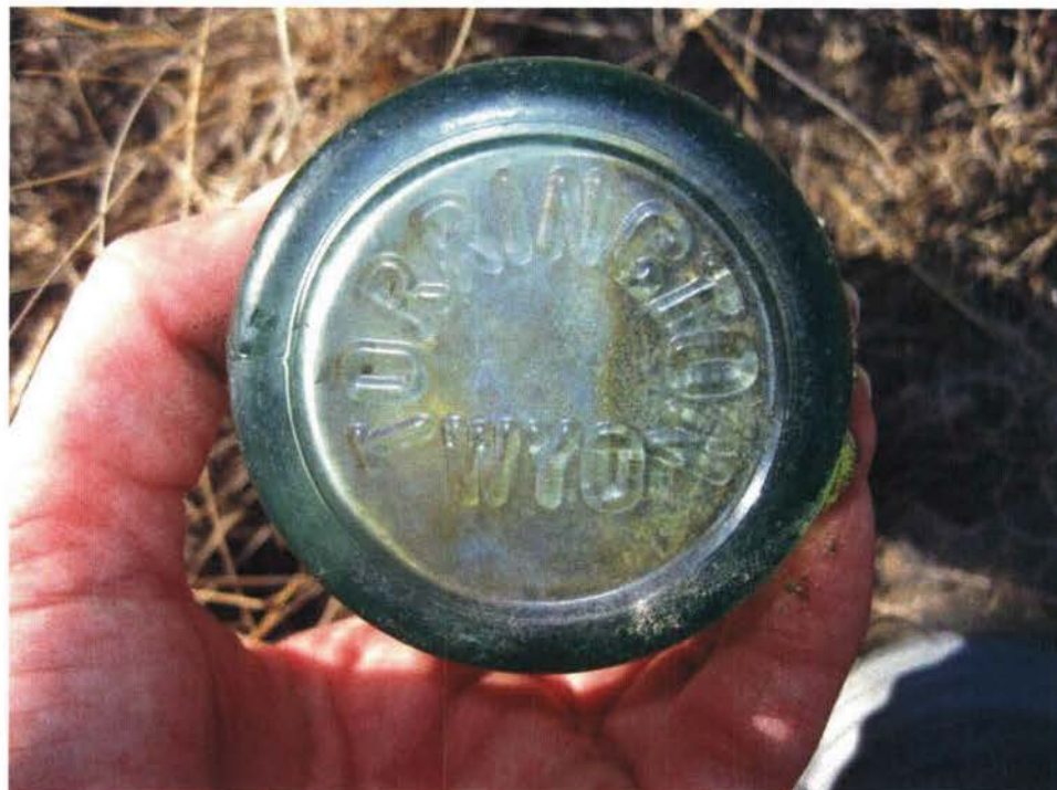
Figure 110. 25DW369, hobbleskirt Coca-Cola embossed green bottle fragment.