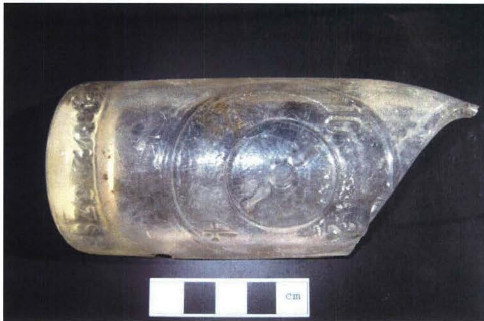
Figure 106. 25DW369, embossed Dr. Pepper bottle fragment. Photograph taken by Ashley Howder on 2/16/11.