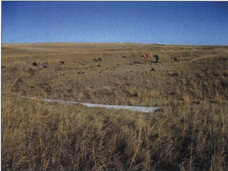
Figure 104. 25DW369, site overview, facing east. Photograph taken by Ashley Howder on 2/16/11.

the National Register of Historic Places (NRHP) database for Dawes County, Nebraska; review of the National Historic Landmark inventory (NHL); review of General Land Office (GLO) Plats; and local literature review; that revealed sustained Euro-American historic occupation in this area occurred between 1890 to present day, and no leases or purchasers were found that can be associated with an important person or persons of "significance in history" or having an uncommon ethnic affiliation. Finally, there are no features associated with site 25DW359. Therefore, site 25DW359 does not possess enough significance to qualify for the National Register. Site 25DW359 is a common historic site likely associated with modern habitation activities in the region that ARCADIS recommends not eligible for listing on the NRHP and no further work is necessary.