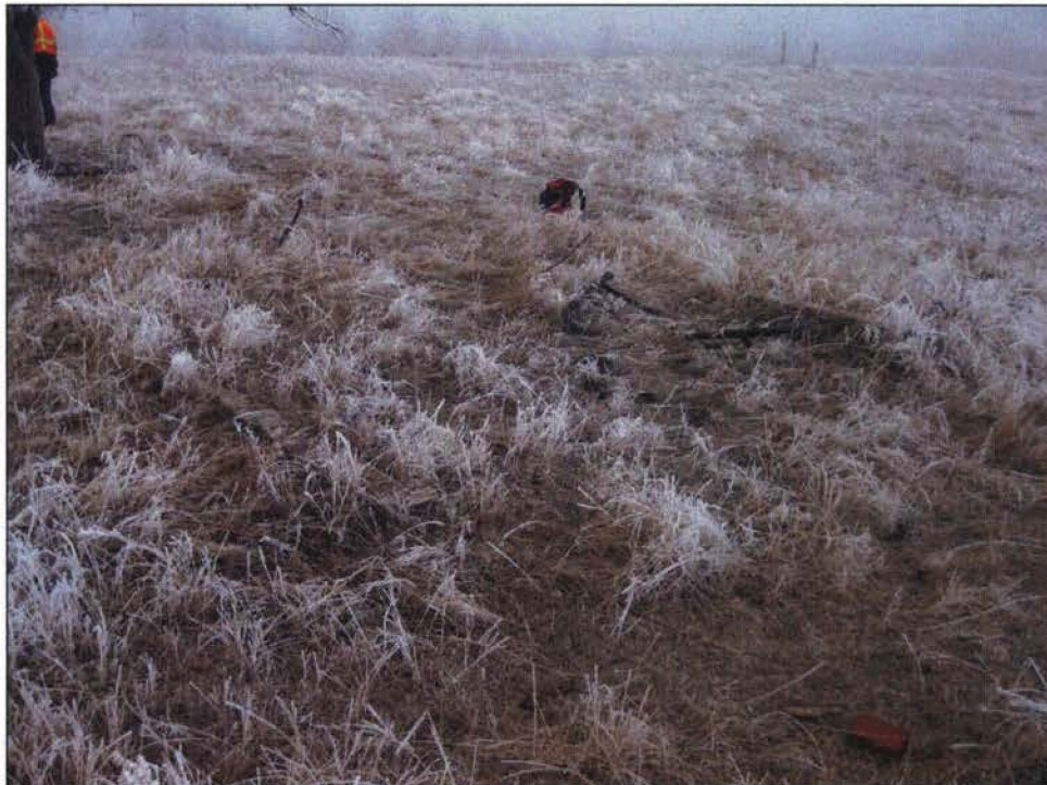
Figure 64. 25DW361 Feature F9, small foundation, facing east. Photograph taken by Shane Rosenthal, on 11/20/2010.