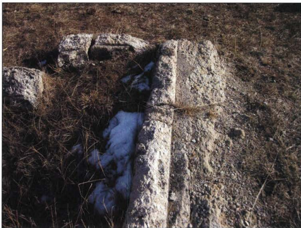
Figure 75. 25DW364 Feature F1, southeast corner of cistern support walls, facing east. Photograph taken by Russ Collett, on 12/02/2010.