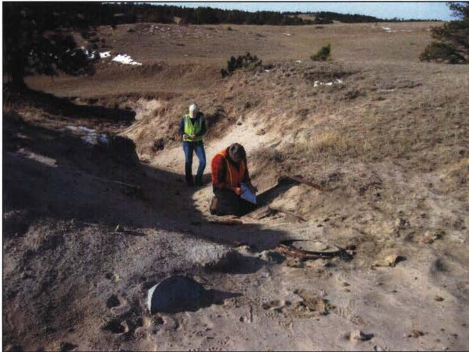
Figure 71. 25DW363, overview, facing west.

with historic and early modern ranching or farming activities in the region that ARCADIS recommends not eligible for listing on the NRHP and no further work is necessary.