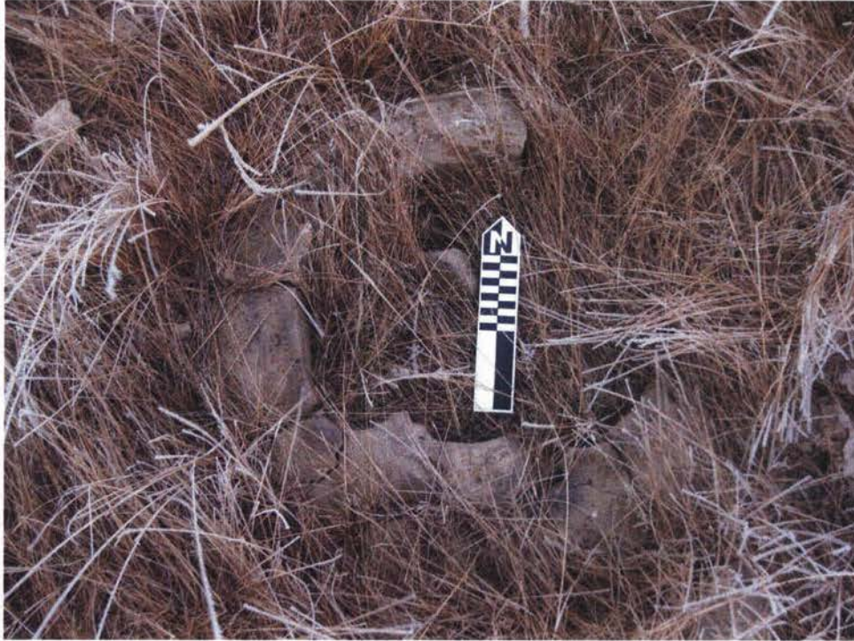
Figure 65. 25DW361 Feature F10, cement circle, facing north. on 11/20/2010.