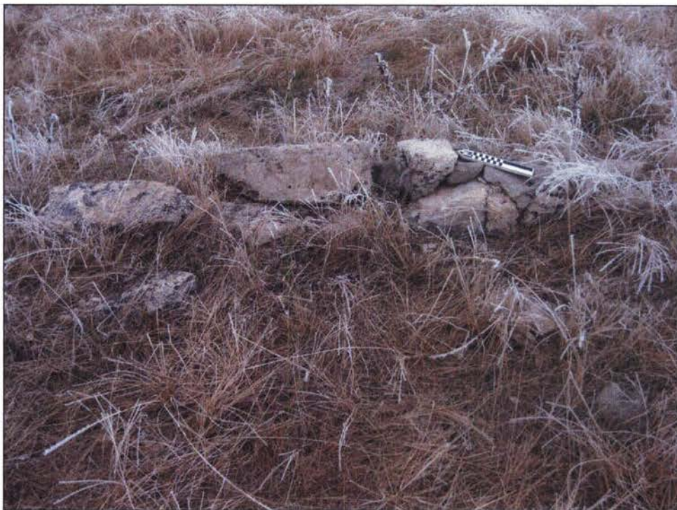
Figure 66. 25DW361 Feature F10, west wall, facing west. Photograph taken by Shane Rosenthal, on 11/20/2010.