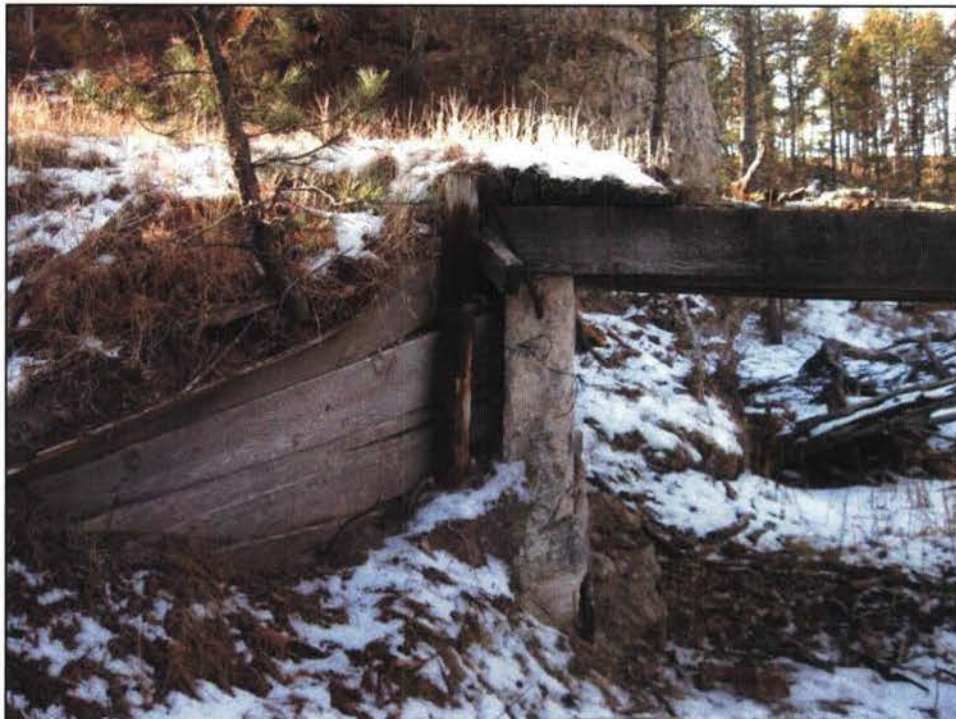
Figure 69. 25DW362, abutment construction, facing south.