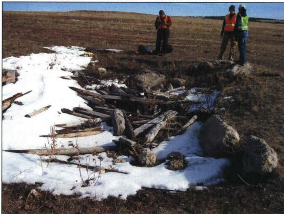
Figure 74. 25DW364 Feature F1, cistern, facing east. Photograph taken by Russ Collett, on 12/02/2010.