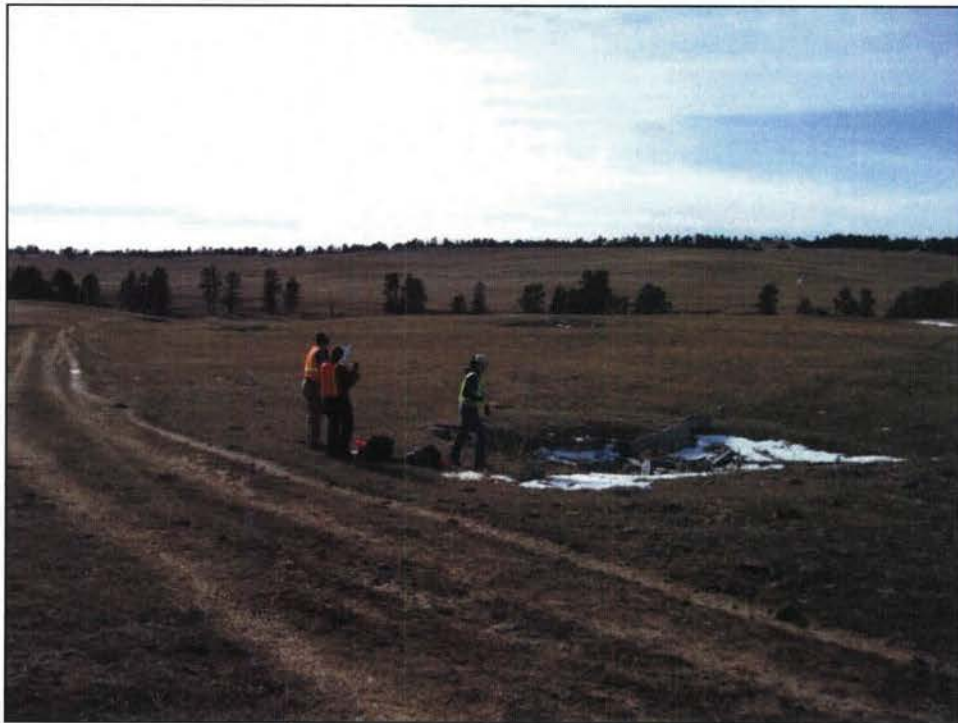
Figure 73. 25DW364, overview, facing southwest. Photograph taken by Russ Collett, on 12/02/2010.