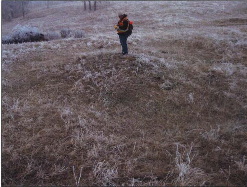
Figure 63. 25DW361 Feature F8, dirt mound, facing west. Photograph taken by Shane Rosenthal, on 11/20/2010.