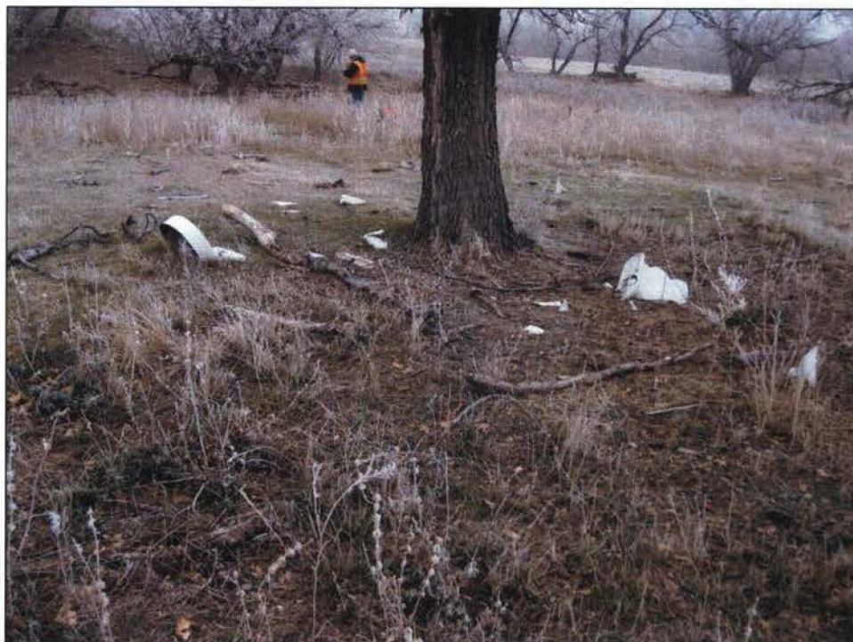
Figure 32. 25DW360, Debris scatter at south end of sidewalk. Photograph taken by Shane Rosenthal, on 11/20/2010.