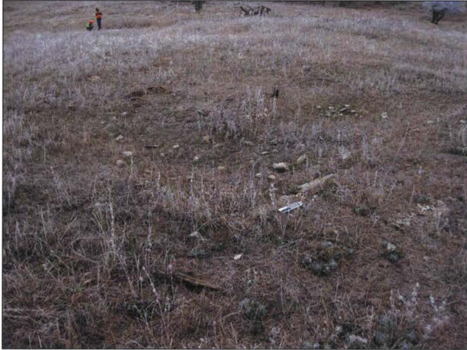
Figure 43. 25DW360 Feature F8, foundation, facing northwest. Photograph taken by Shane Rosenthal, on 11/20/2010.