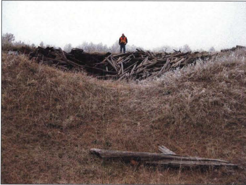
Figure 41. 25DW360 Feature F7, dugout, facing north. Photograph taken by Shane Rosenthal, on 11/20/2010.