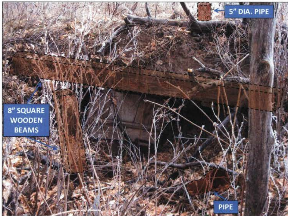
Figure 34. 25DW360 Feature F2, root cellar, facing south.