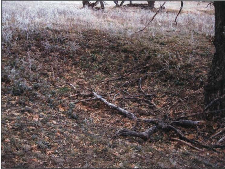
Figure 35. 25DW360 Feature F3, dugout, facing east. Photograph taken by Shane Rosenthal, on 11/20/2010.