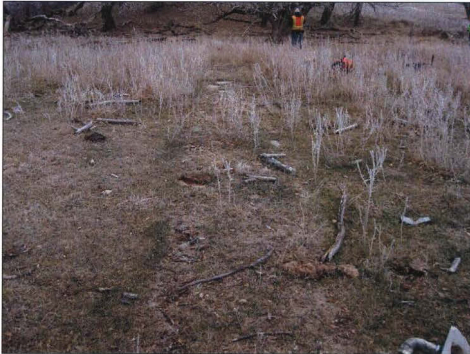
Figure 31. 25DW360, sidewalk from Feature F1, facing west. Photograph taken by Shane Rosenthal, on 11/20/2010.