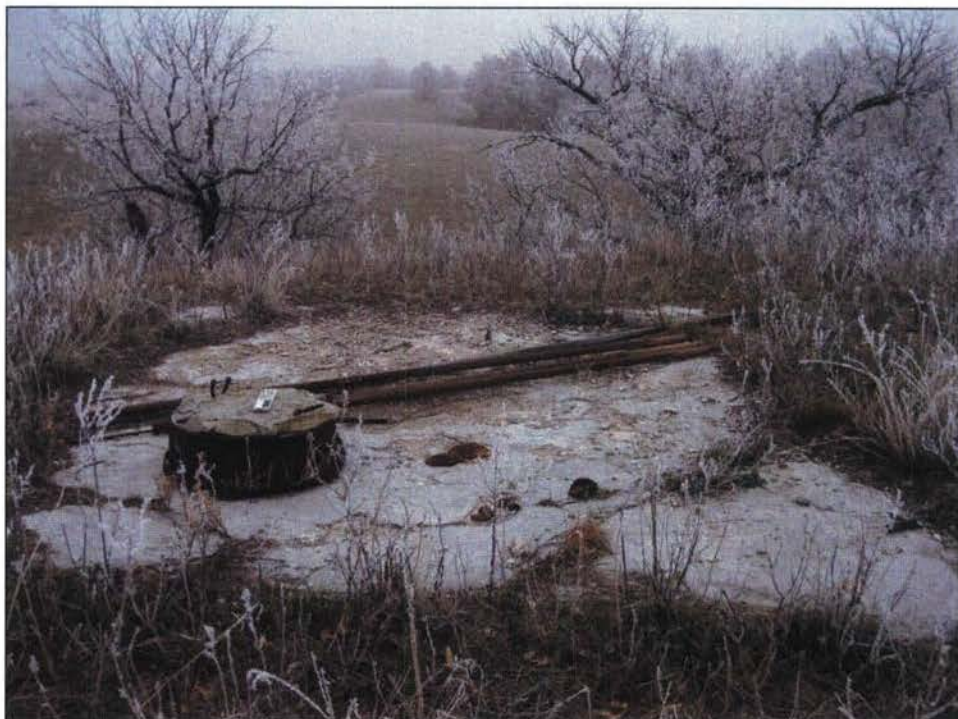
Figure 38. 25DW360 Feature F6, cistern, facing north. Photograph taken by Shane Rosenthal, on 11/20/2010.