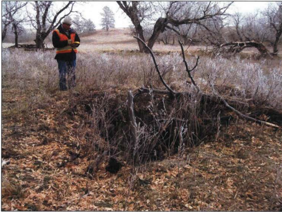
Figure 33. 25DW360 Feature F2, root cellar, facing south. Photograph taken by Shane Rosenthal, on 11/20/2010.