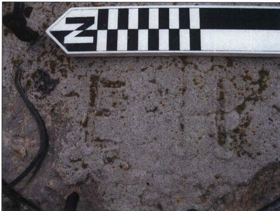
Figure 40. 25DW360 Feature F6, cistern stamp "EH". Photograph taken by Shane Rosenthal, on 11/20/2010.