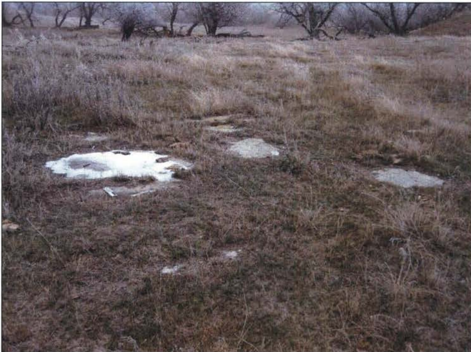
Figure 36. 25DW360 Feature F4, concrete slab foundation, facing northeast. Photograph taken by Shane Rosenthal, on 11/20/2010.