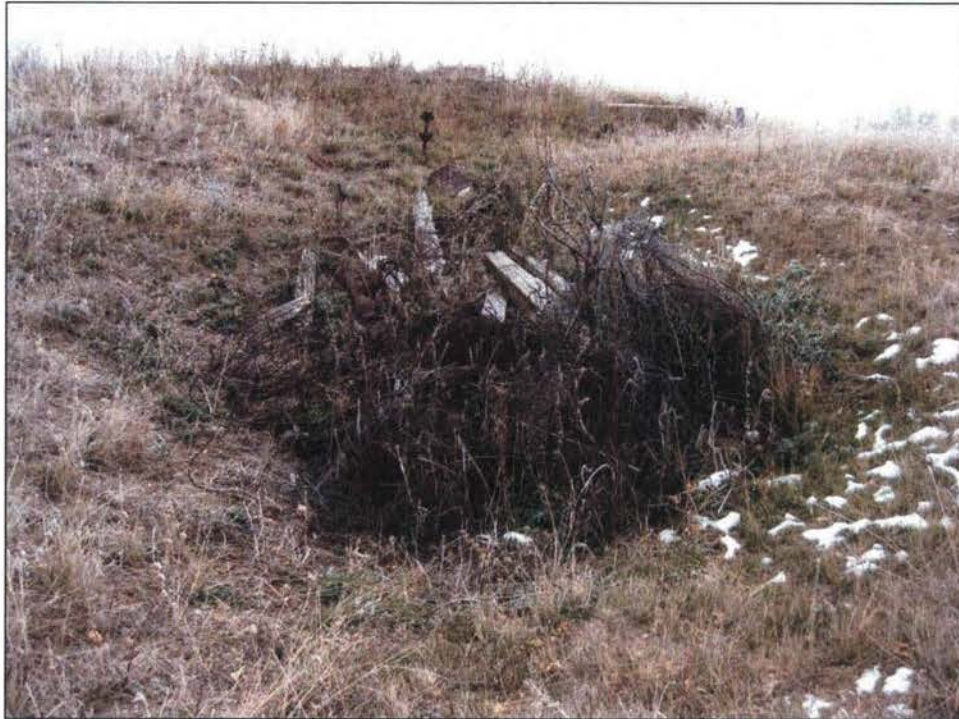
Figure 37. 25DW360 Feature F5, dugout with cistern (Feature F6) in background, facing east. Photograph taken by Shane Rosenthal, on 11/20/2010.