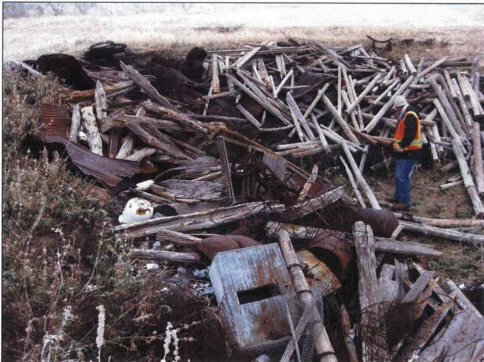
Figure 42. 25DW360 Feature F7, dugout contents, facing south. Photograph taken by Shane Rosenthal, on 11/20/2010.