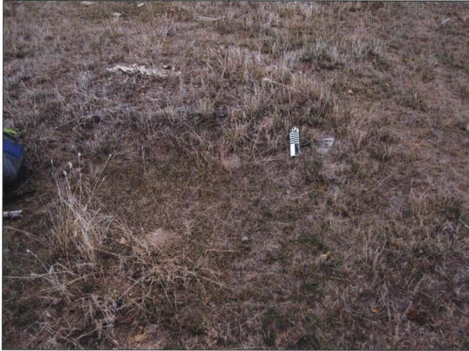
Figure 45. 25DW360 Feature F9, partial foundation, facing north. Photograph taken by Shane Rosenthal, on 11/20/2010.