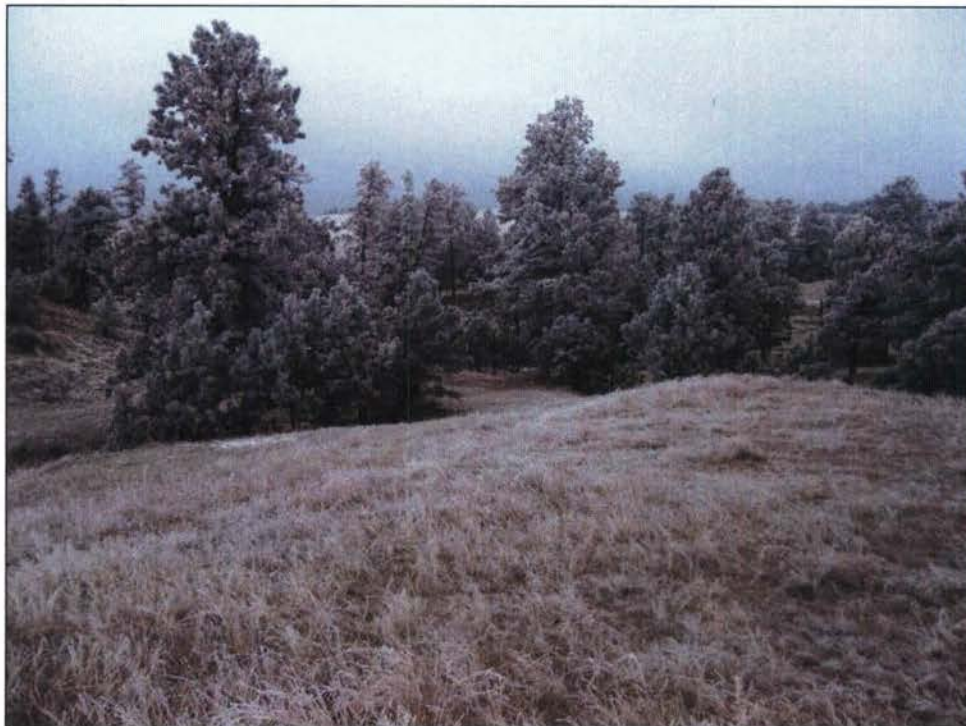
Figure 9. Disturbance (slash pile center of photo) in Section 35 T30N R51W, facing south. Photograph taken by S. Rosenthal on 11/21/2010.