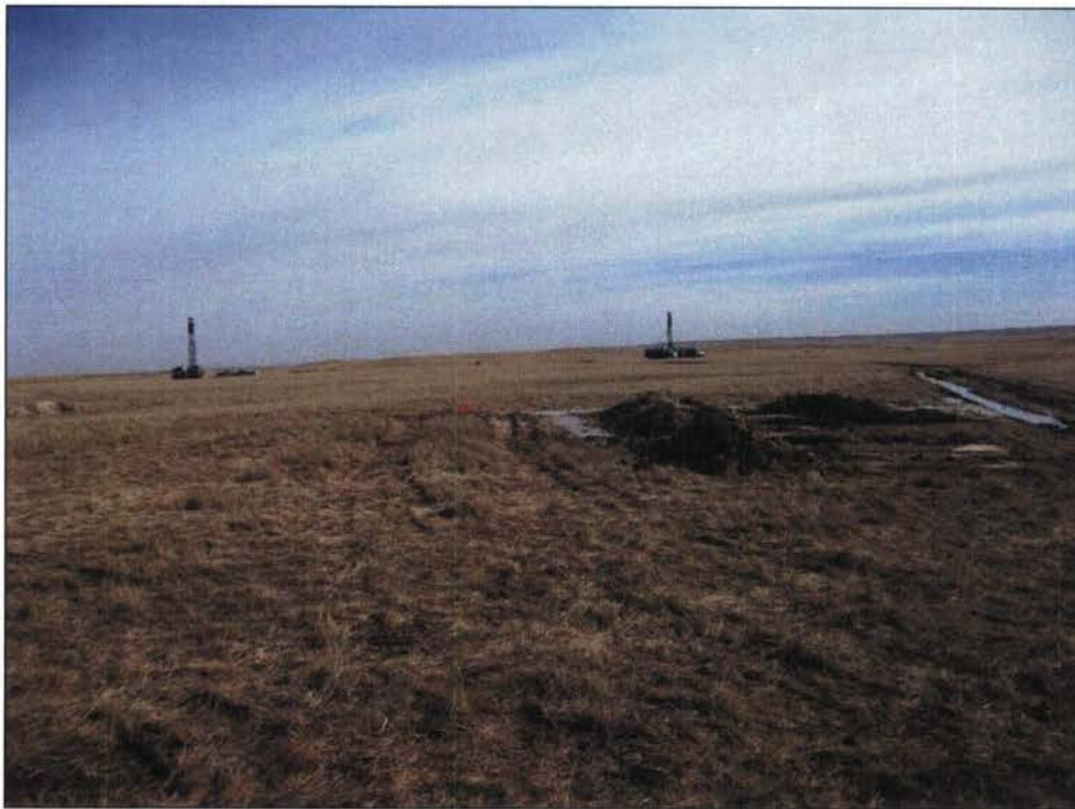
Figure 11. Disturbance (monitor wells) in Section 18 T29N R50W, facing southeast. Photograph taken by A. Howder on 12/17/2010.