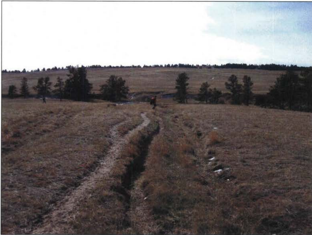
Figure 10. Disturbance (erosion, animal trails, cultivation) in Section 2 T29N R51W, facing south. Photograph taken by N. Graves on 12/02/2010.