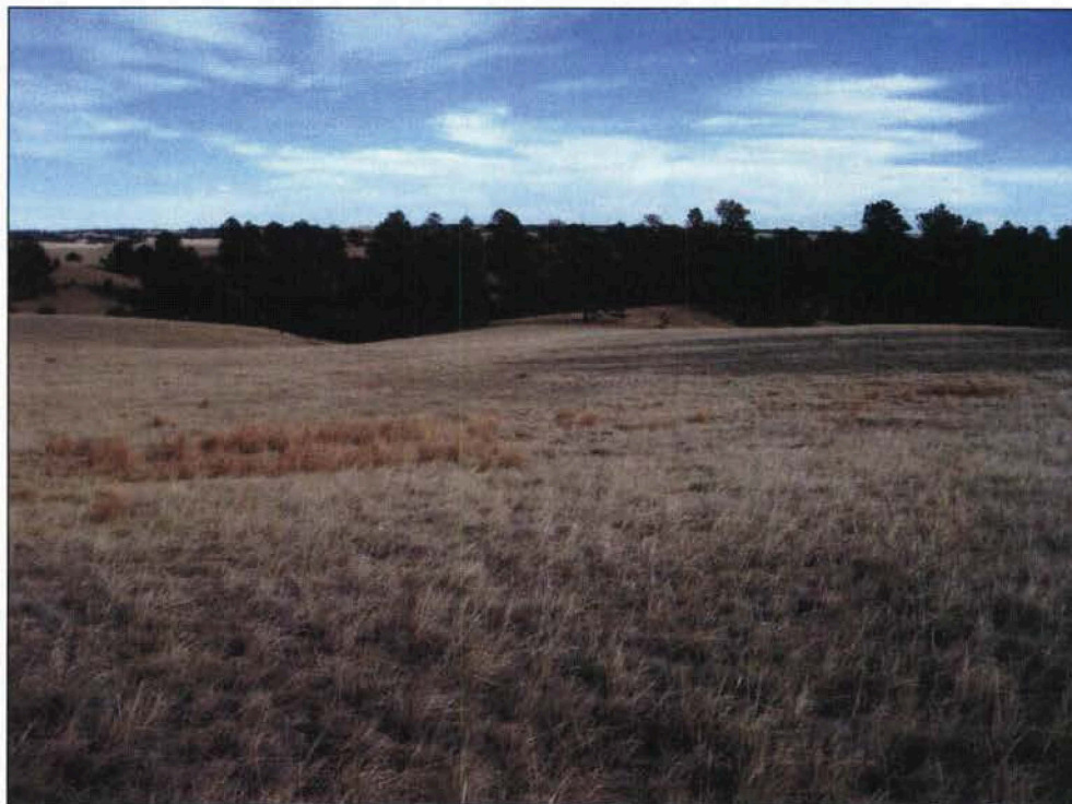
Figure 5. Project overview in Section 2 T29N R51W, facing northeast. Photograph taken by A. Howder on 12/03/2010.