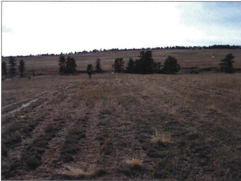
Figure 4. Project overview in Section 35 T30N R51W, facing south. Photograph taken by N. Graves, on 12/02/2010.