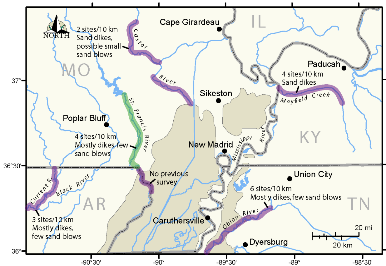
Figure 2 Map of paleoliquefaction study in Missouri. River segments identified in the NRC's letter of [date] are delineated in purple. The NRC has conducted, and may continue, field work in these purple delineated river segments. Additional river segments where the NRC proposes to expand its field work are delineated in green.