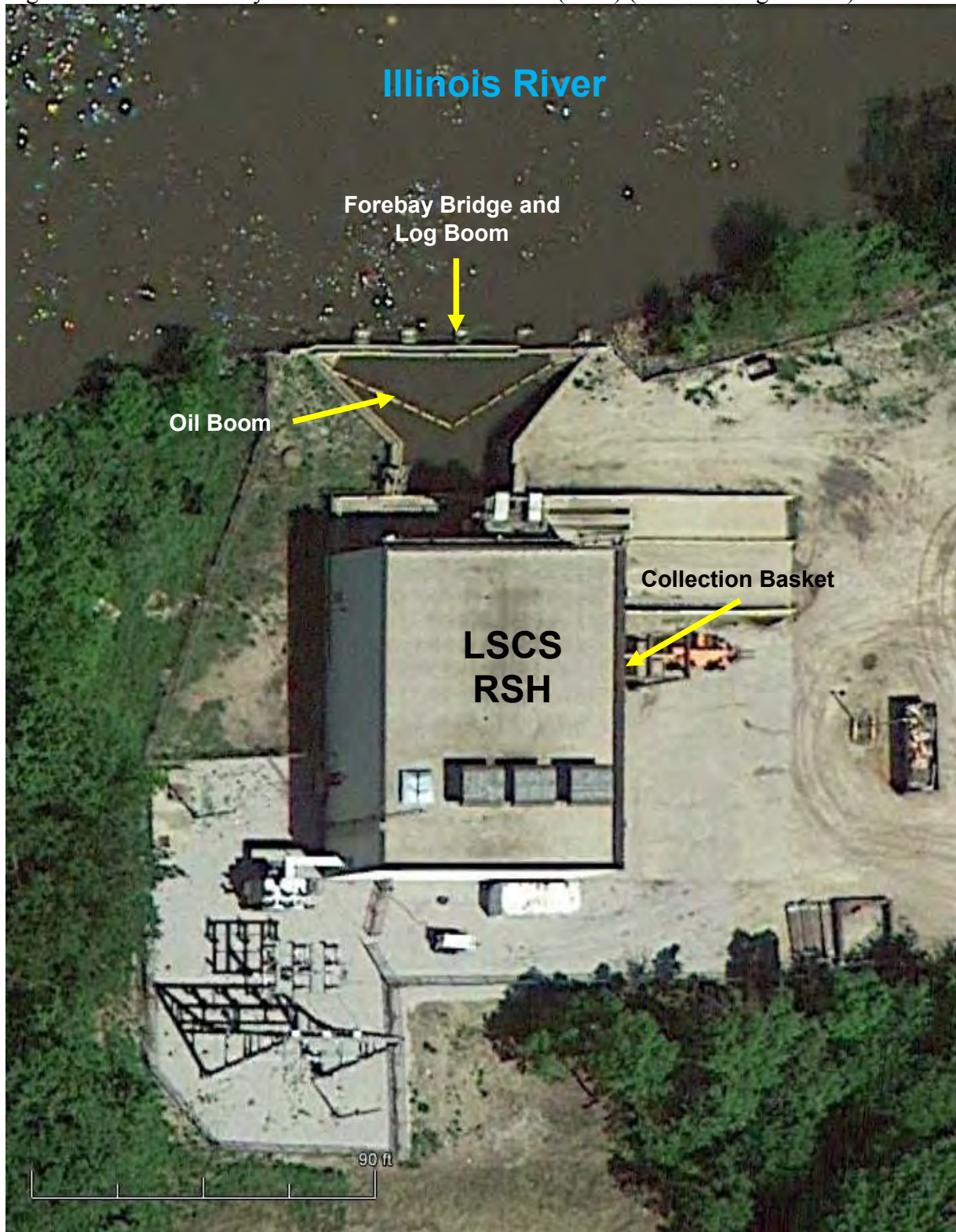
Figure 1. LaSalle County Station River Screen House (RSH).