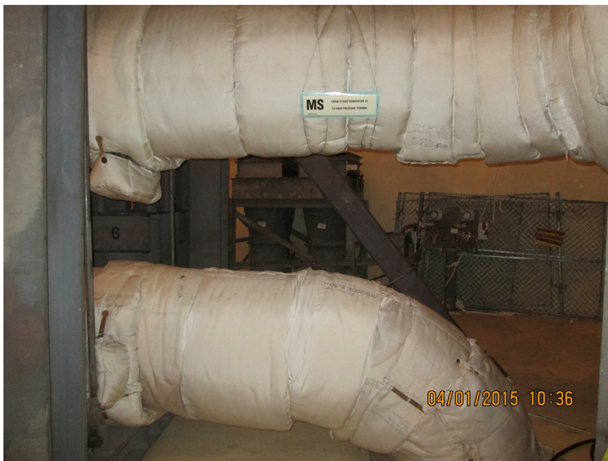
Insulation on Main Steam Line

APRIL 2, 2015, CONTAINMENT WALKDOWN PICTURES