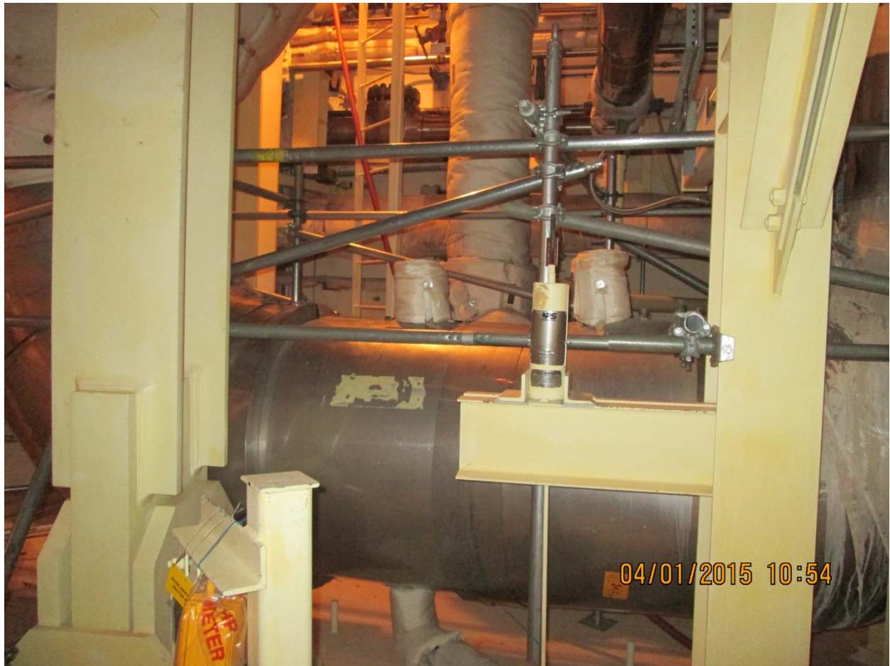
Piping Near Weld Location #1 on Pressurizer Surge Line