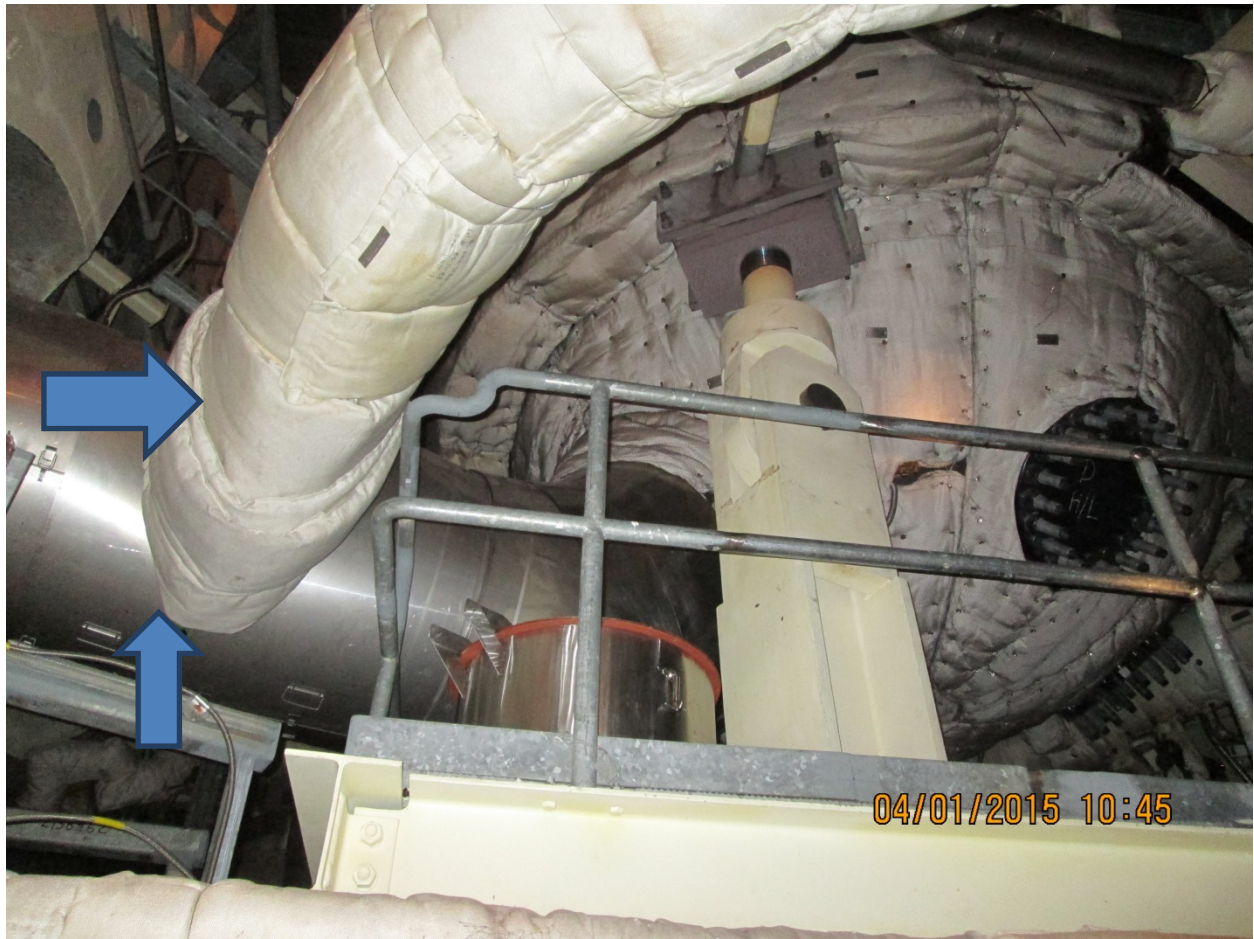
Weld Location #3 on Hot Leg and # 2 on the Surge Line