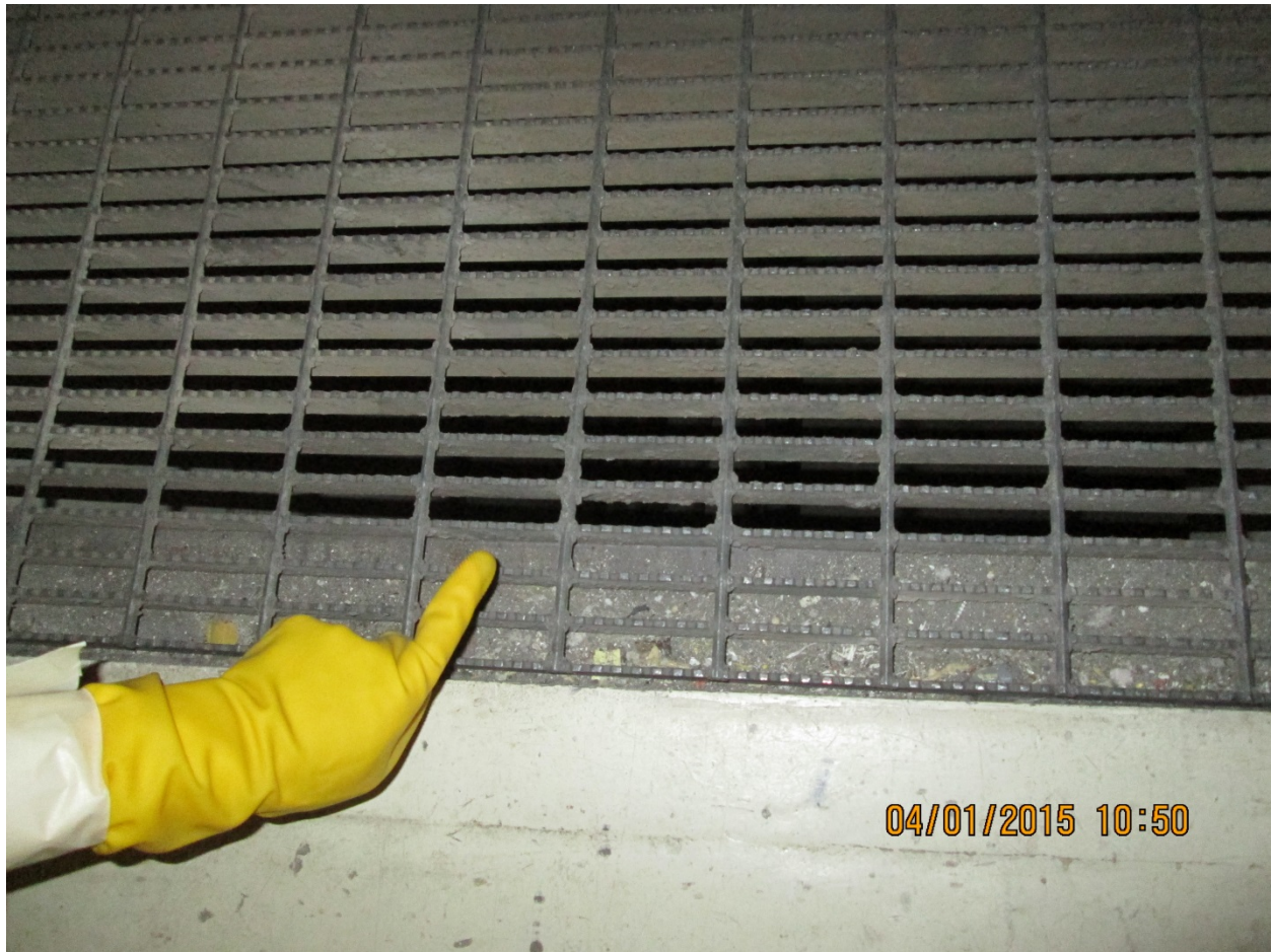
Grating in the floor of containment