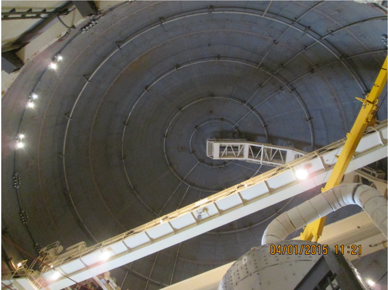
Containment spray ring headers at the top of containment