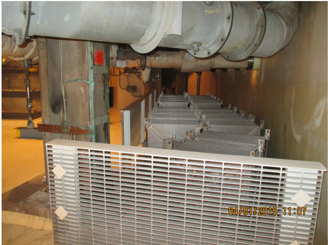
A bay of Recirculation Sump Strainers