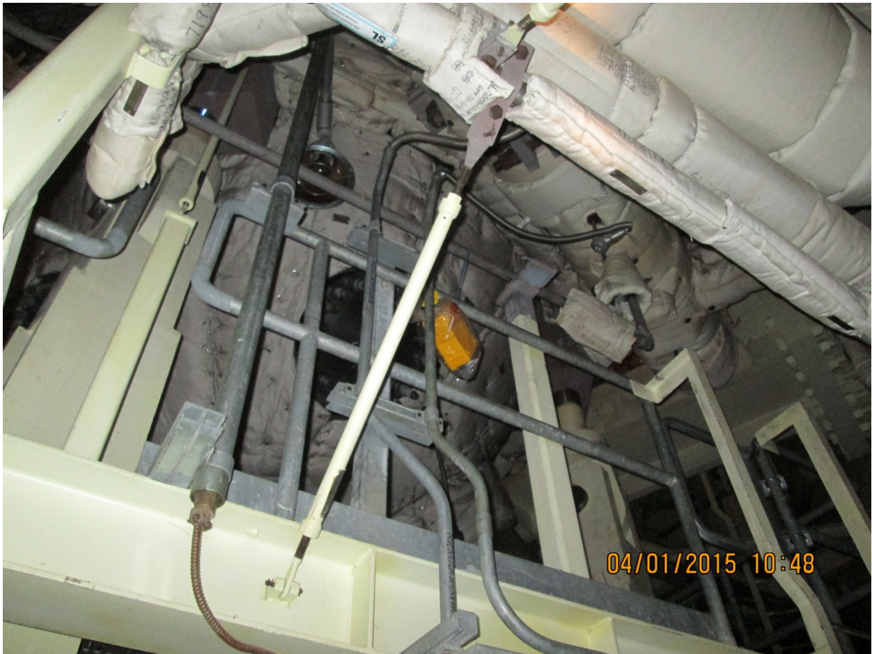
Piping Near Weld Location #2 on Pressurizer Surge Line near Hot Leg