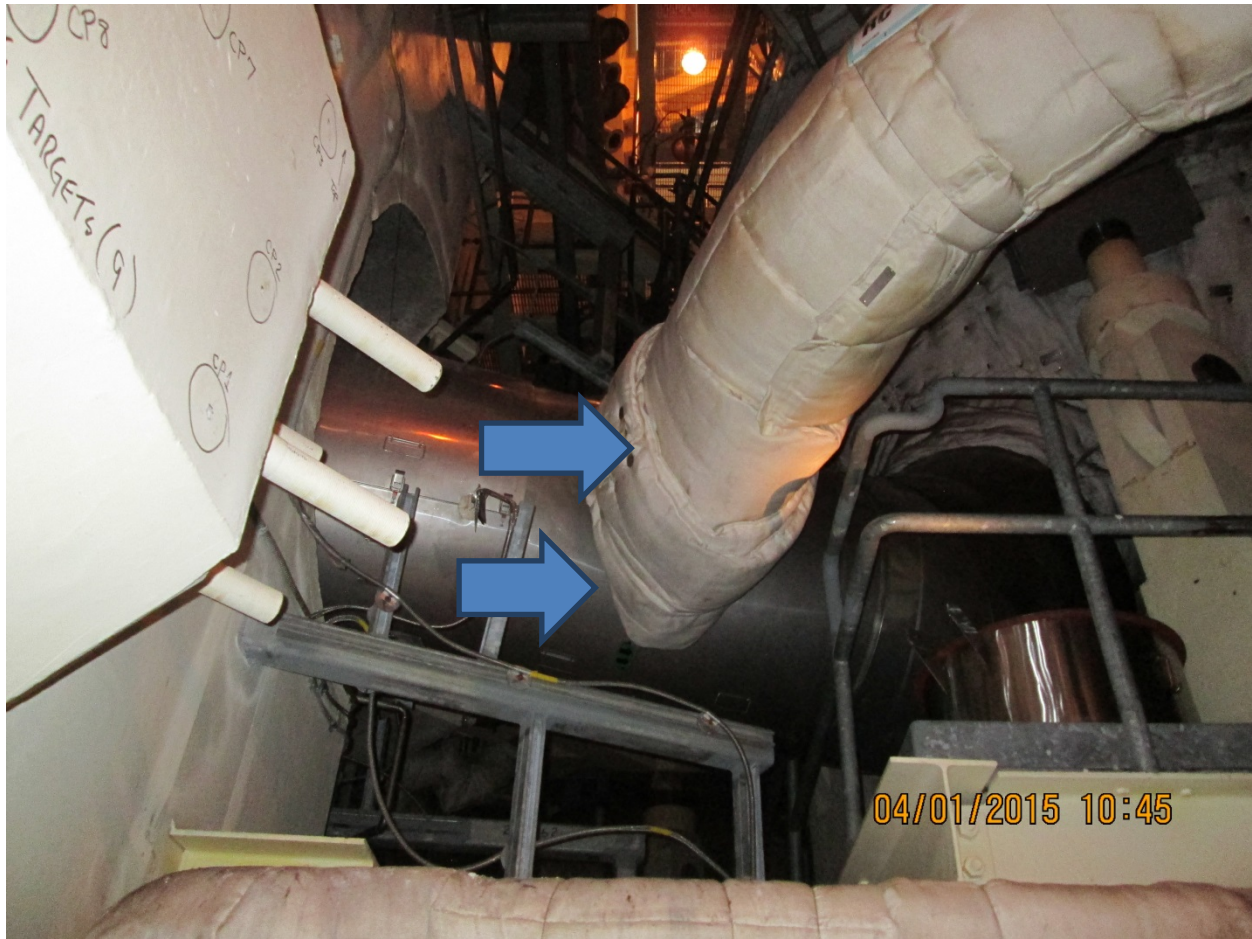
Weld Location #3 on Hot Leg and #2 on Surge Line