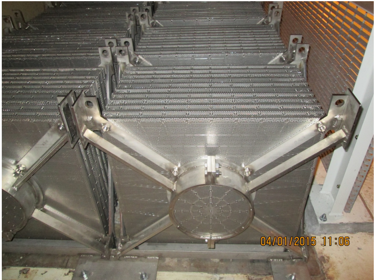
Recirculation Sump Strainers