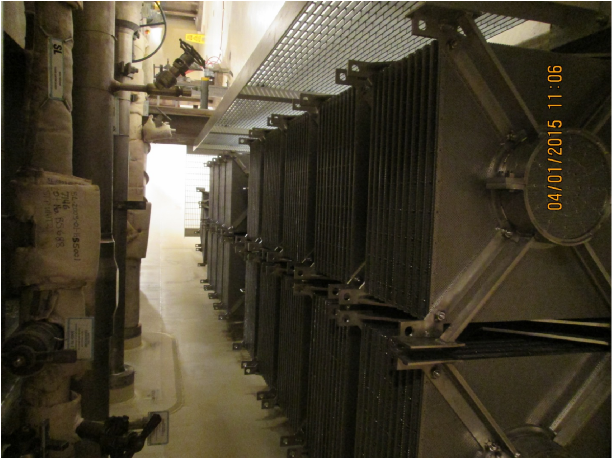
A bay of Recirculation Sump Strainers