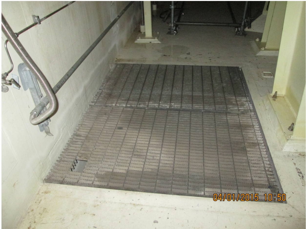
Grating in the floor of containment near observed weld locations