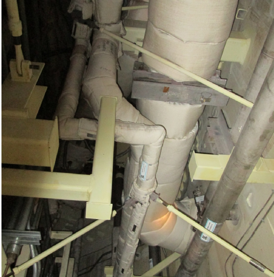
Piping Near Weld Location #2 on Pressurizer Surge Line near Hot Leg