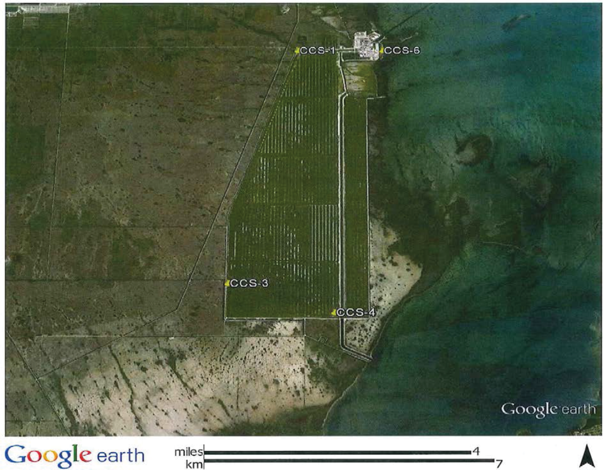
Figure 1 – Turkey Point Cooling Canal Sample Locations