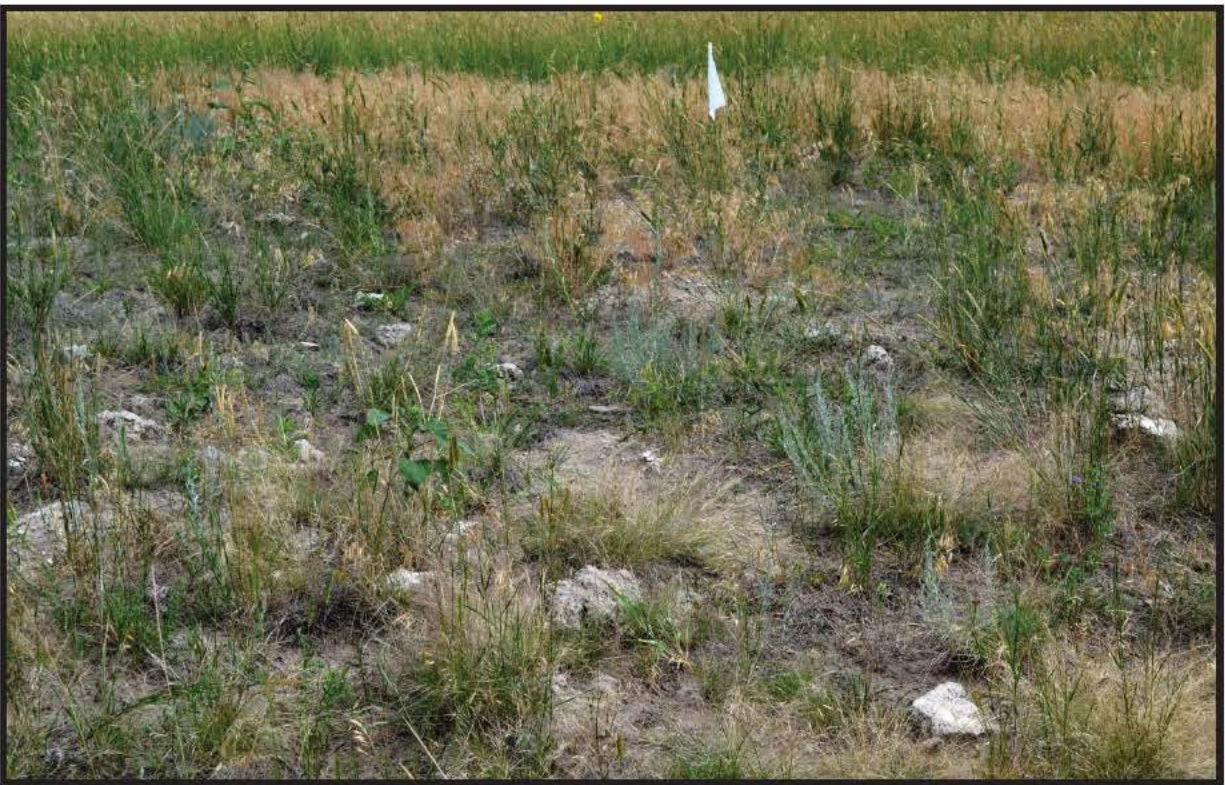
Figure 4.1 Tribal Site No. 1. Top: Overview of area, looking south, with the pin flags representing possible feature Nos. 1–5 (No. 1 in the foreground); Bottom: Close-up of feature No. 6, looking east