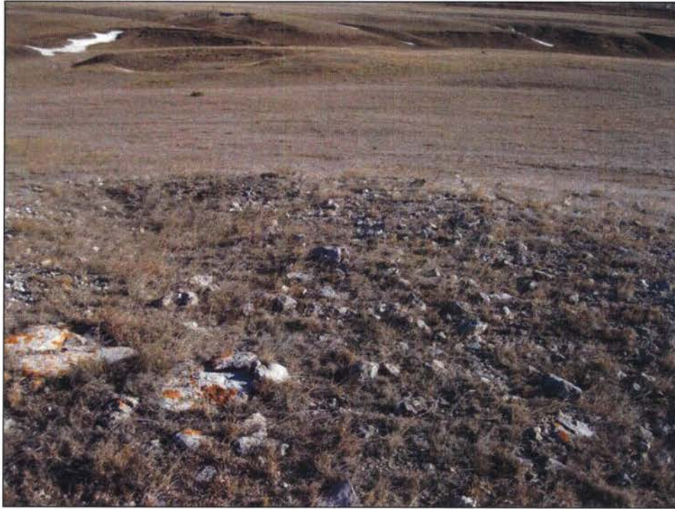
Figure 126. 25DW371, Feature F18, facing north. Photograph taken by Ashley Howder on 2/17/11.