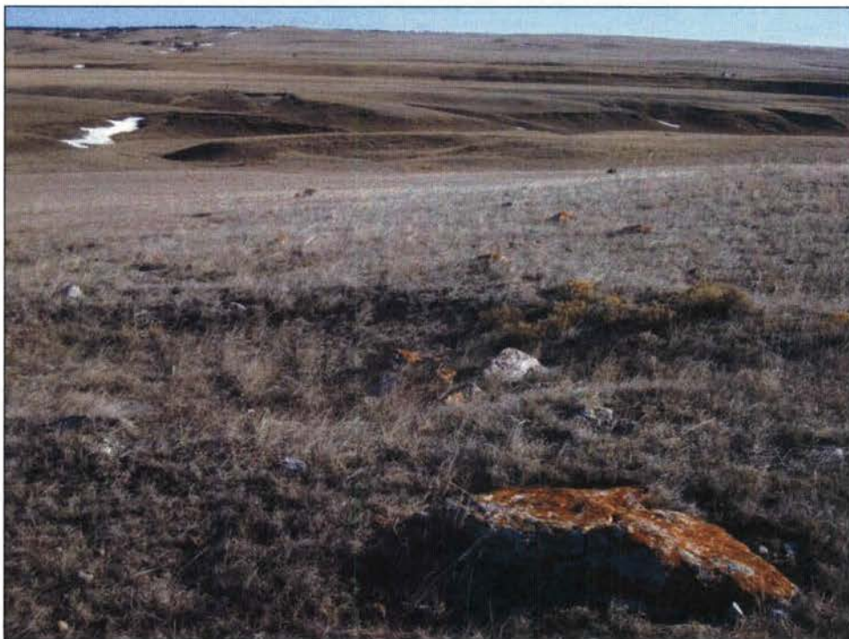
Figure 117. 25DW371, Feature F3, facing northeast. Photograph taken by Ashley Howder on 2/17/11.