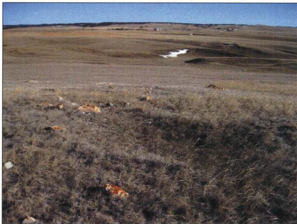
Figure 120. 25DW371, Feature F6, facing north.