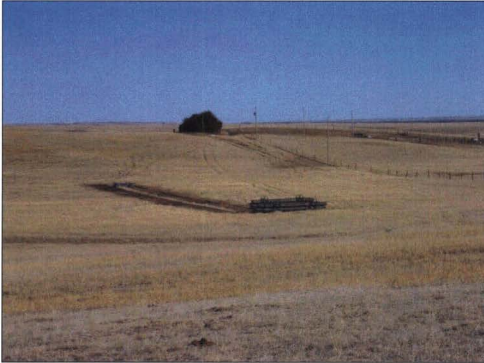
Figure 113. 25DW370, site overview with tree wind break and livestock enclosure containing utility poles and a stock tank, facing east. Photograph taken by Ashley Howder on 2/16/11.