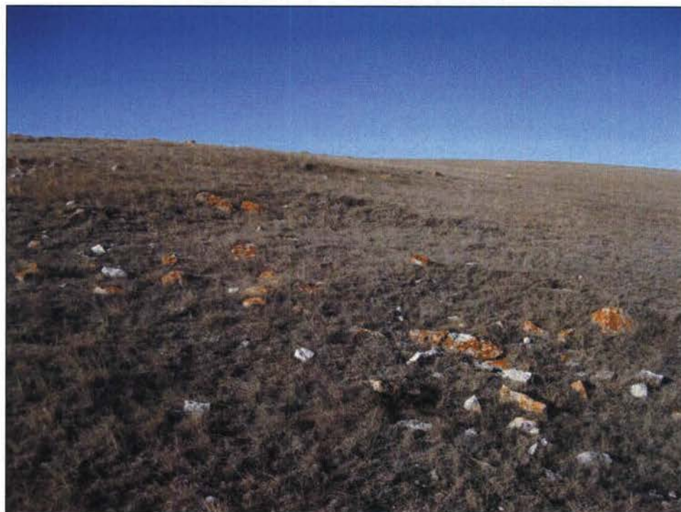
Figure 121. 25DW371, Feature F7 (to left) and Feature F8 (to right), facing southwest. Photograph by Ashley Howder on 2/17/11.