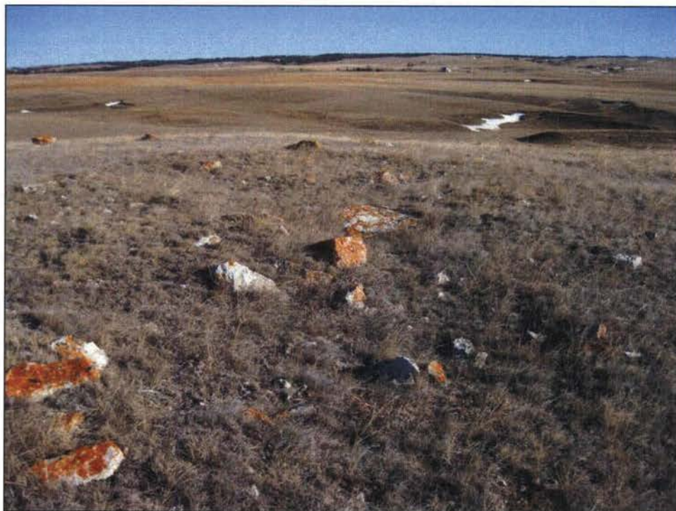
Figure 118. 25DW371, Feature F4, facing north. Photograph taken by Ashley Howder on 2/17/11.