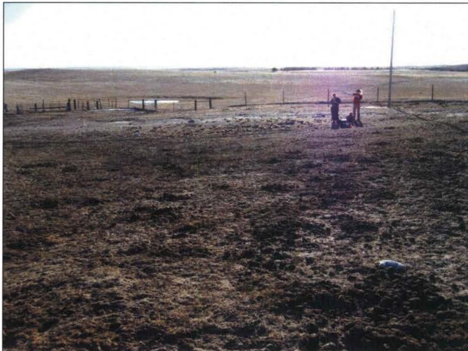
Figure 112. 25DW370, site overview with foundation (Feature F1) and brick scatter, facing southwest. on 2/16/11.