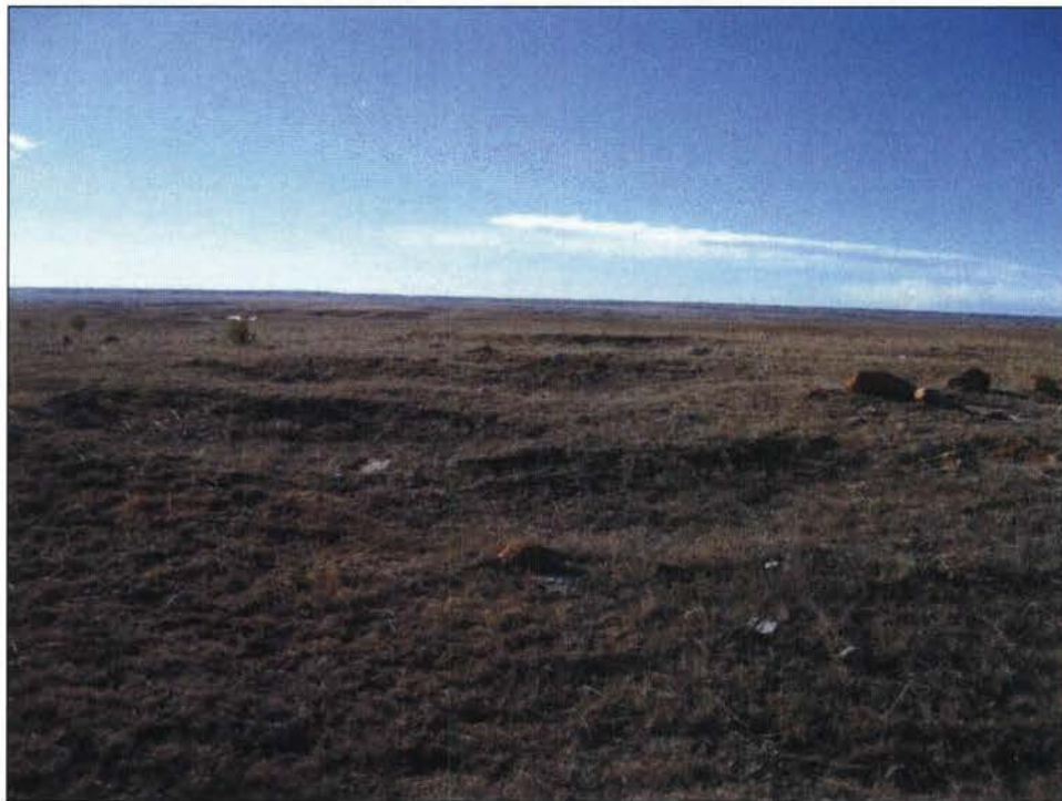
Figure 122. 25DW371, Feature F9 (downhill), Feature F10 (middle), and Feature F11 (uphill), facing south.