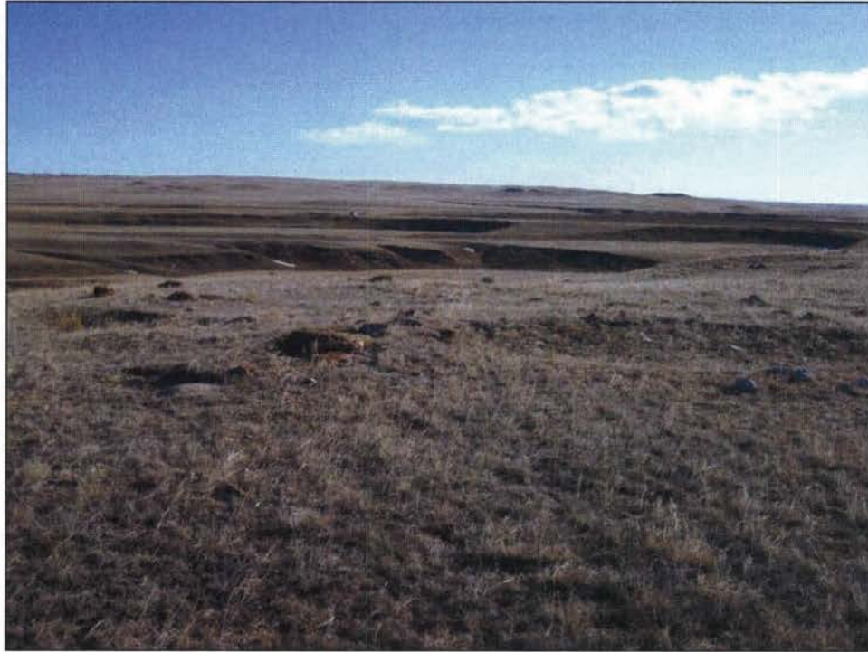
Figure 116. 25DW371, Feature F1 (to left) and Feature F2 (to right), facing northeast.