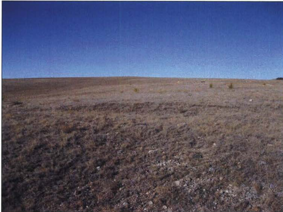
Figure 127. 25DW371, Feature F19, facing west.