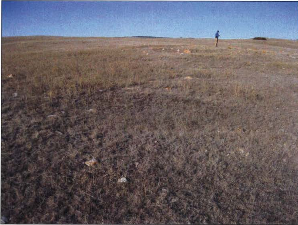
Figure 124. 25DW371, Feature F15, facing west.