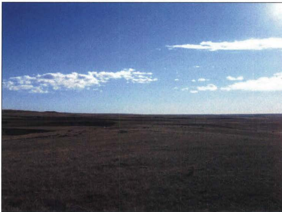
Figure 115. 25DW371, site overview, facing east. Photograph taken by Ashley Howder on 2/17/11.

automatically exclude this site as eligible for the National Register. Significance was assessed following intensive survey and a historic records search that included a files search and architectural/structures property search conducted through the Nebraska SHPO; review of the National Register of Historic Places (NRHP) database for Dawes County, Nebraska; review of the National Historic Landmark inventory (NHL); review of General Land Office (GLO) Plats; and local literature review; that revealed sustained Euro-American historic occupation in this area occurred between 1890 to present day, and no leases or purchasers were found that can be associated with an important person or persons of "significance in history" or having an uncommon ethnic affiliation. Finally, the depression features at site 25DW371 lack a unique design or any other unusual physical characteristic. Therefore, site 25DW371 does not possess enough significance to qualify for the National Register. Site 25DW371 is a historic quarry site likely associated with historic and early modern ranching or farming activities in the region that ARCADIS recommends not eligible for listing on the NRHP and no further work is necessary.