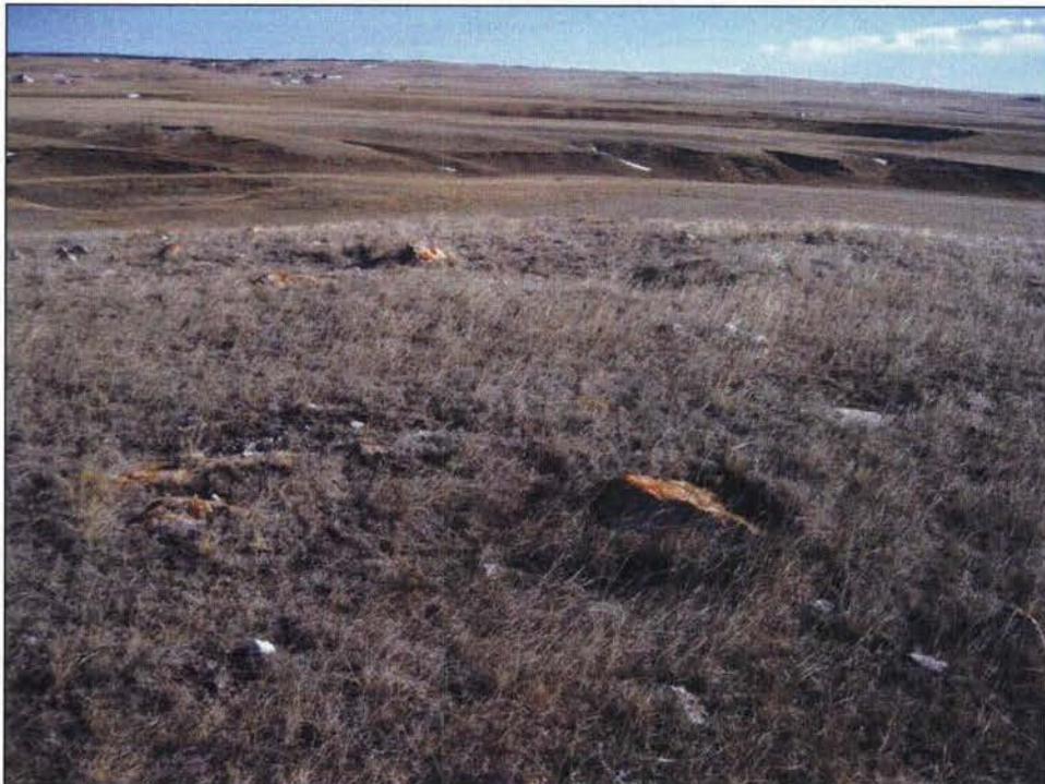
Figure 125. 25DW371, Feature F16 (foreground) and Feature F17 (background), facing west.