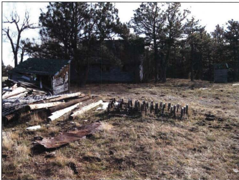
Figure 79. 25DW365, shown from left to right: oil shed (Feature F4), north face of main farm house (Feature F1), and outhouse (Feature F2), facing south.