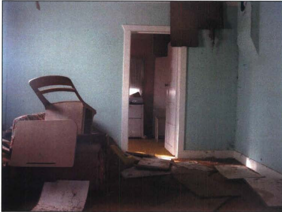
Figure 78. 25DW365, interior of Farm House (Feature F1) showing southeastern room. Photograph taken by Ashley Howder, on 12/03/2010.