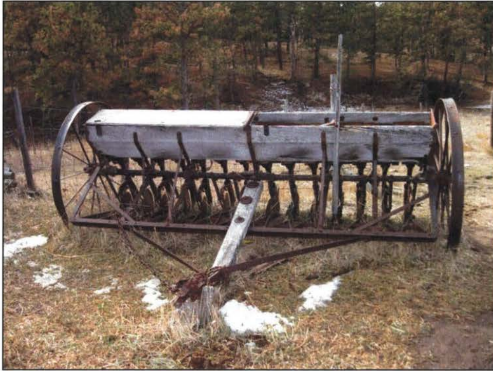
Figure 86. 25DW365, Van Brunt grain drill, facing west. Photograph taken by Ashley Howder, on 12/03/2010.