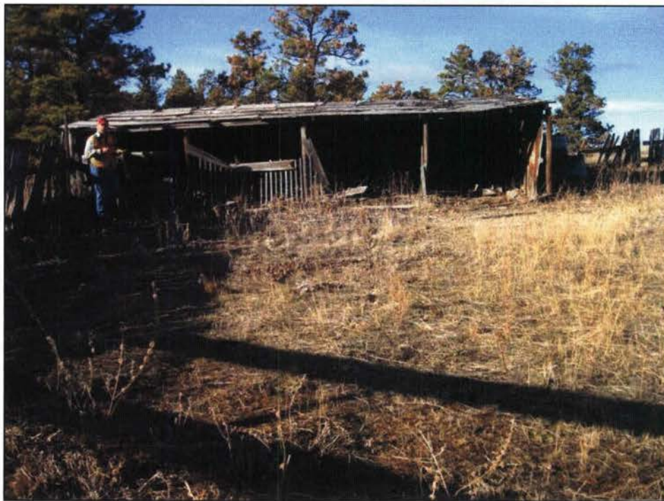
Figure 85. 25DW365, livestock shelter (Feature F10), facing north. on 12/03/2010.