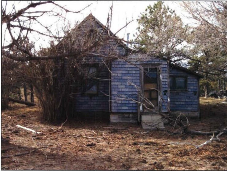
Figure 77. 25DW365, Farm House (Feature F1), facing west. Photograph taken by Ashley Howder, on 12/03/2010.

25DW365 lack a unique design and any other unusual physical characteristic. Therefore, site 25DW365 does not possess enough significance to qualify for the National Register. Site 25DW365 is a common historic site likely associated with historic and early modern ranching or farming activities in the region that ARCADIS recommends not eligible for listing on the NRHP and no further work is necessary.