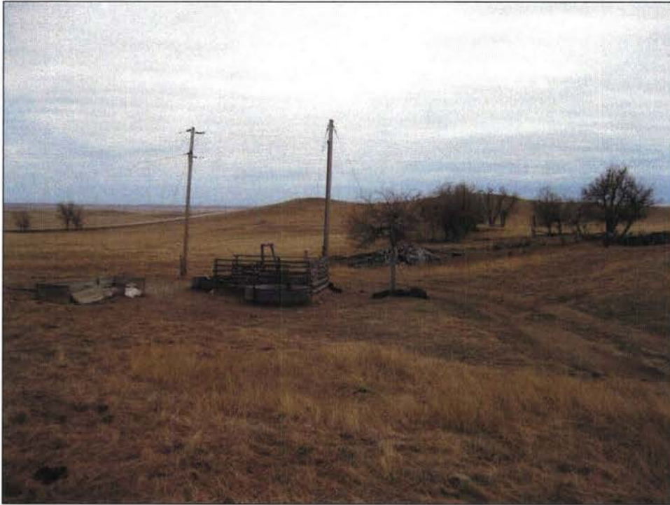
Figure 89. 25DW366, site overview, facing southeast.