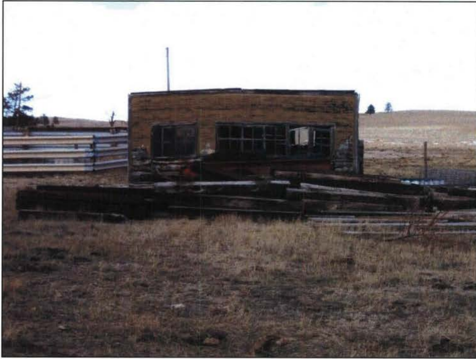
Figure 84. 25DW365, chicken coop (Feature F9), facing north. Photograph taken by Ashley Howder, on 12/03/2010.