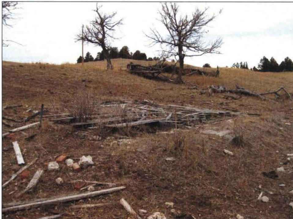
Figure 90. 25DW366, Feature F1 house foundation, facing northwest. Photograph taken by Russ Collett 12/3/10.