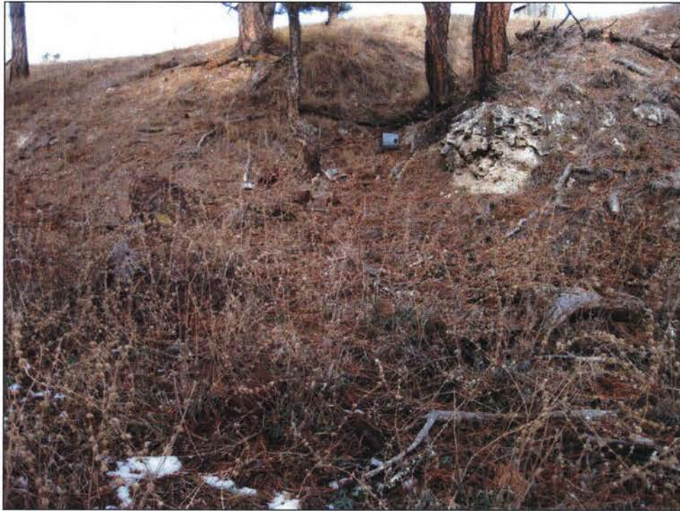
Figure 82. 25DW365, small debris dump (Feature F6), facing northeast. Photograph taken by Ashley Howder, on 12/03/2010.