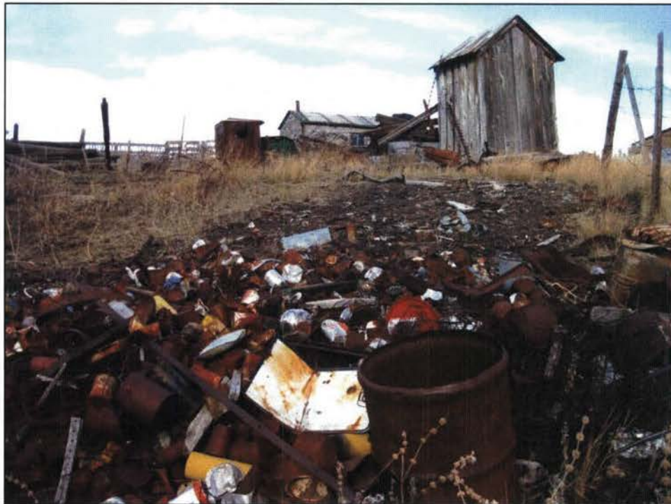
Figure 81. 25DW365, main debris dump (Feature F5) with small oil/storage shed (Feature F8) and laundry shed (Feature F7) in background, facing east. Photograph taken by Ashley Howder, on 12/03/2010.