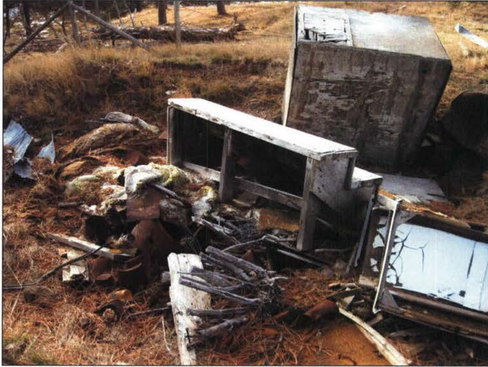
Figure 80. 25DW365, small debris pile (Feature F3) behind main house (Feature F1), facing west. Photograph taken by Ashley Howder, on 12/03/2010.