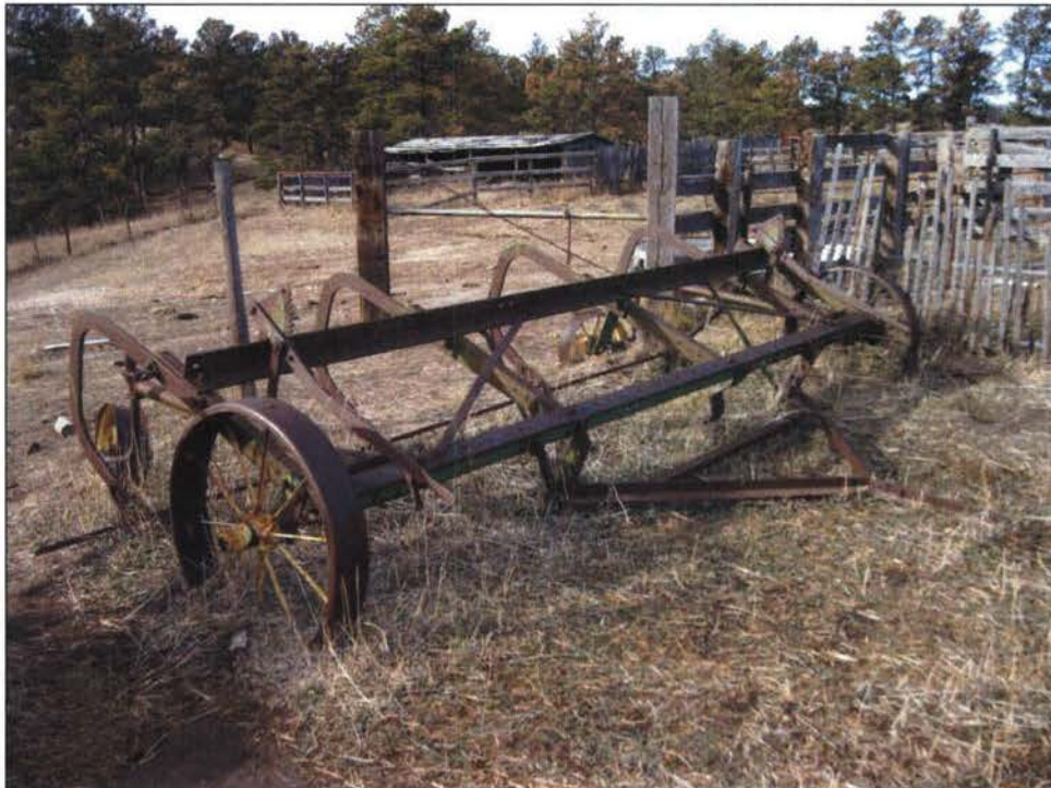
Figure 87. 25DW365, John Deere rod weeder, facing northwest. Photograph taken by Ashley Howder, on 12/03/2010.