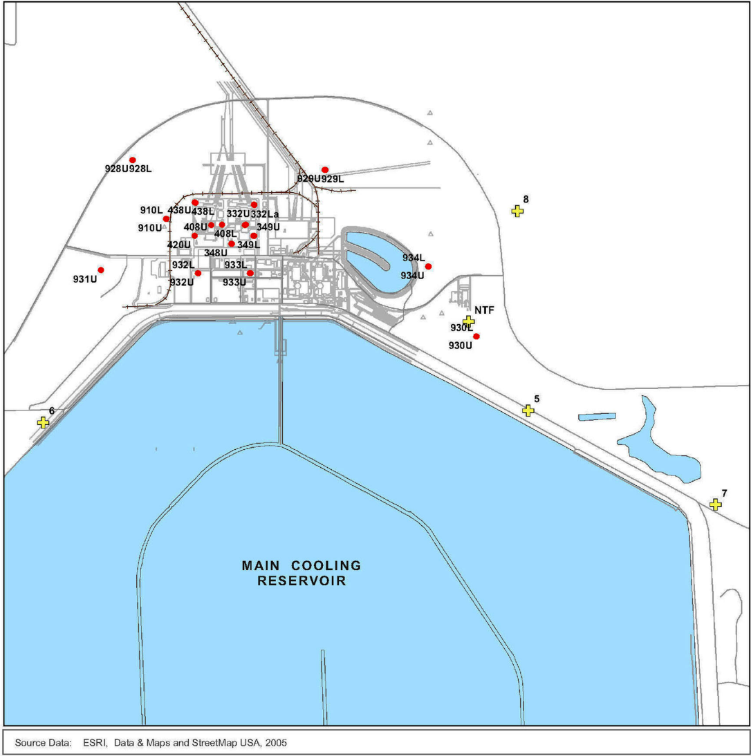
Figure 6.3-2 Hydrological Monitoring Locations - Groundwater