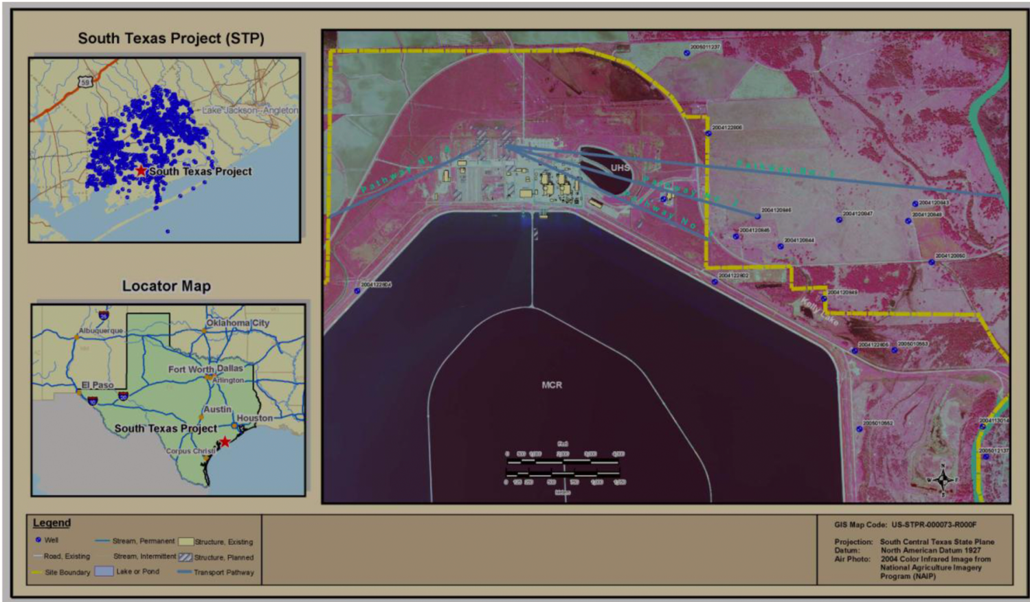
Figure 2.4S.13-2 Groundwater Transport Pathways