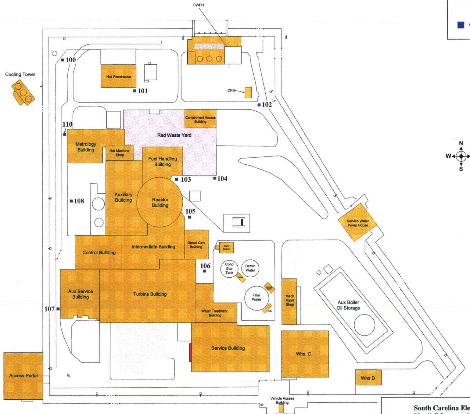
South Carolina Electric & Gas Co Virgil C Summer Nuclear Station RADIOLOGICAL MONITORING PROGRAM PROTECTED AREA GROUNDWATER SITES